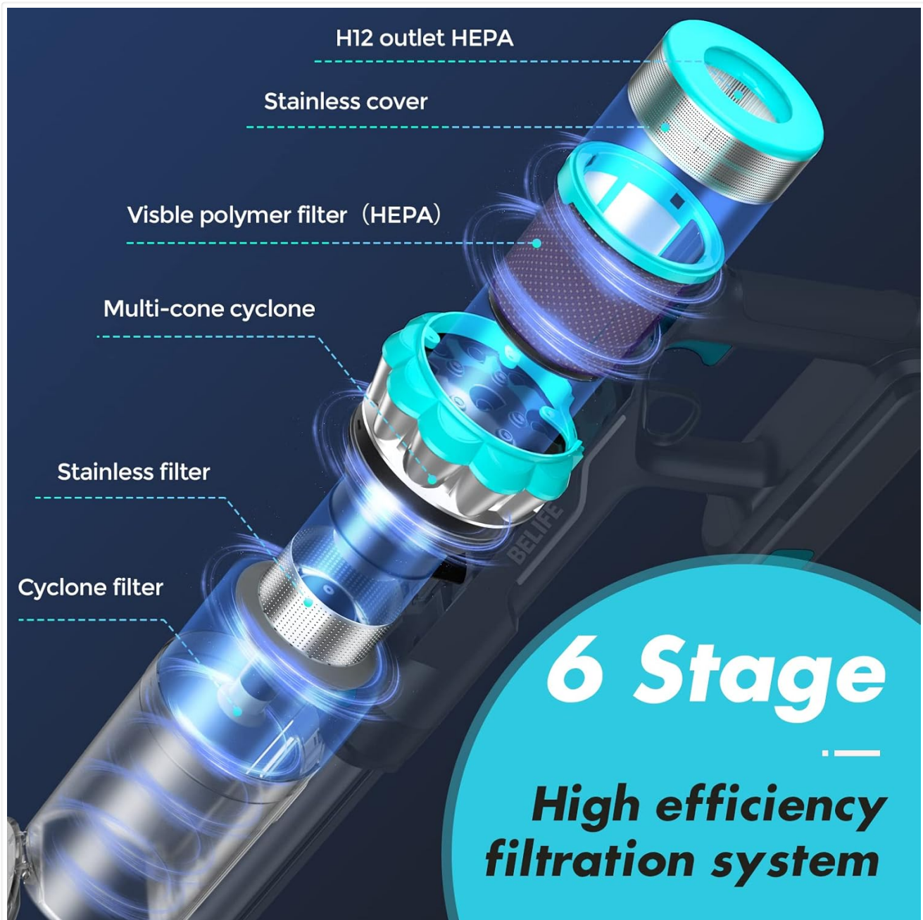
Image: An exploded diagram illustrating the 6-stage high-efficiency filtration system of the Belife vacuum cleaner, highlighting components like the H12 outlet HEPA, stainless cover, visible polymer filter (HEPA), multi-cone cyclone, stainless filter, and cyclone filter.

Once installed, the HEPA filter works automatically as part of your vacuum cleaner's 6-stage high-efficiency filtration system. It is designed to capture microscopic particles, including dust mites, pet dander, pollen, and other allergens, ensuring cleaner exhaust air.