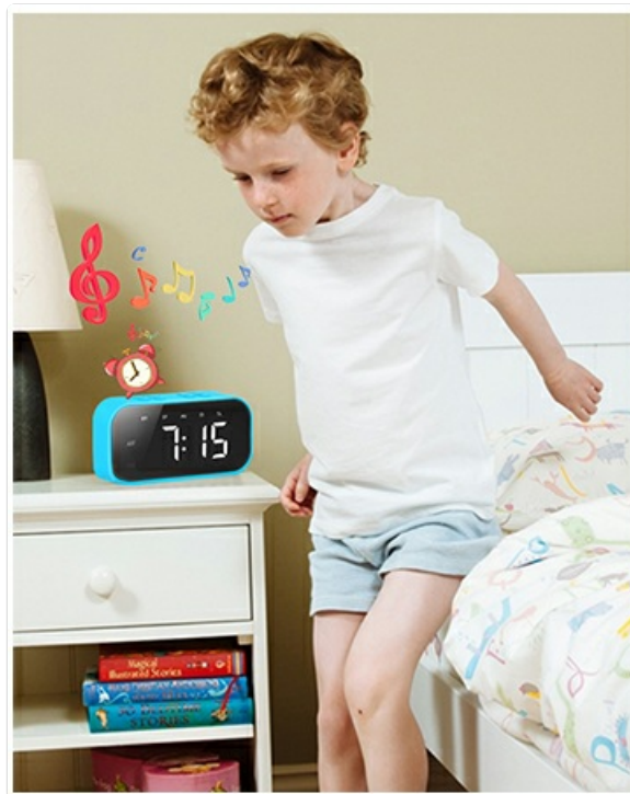
Figure 5.2: Bluetooth 5.0 Speaker compatibility.

This video demonstrates the step-by-step process of connecting your device to the AFK Digital Alarm Clock via Bluetooth and playing music. It shows how to power on the clock, observe the blinking Bluetooth indicator, and pair with "BT501" on a smartphone, followed by playing audio and adjusting volume.