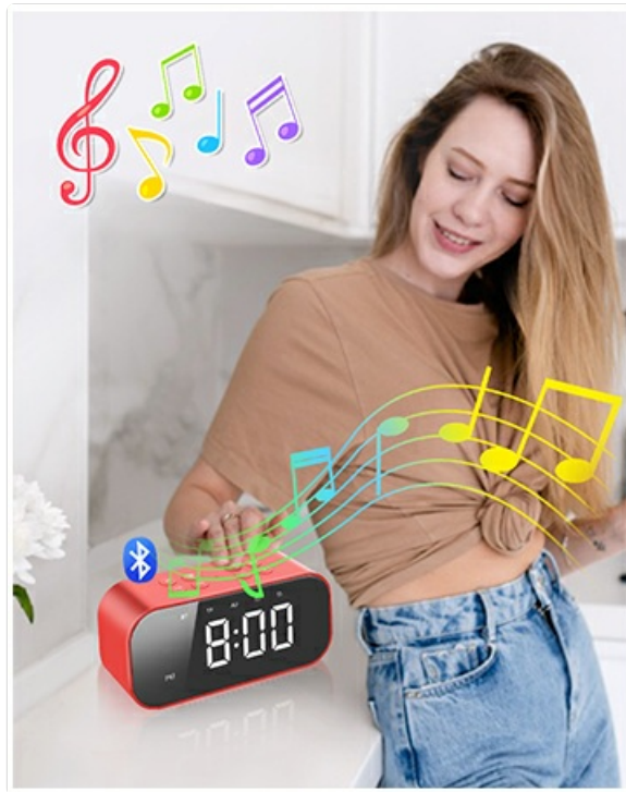
Figure 5.3: Powerful Stereo Audio.

This diagram illustrates the internal components responsible for the powerful stereo audio, including 45mm speakers and a passive diaphragm, ensuring high-fidelity sound despite the compact size.