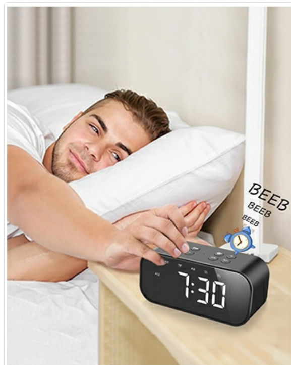
Figure 5.1: Dual Alarms & Snooze feature.

This image demonstrates the dual alarm capability, showing two distinct alarm times (07:30 and 08:00) set on the clock, ideal for different wake-up schedules.