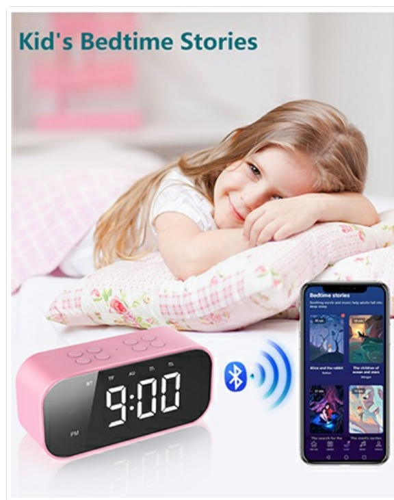
Figure 3.3: Multifunctionality overview.

This image illustrates the compact dimensions of the alarm clock, measuring approximately 5.5 inches in width and 1.7 inches in height, making it suitable for various spaces like nightstands or desks.