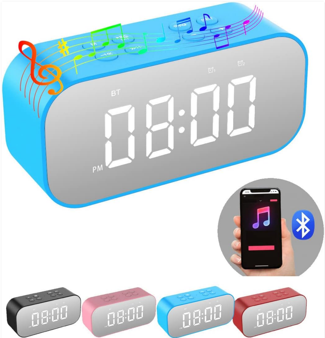
Figure 3.1: Front view of the AFK Digital Alarm Clock.

Familiarize yourself with the main components and features of your AFK Digital Alarm Clock.