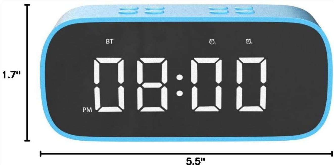
Figure 3.2: Product dimensions.

This image illustrates the compact dimensions of the alarm clock, measuring approximately 5.5 inches in width and 1.7 inches in height, making it suitable for various spaces like nightstands or desks.