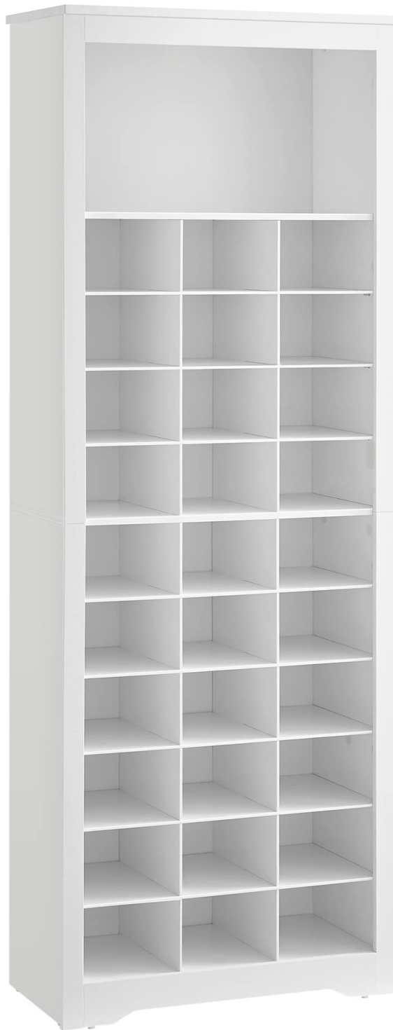
Image: The VASAGLE 10-Tier Shoe Storage Cabinet, a tall white unit with multiple compartments, shown in a bedroom setting.