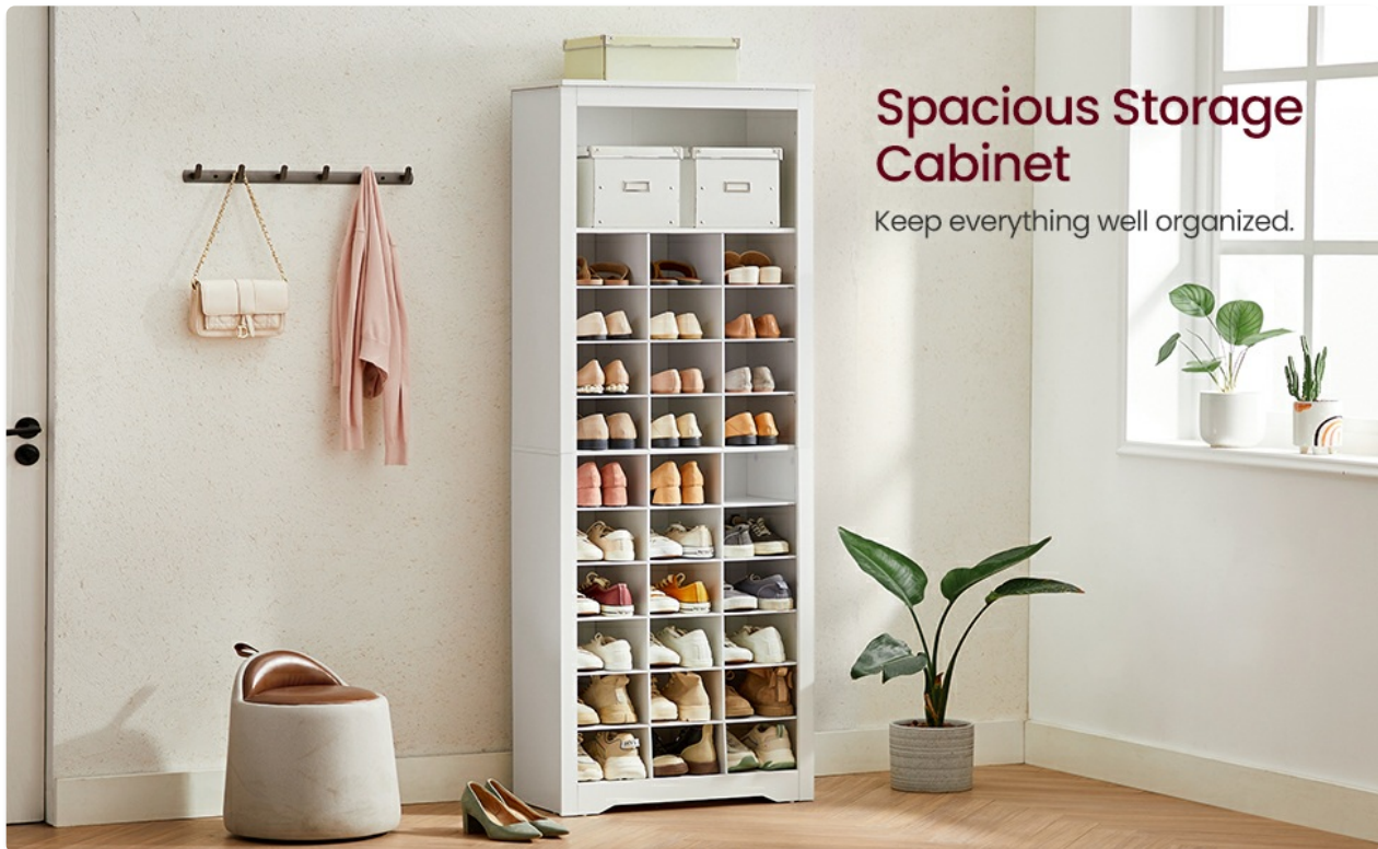
Image: An overall view of the spacious shoe storage cabinet, showcasing its capacity for various shoe types and additional storage on top.