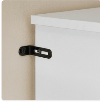
Image: A close-up view of the anti-tip kit securely fastened to the top of the shoe cabinet and the wall.