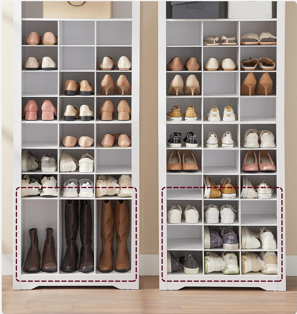
Image: The shoe cabinet demonstrating how shelves can be removed to create larger compartments for storing tall boots.

You can remove some shelves for tall boots.