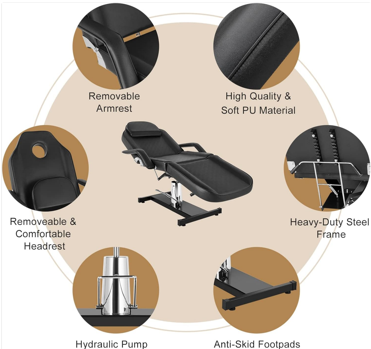
Image 3.1: Detailed view of the product's main features and components.