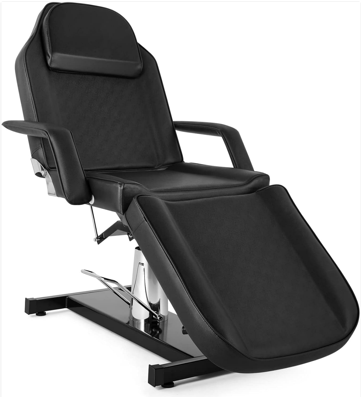
Image 1.1: The OmySalon Hydraulic Tattoo Chair Esthetician Bed shown in different configurations.