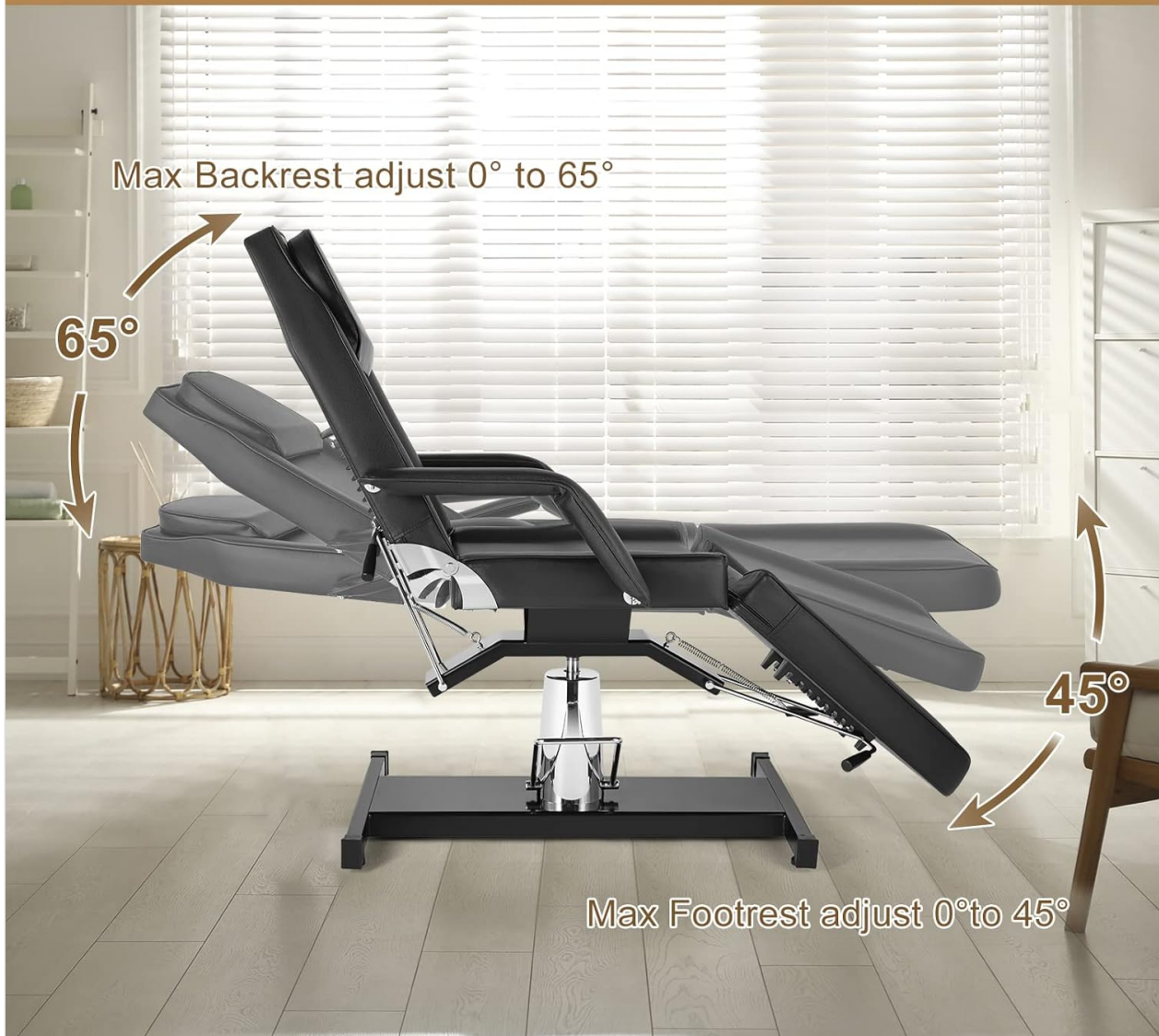
Image 5.2: The backrest adjusts up to 65° and the footrest adjusts down to 45°.