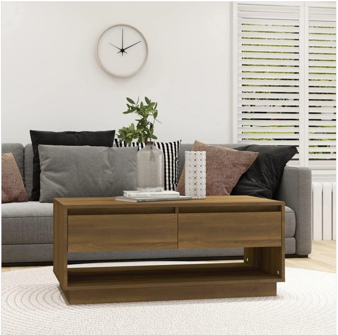
Image: The vidaXL Brown Oak Coffee Table with Storage Drawers, showcasing its design in a modern living room environment.