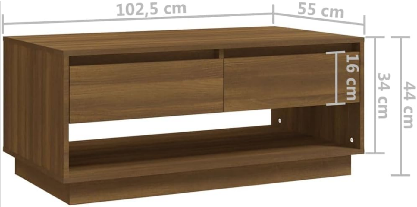
Image: Technical drawing illustrating the width, depth, and height dimensions of the coffee table.

Product Care Instructions: Wipe with Damp Cloth