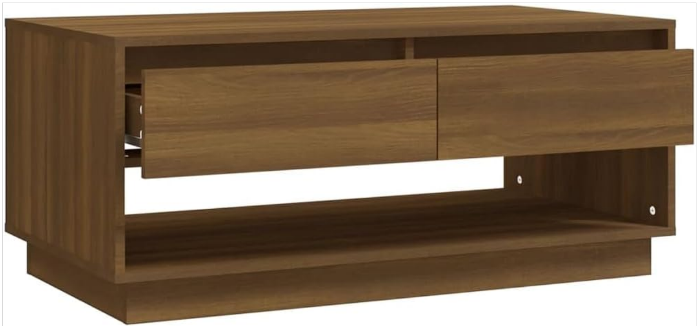
Image: The coffee table with one drawer partially open, illustrating the storage functionality.