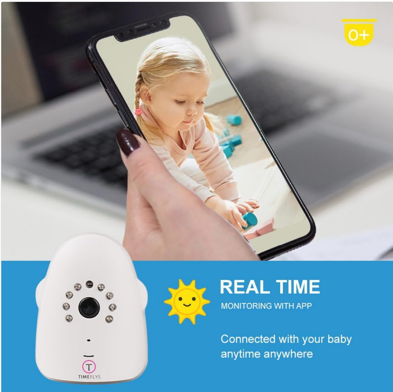
Image: A hand holding a smartphone displaying real-time video feed of a child, illustrating app monitoring.