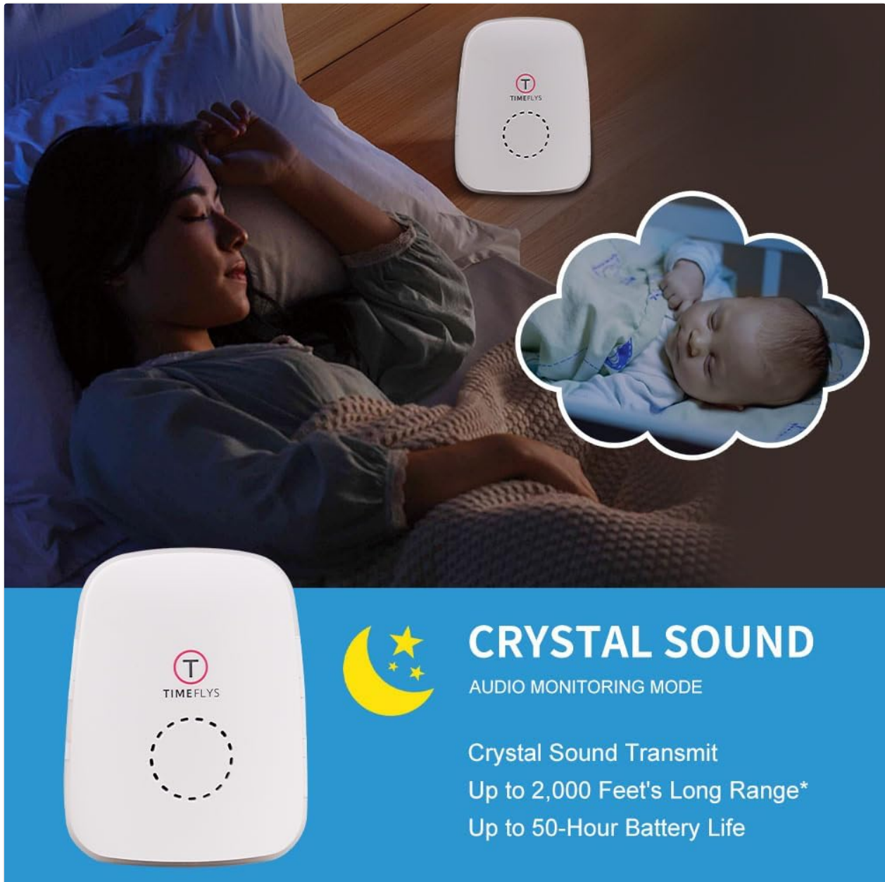
Image: The TimeFlys Parent Unit with text highlighting "Crystal Sound" and "Up to 2,000 Feet's Long Range" and "Up to 50-Hour Battery Life", next to an image of a sleeping parent and baby.

The Parent Unit provides traditional audio monitoring with an impressive range of up to 2000 feet in open areas. This allows you to hear your little one even when you are in a different part of the house or outdoors, such as in the garden or by the pool.