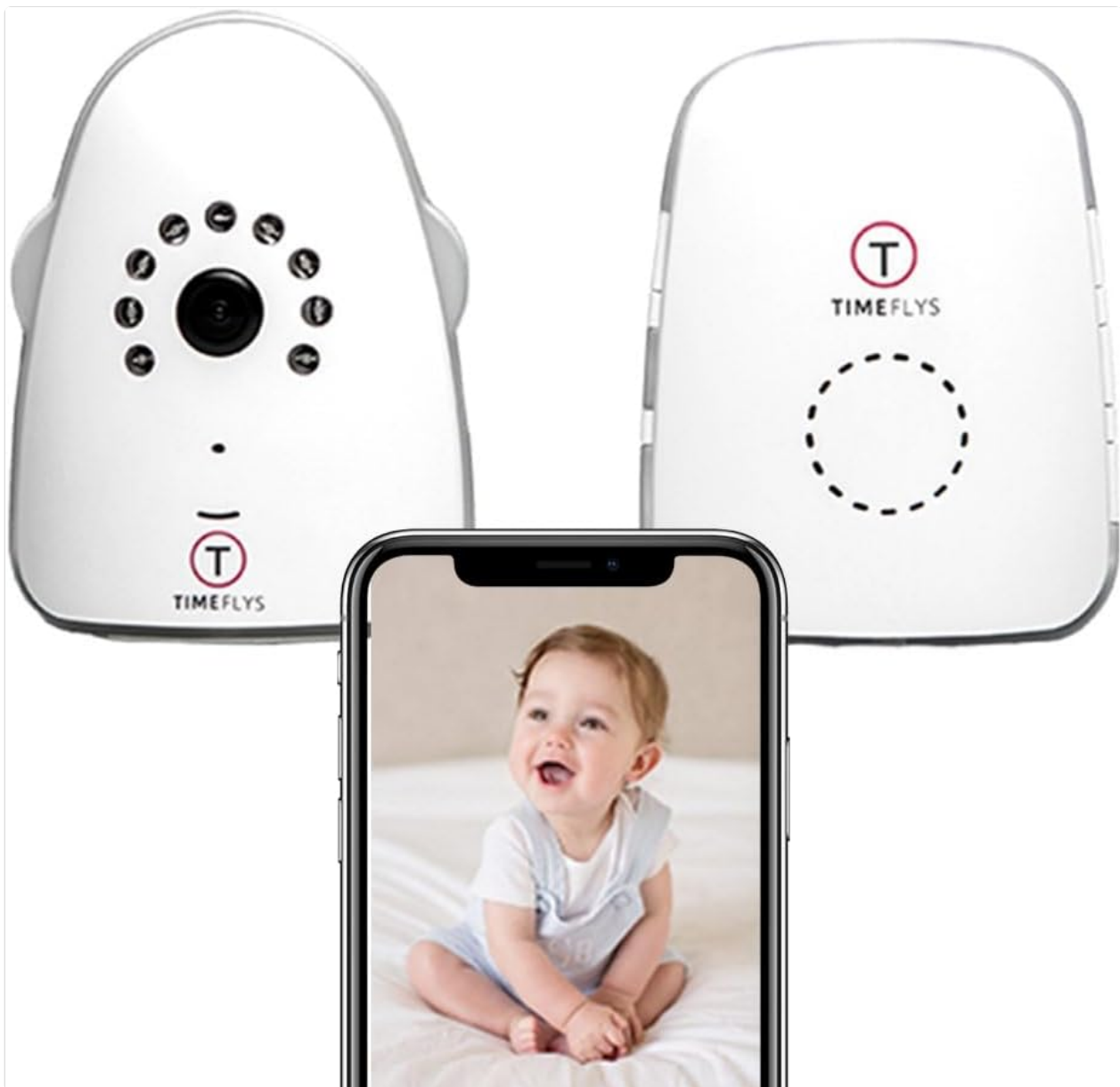
Image: TimeFlys Baby Unit and Parent Unit with a smartphone showing a baby.

Press and hold the power button on the Parent Unit for 3 seconds to turn it on. The Baby Unit will power on automatically when connected to power.