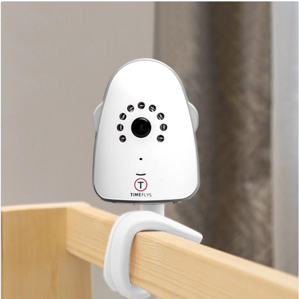
Image: The TimeFlys Baby Monitor securely mounted on the side of a wooden crib, demonstrating its adjustable positioning.