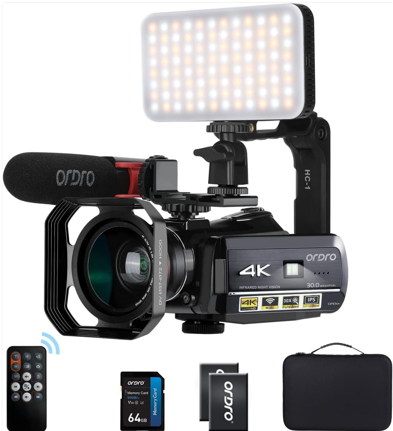
Figure 3.1: Camcorder with Attached Accessories