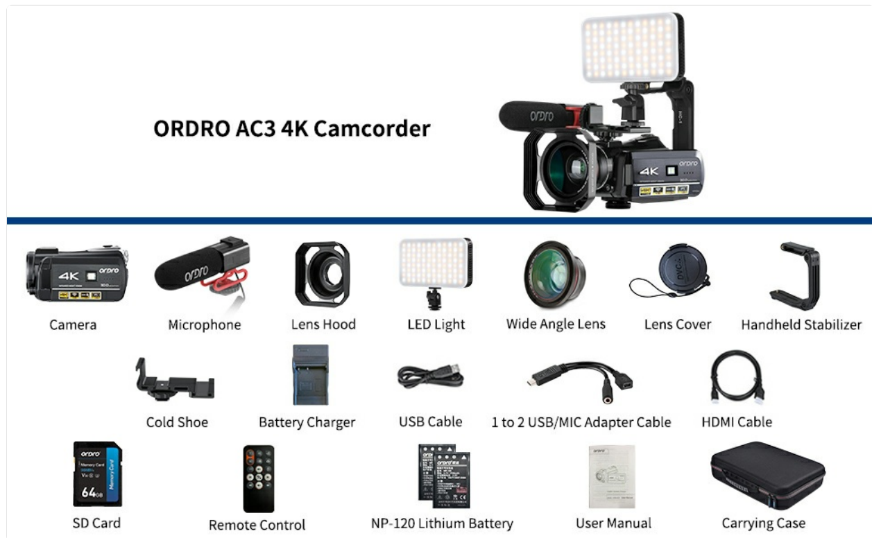
Figure 7.1: ORDRO 4K Camcorder AC3 Specification Table

Detailed technical specifications for the ORDRO AC3 LED 550 Camcorder: