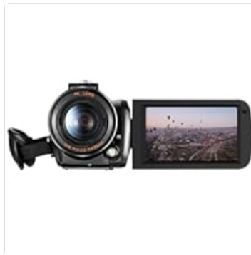
Figure 4.2: Night Vision Example

Activate the IR Night Vision mode for recording in low-light or dark conditions. The camcorder can capture clear images up to 3.5 meters in the dark.