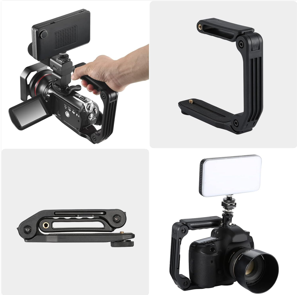
Figure 3.5: Handheld Stabilizer Usage