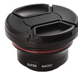
Wide Angle Lens