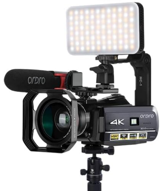
Figure 4.3: Time-Lapse Video Demonstration

It can shoot a scene with a chosen interval 1sec, 3sec or 5sec between each shot and edit the sequence into a high-quality 4K time-Lapse video