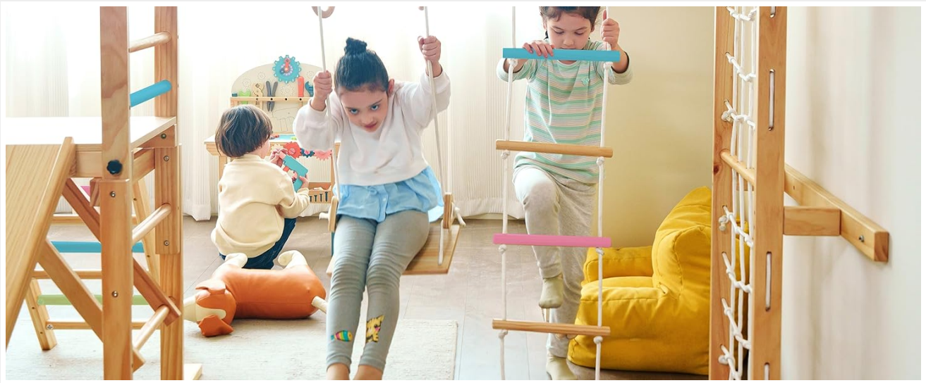
Figure 6.1: The jungle gym can be folded against the wall for compact storage.