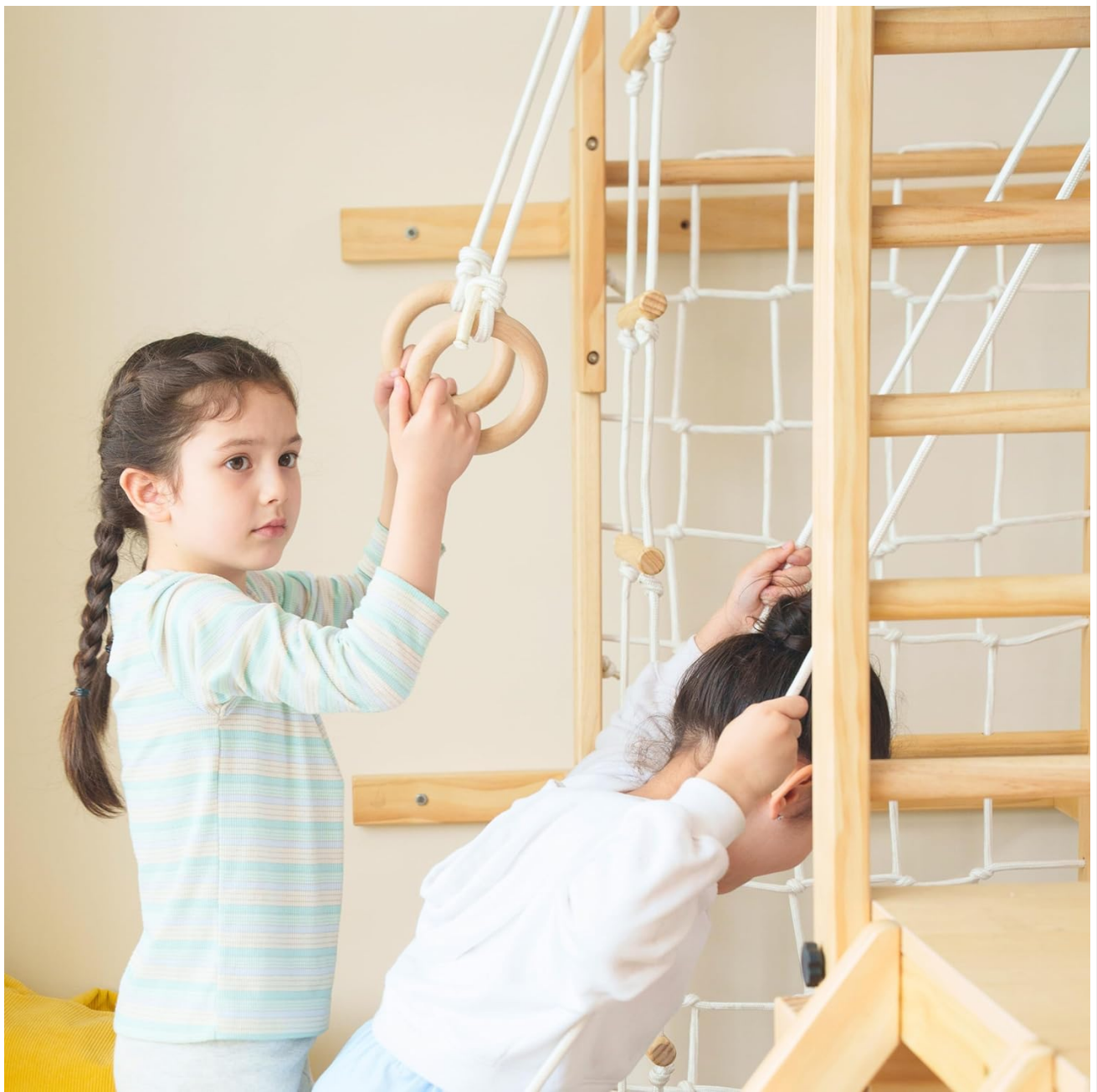
Figure 4.2: A child ascending the wooden ladder, demonstrating proper climbing technique.