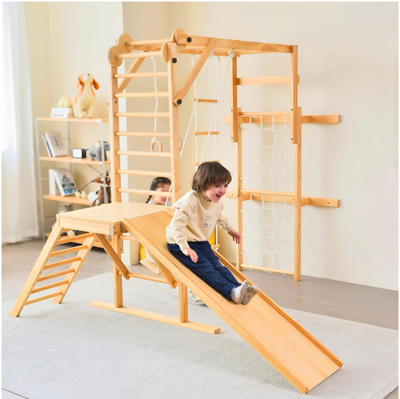
Figure 4.3: A child enjoying the slide feature of the jungle gym.