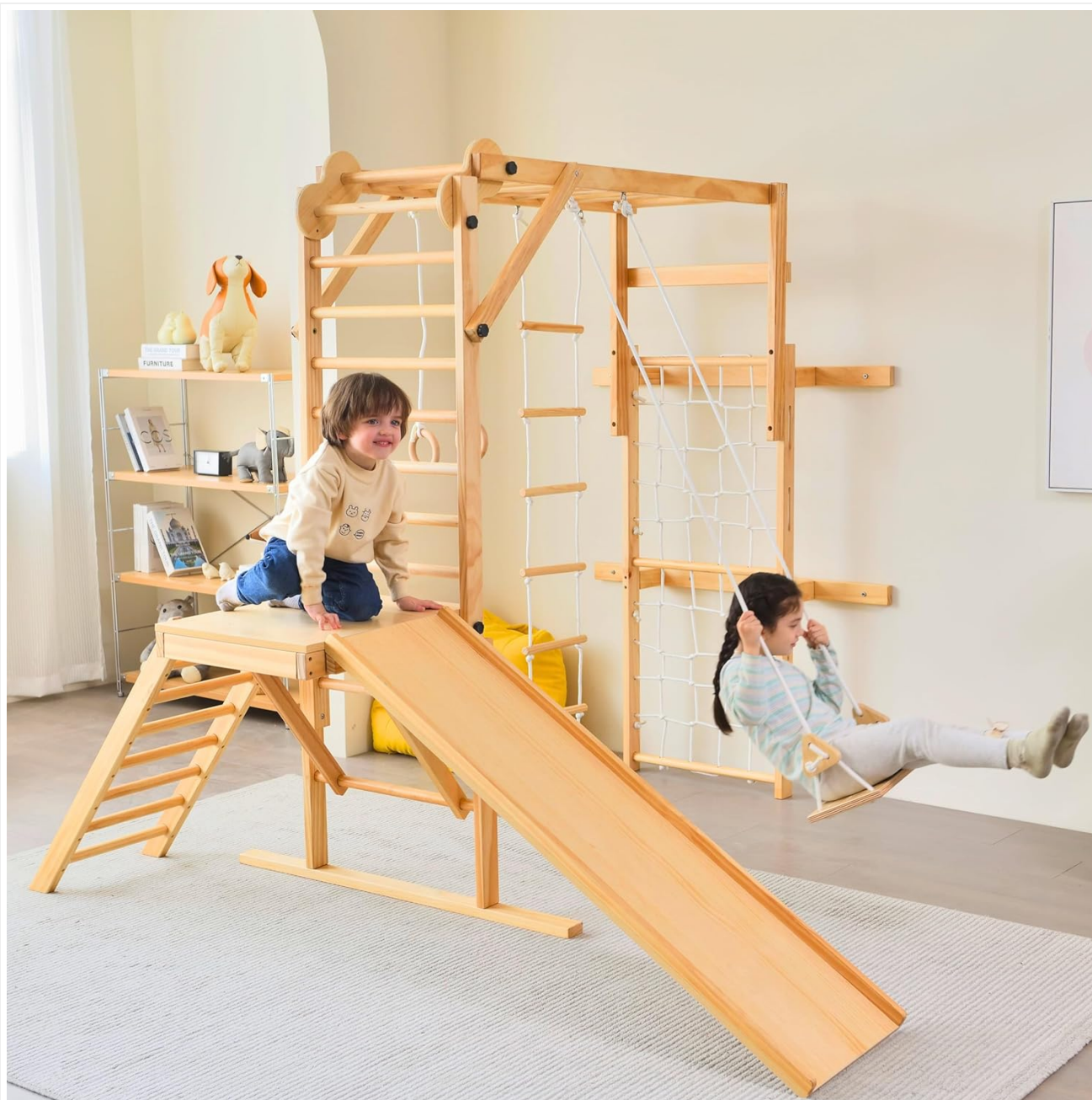
Figure 2.1: The Avenlur Grove 8-in-1 Indoor Jungle Gym, showcasing its various play elements.