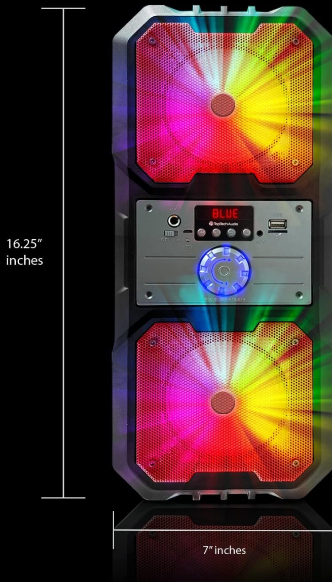
Figure 4.4: Dimensions of the Top Tech Audio Spike-4 speaker, showing a height of 16.25 inches and a width of 7 inches, emphasizing its compact yet powerful design.