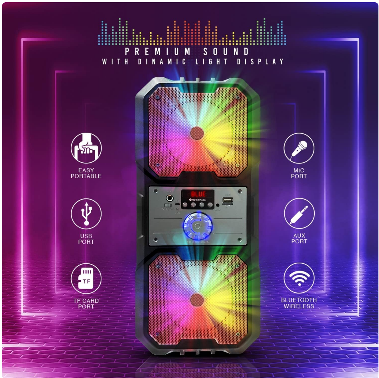
Figure 4.2: Overview of the speaker's connectivity options and features, including Easy Portable design, USB Port, TF Card Port, Mic Port, AUX Port, and Bluetooth Wireless capability. These features are indicated by clear icons around the speaker.