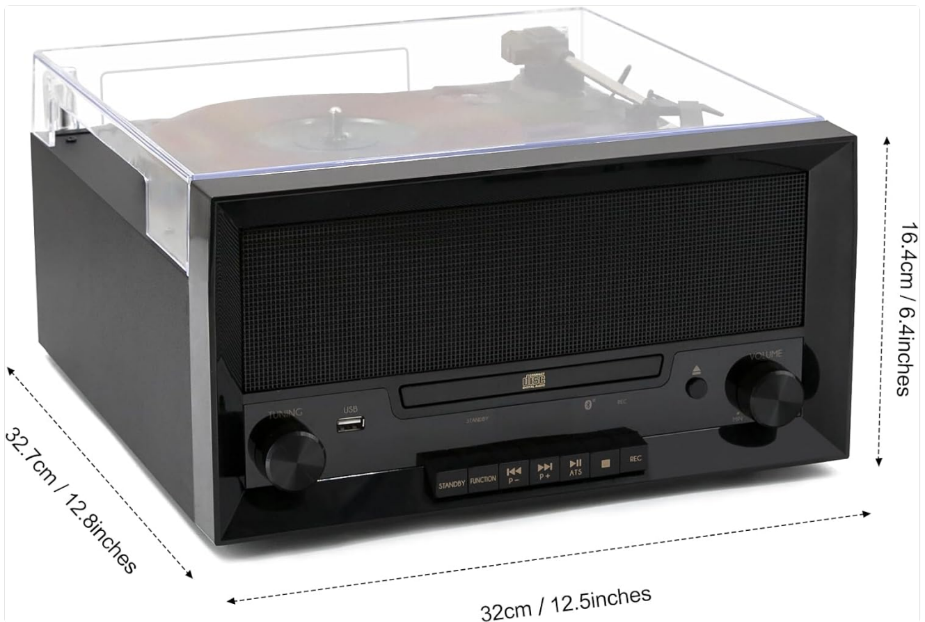
Figure 9.1: Product Dimensions

This image provides a visual representation of the record player's physical dimensions, indicating its compact size suitable for various home environments.