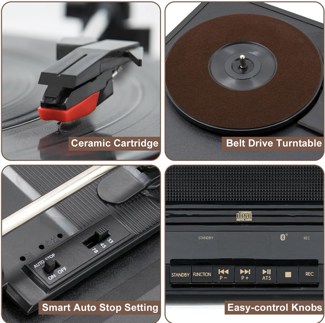
Figure 4.2: Key Internal and Control Features

This diagram illustrates the location of key controls and ports. On the front, you'll find the Tuning knob, USB port, Standby button, Function button, PREV/NEXT buttons, CD tray, OPEN/CLOSE button, Volume control knob, PLAY/PAUSE button, STOP button, and REC button. The rear panel includes the Antenna, Headphone port, AUX IN socket, RCA output jacks for external speakers, Power ON/OFF switch, and DC IN jack.