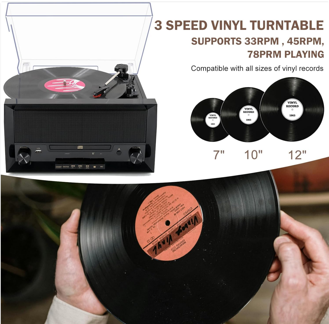
Figure 6.1: 3-Speed Vinyl Turntable Compatibility

The turntable supports 33 1/3, 45, and 78 RPM speeds, compatible with all standard vinyl record sizes.