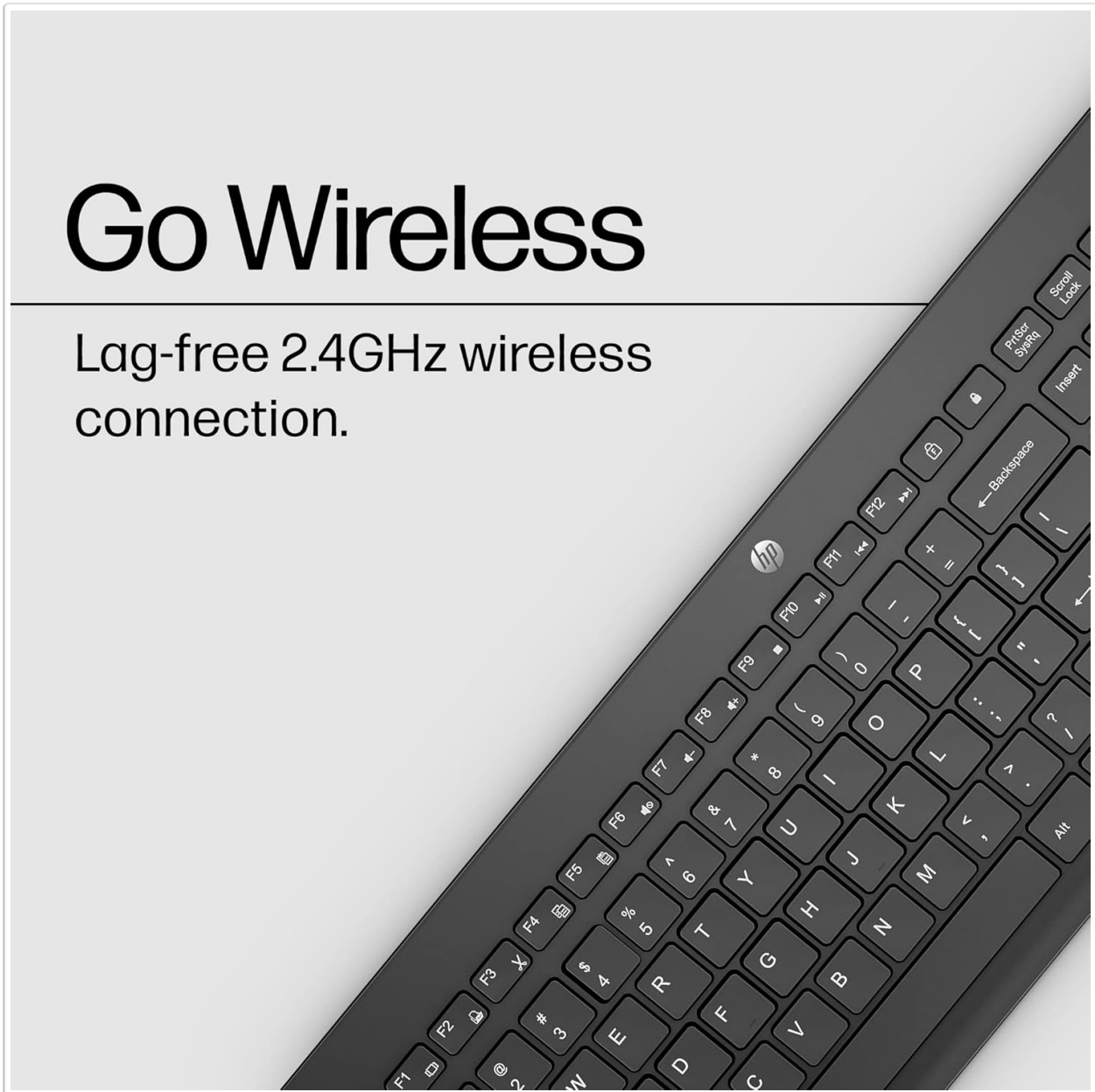
Image: The HP 230 Wireless Keyboard emphasizing its lag-free 2.4GHz wireless connection, promoting a wire-free setup.