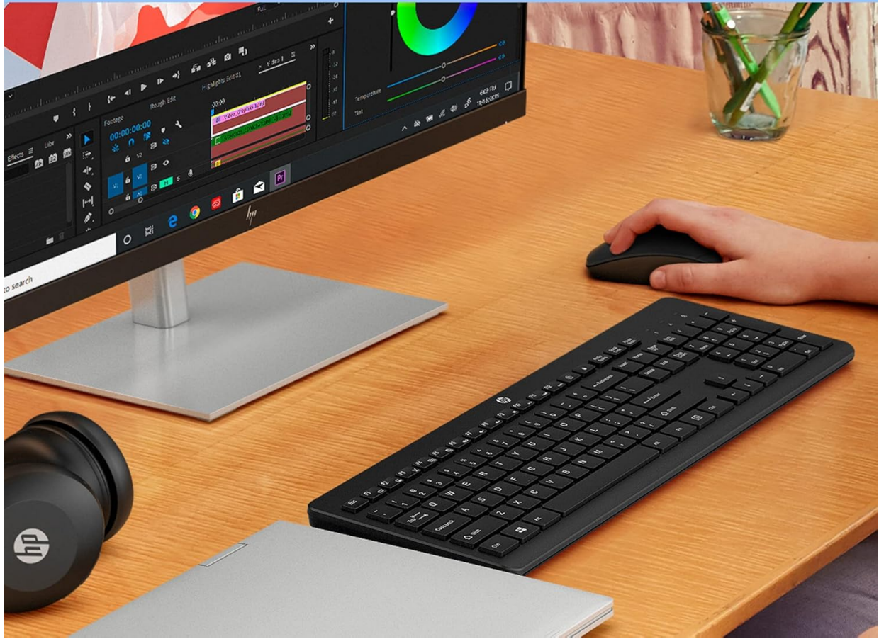
Image: A user interacting with the HP 230 Wireless Keyboard, demonstrating the ease of activating function keys for increased productivity.

Activate 12 function keys with just one click.