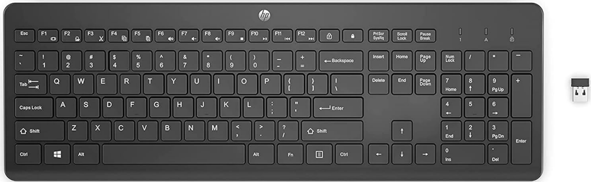
Image: The HP 230 Wireless Keyboard shown with its compact USB receiver, ready for connection.