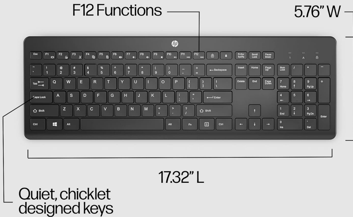
Image: Detailed view of the HP 230 Wireless Keyboard, illustrating its dimensions, weight, and key design features.