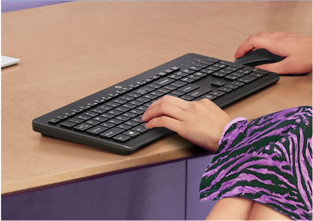
Image: A person's hands are shown typing on the HP 230 Wireless Keyboard, illustrating its quiet operation due to the chiclet key design.