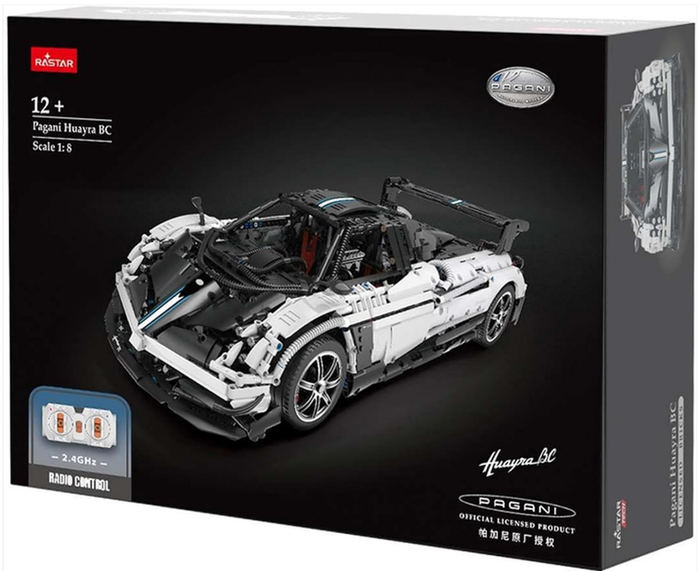
Image: The retail packaging for the rastar 97900 kit, showing the assembled model and brand information.