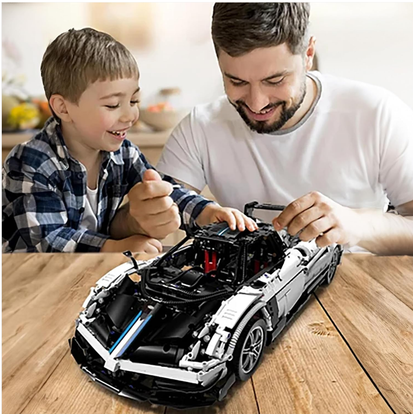
Image: An adult and child engaged in the assembly process of the rastar 97900 building block model.