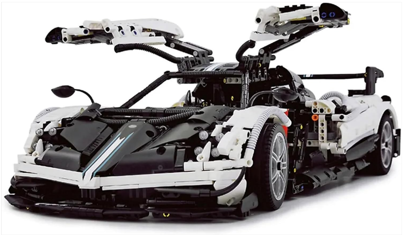
Image: A side view of the rastar 97900 model with its butterfly doors open, demonstrating a key feature.