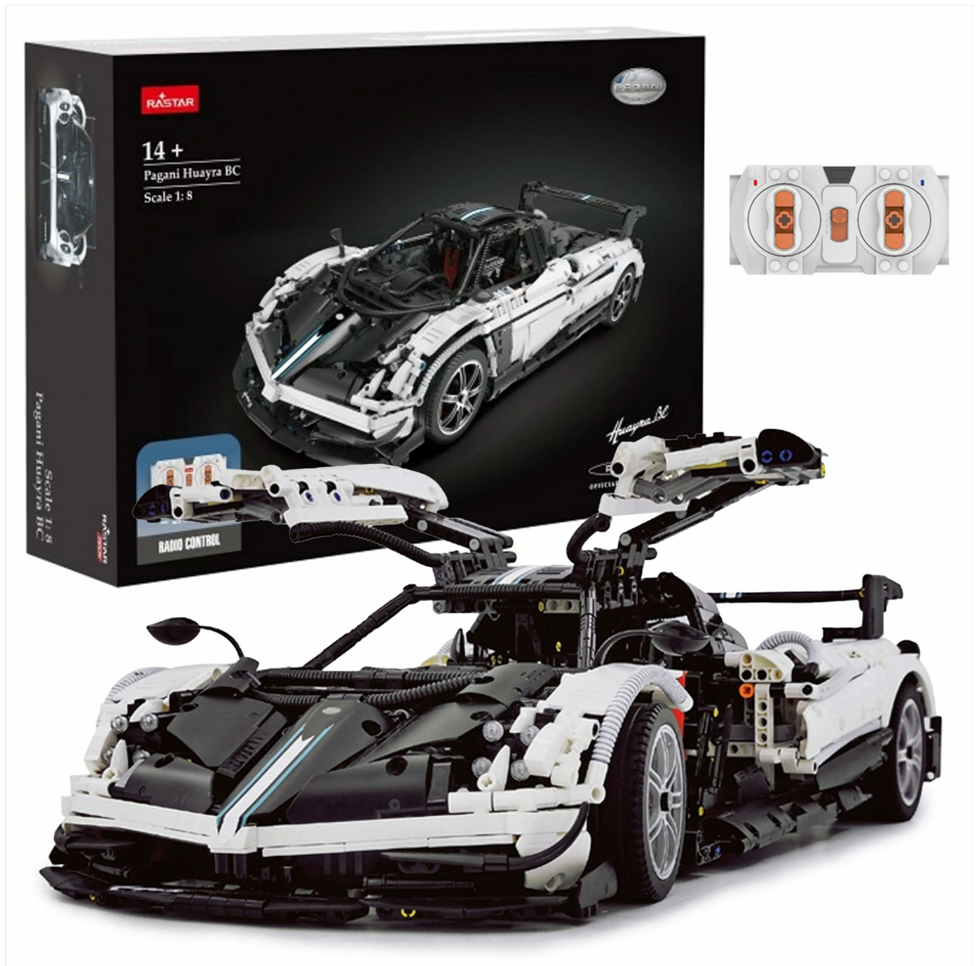
Image: The fully assembled rastar 97900 Pagani Huayra BC 1:8 Roadster RC Car model, showcasing its detailed design.