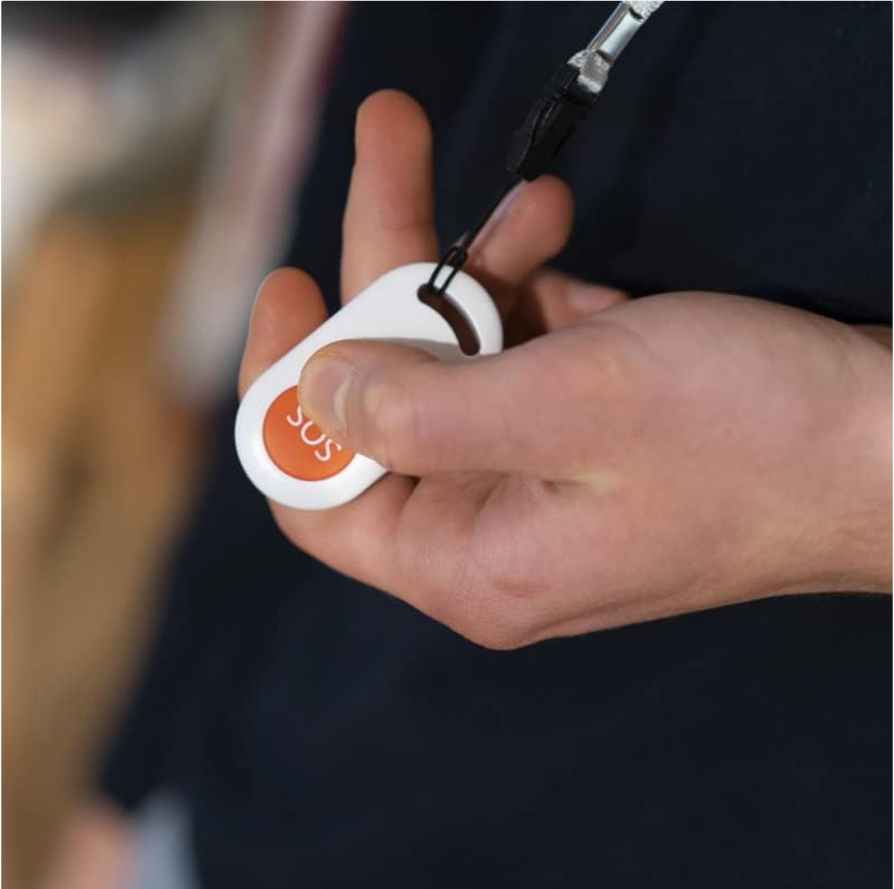
Figure 6.1: A hand pressing the orange "SOS" button on the APLOS alert transmitter, initiating an alert.

To send an alert, simply press the orange "SOS" button on the alert transmitter.