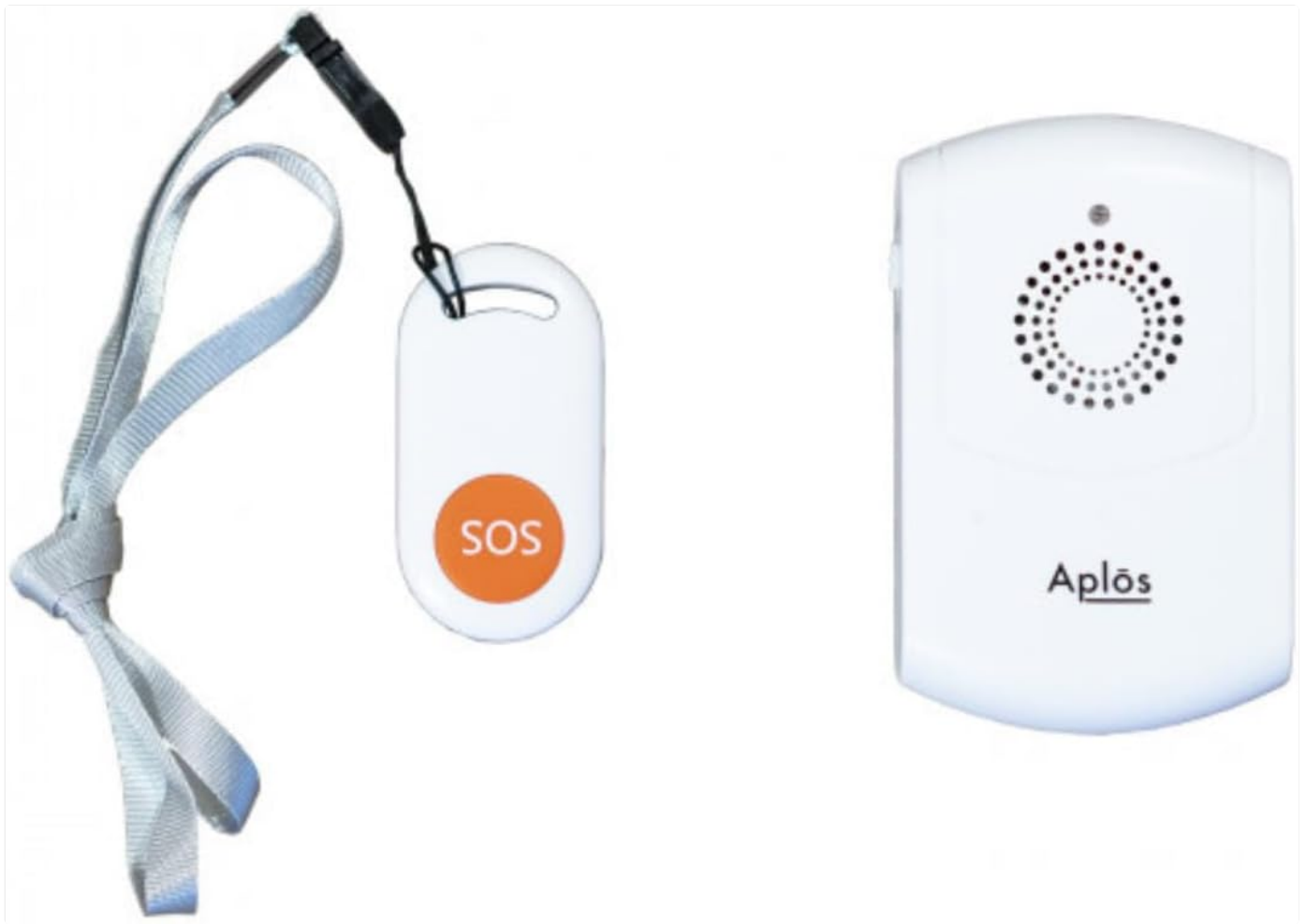
Figure 4.1: APLOS Personal Alert Pager (right) and Button (left) with lanyard. The pager is a white rectangular device with a speaker grille and the "Aplōs" logo. The button is a smaller white oval device with an orange "SOS" button and a loop for the lanyard.