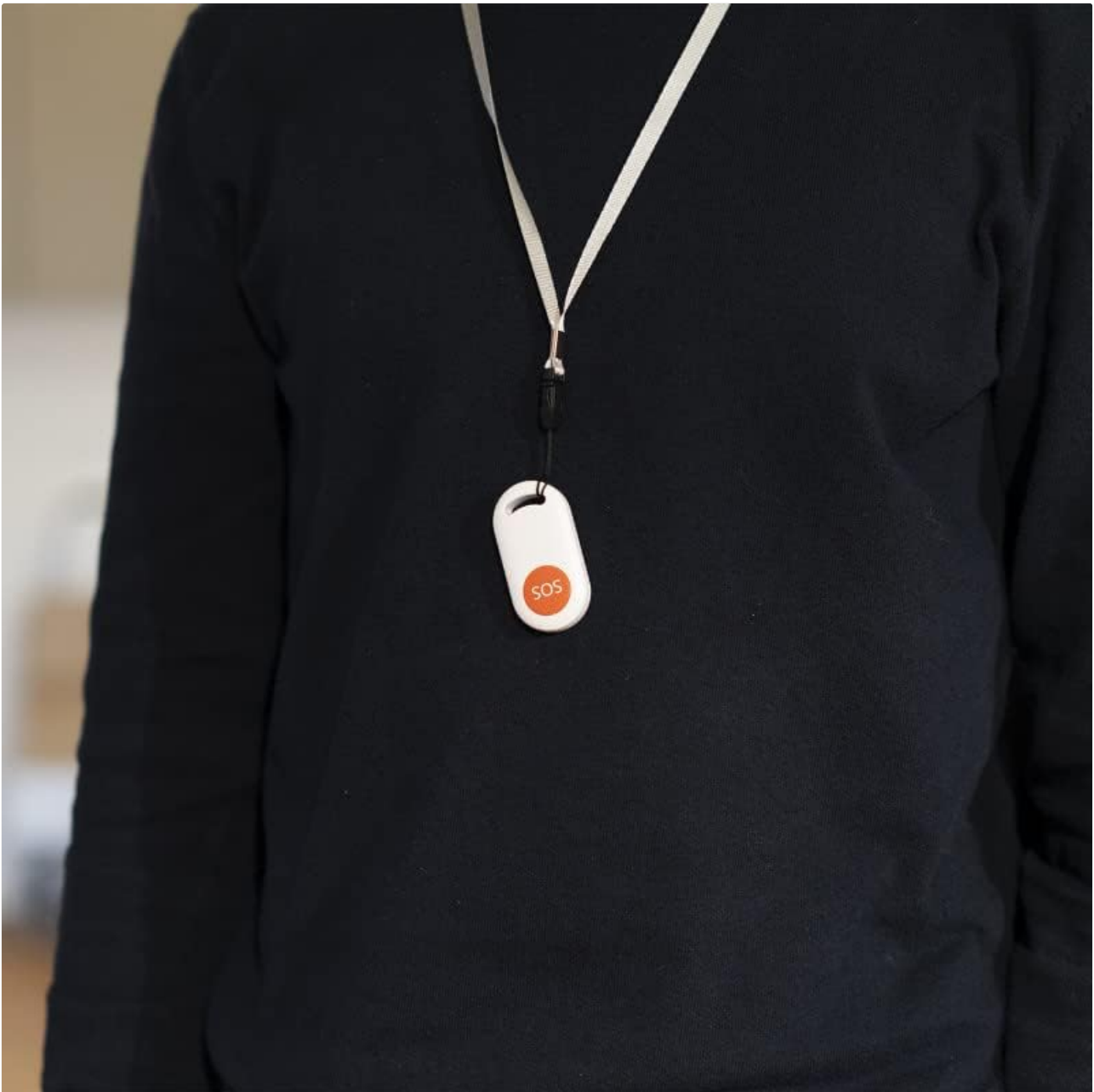
Figure 5.1: A person wearing the APLOS alert button around their neck using the provided lanyard, demonstrating convenient access.