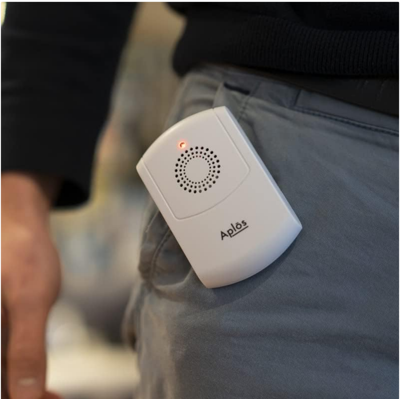
Figure 5.2: The APLOS pager securely clipped to a person's belt, showing its portability and ease of access for the caregiver.