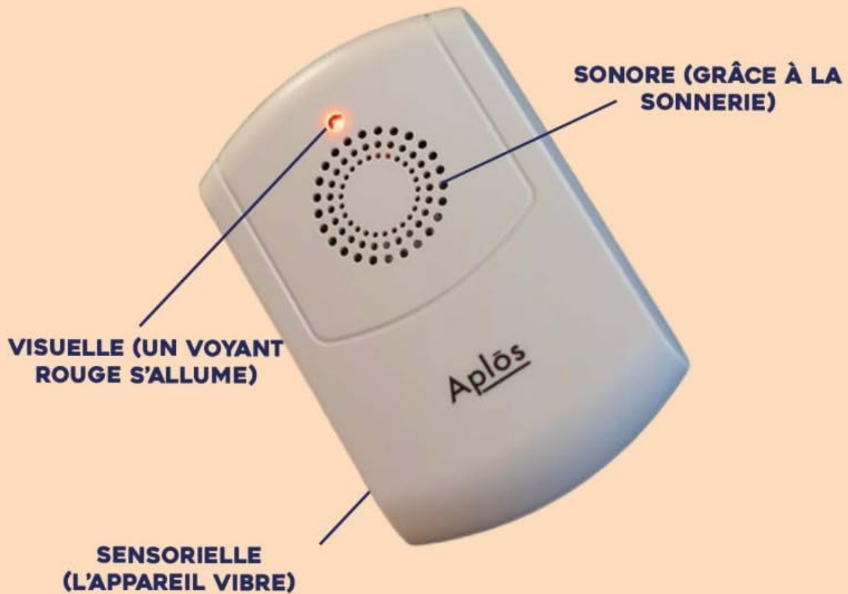
Figure 4.3: The APLOS Personal Alert Pager illustrating its three alert functions: Audible (via the ringer), Visual (a red indicator light illuminates), and Sensory (the device vibrates).