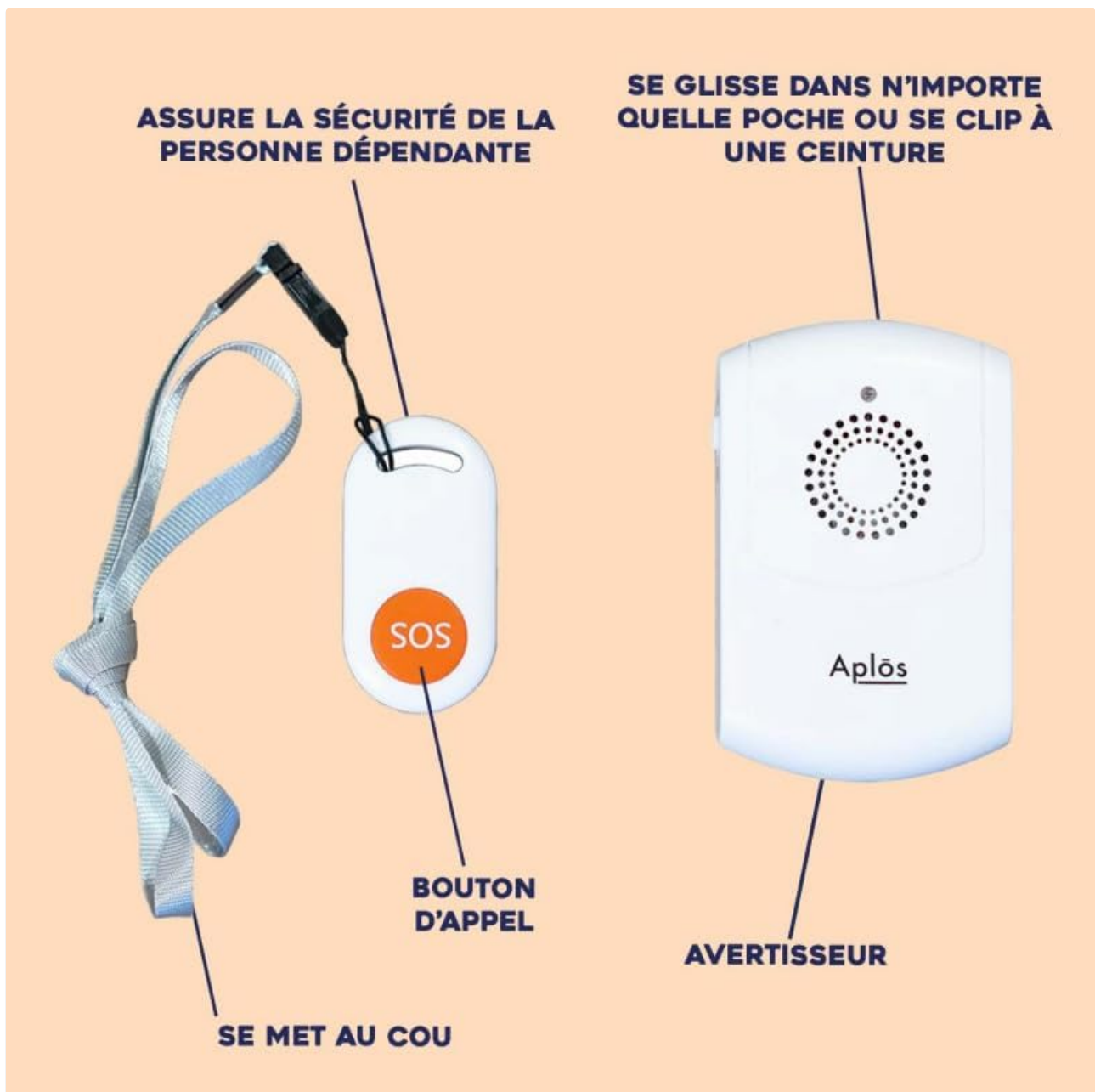
Figure 4.2: Labeled diagram showing the APLOS Personal Alert Pager (Avertisseur) and Button (Bouton d'appel). The button can be worn around the neck (Se met au cou) and the pager can be carried in a pocket or clipped to a belt (Se glisse dans n'importe quelle poche ou se clip à une ceinture). The system ensures the safety of dependent persons (Assure la sécurité de la personne dépendante).