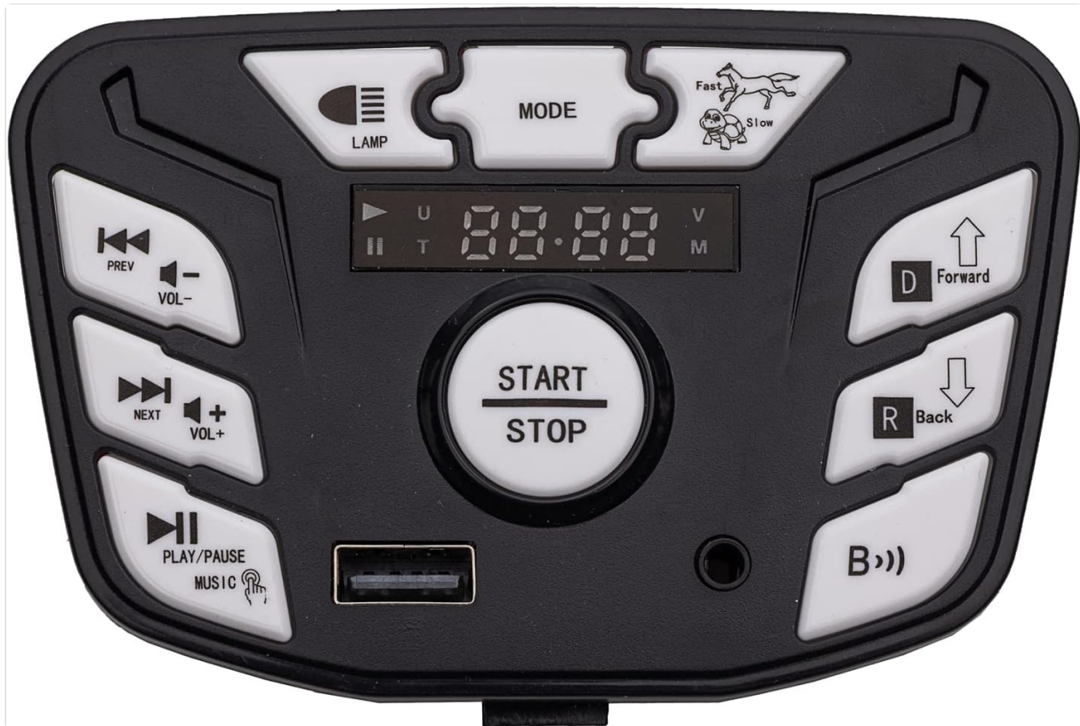
Figure 1: Front view of the weelye JR1927M-Z control panel. This image shows the various buttons including START/STOP, LAMP, MODE, Fast/Slow speed, PREV/VOL-, NEXT/VOL+, PLAY/PAUSE/MUSIC, D (Forward), R (Back), and a Bluetooth icon. A digital display is visible in the center.