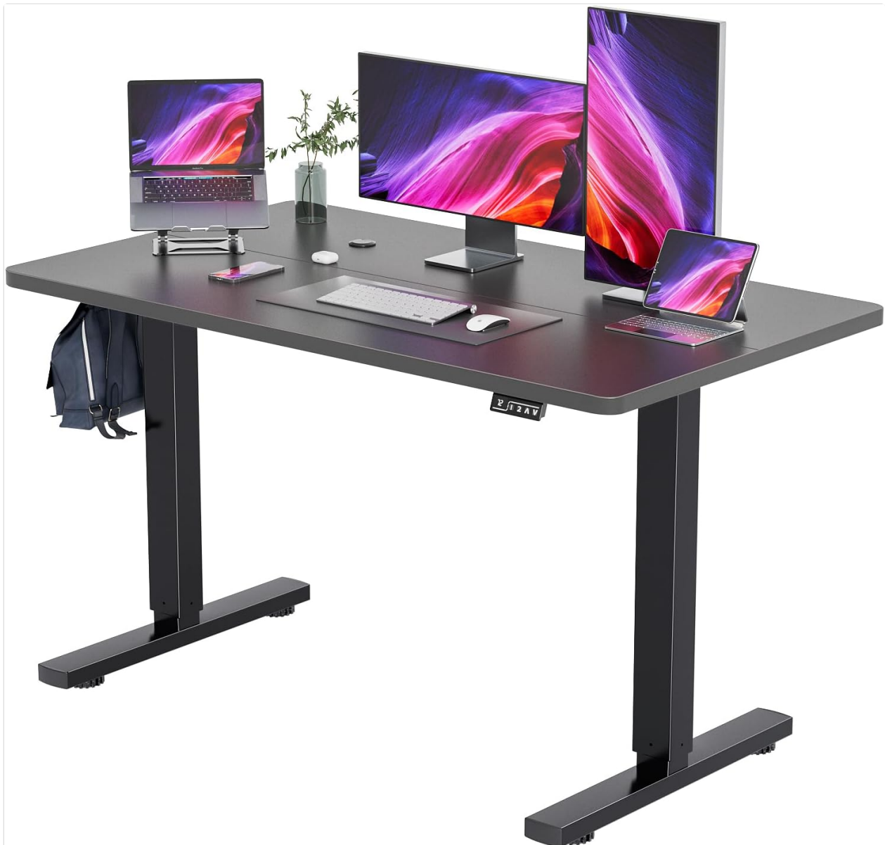
Figure 4.1: The fully assembled YESHOMY Electric Height Adjustable Standing Desk.