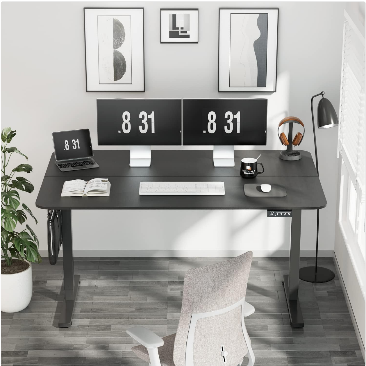
Figure 5.1: The control panel for height adjustment and memory presets.

Video 5.1: Demonstration of the YESHOMY Height Adjustable Electric Standing Desk in operation, showcasing its smooth height transitions.