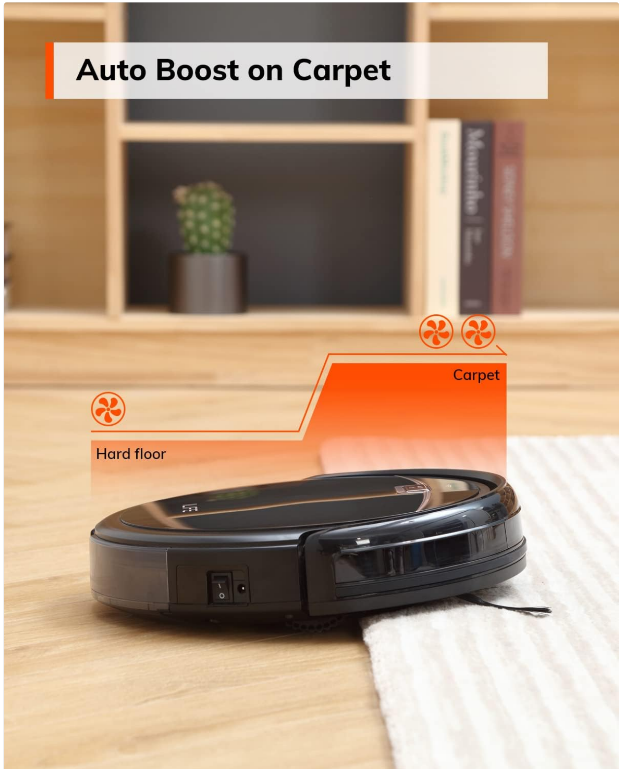
Image: A graphic illustrating the robot vacuum's 'Auto Boost' feature, showing increased suction when moving from a hard floor to a carpeted area.

When the A4s Max detects a carpeted surface, it will automatically increase its suction power to effectively loosen and lift embedded debris. This feature ensures thorough cleaning across different floor types without manual intervention.