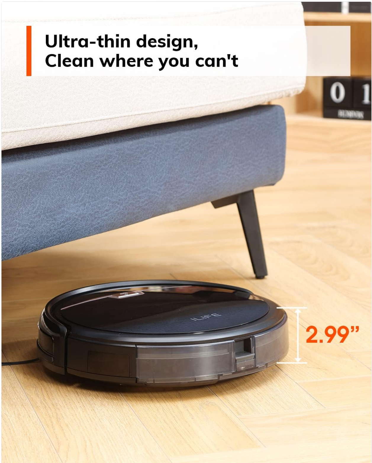
Image: The robot vacuum positioned under a sofa, demonstrating its ultra-thin design (2.99 inches) for cleaning hard-to-reach areas.

Ultra-thin design, Clean where you can't