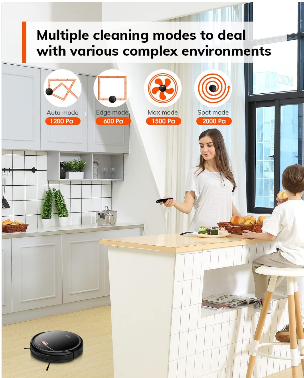
Image: Visual representation of the robot's cleaning patterns for Auto, Edge, Max, and Spot modes, indicating their respective suction powers.