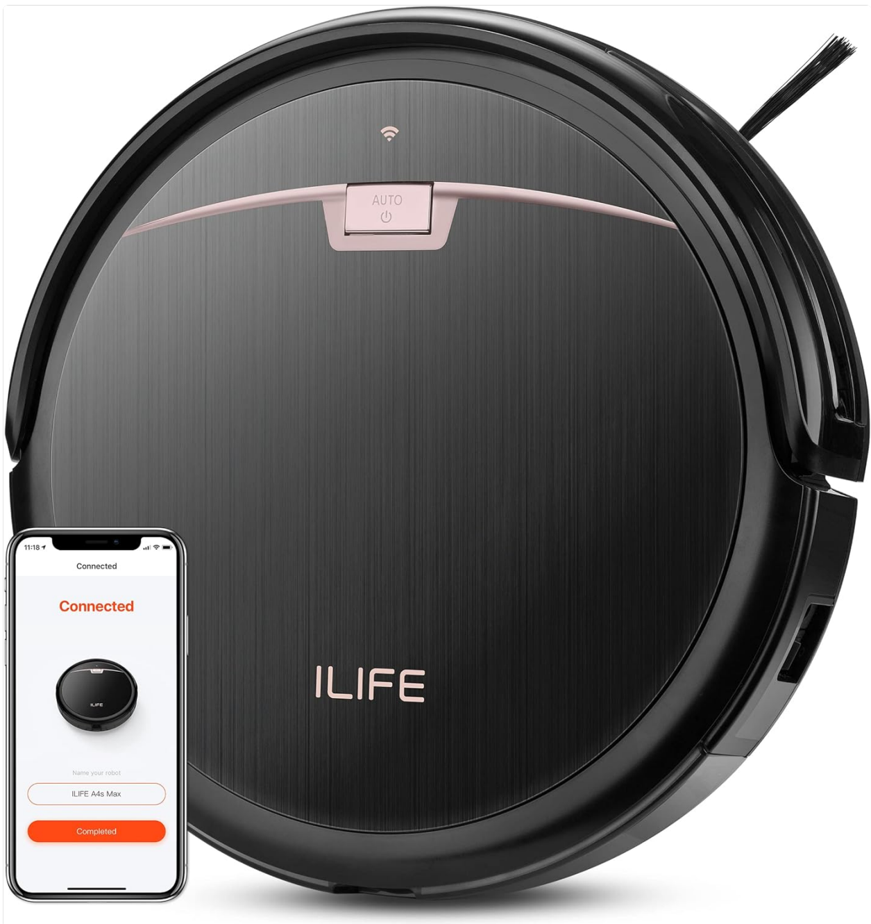
Image: The ILIFE A4s Max robot vacuum cleaner, shown alongside a smartphone displaying its connected app interface.