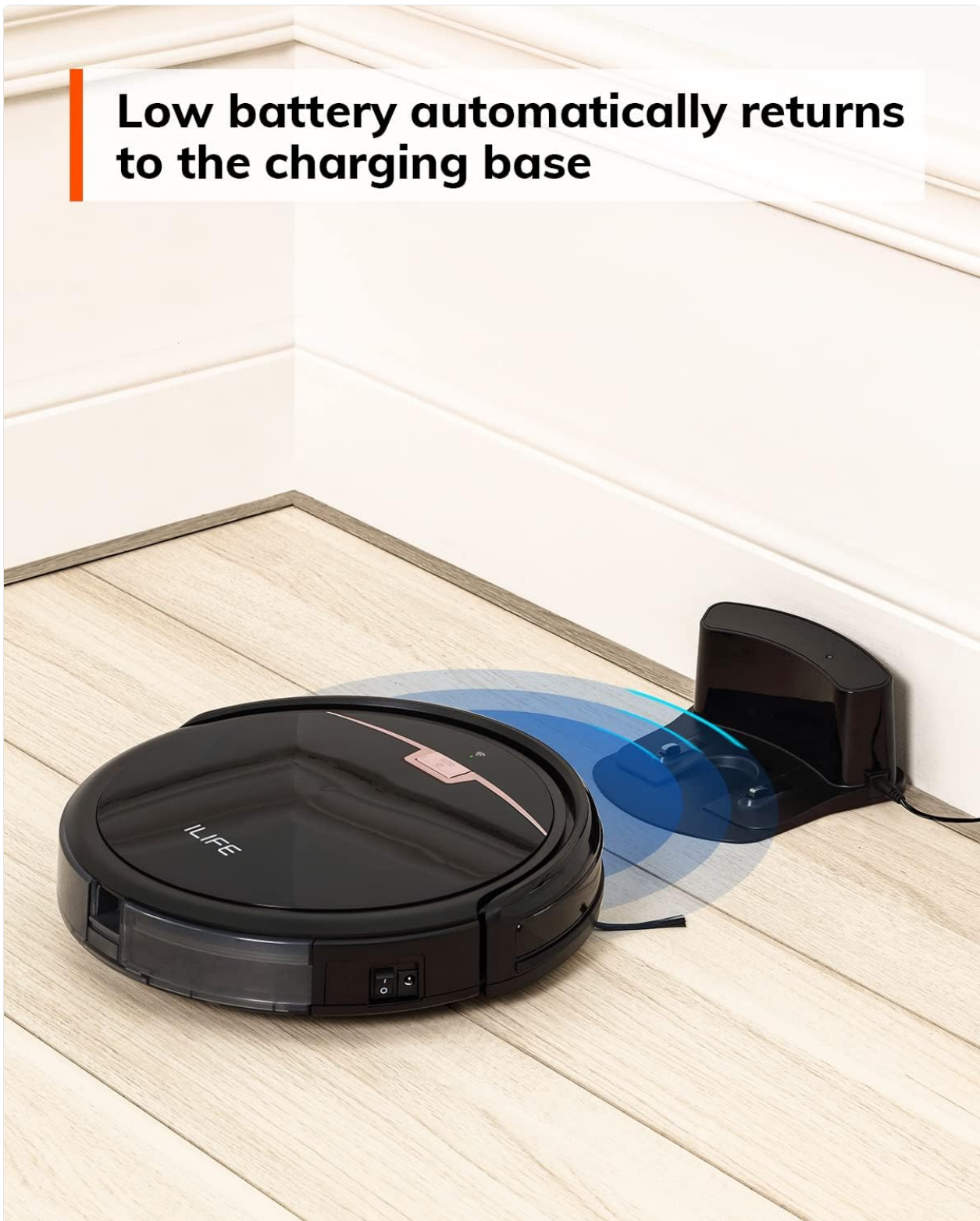
Image: The robot vacuum approaching and connecting to its charging base, illustrating its automatic self-charging function.