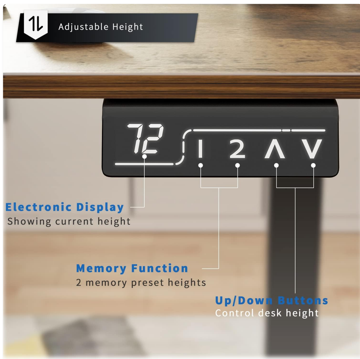
Figure 3: Electronic Control Panel with Digital Display and Memory Functions.