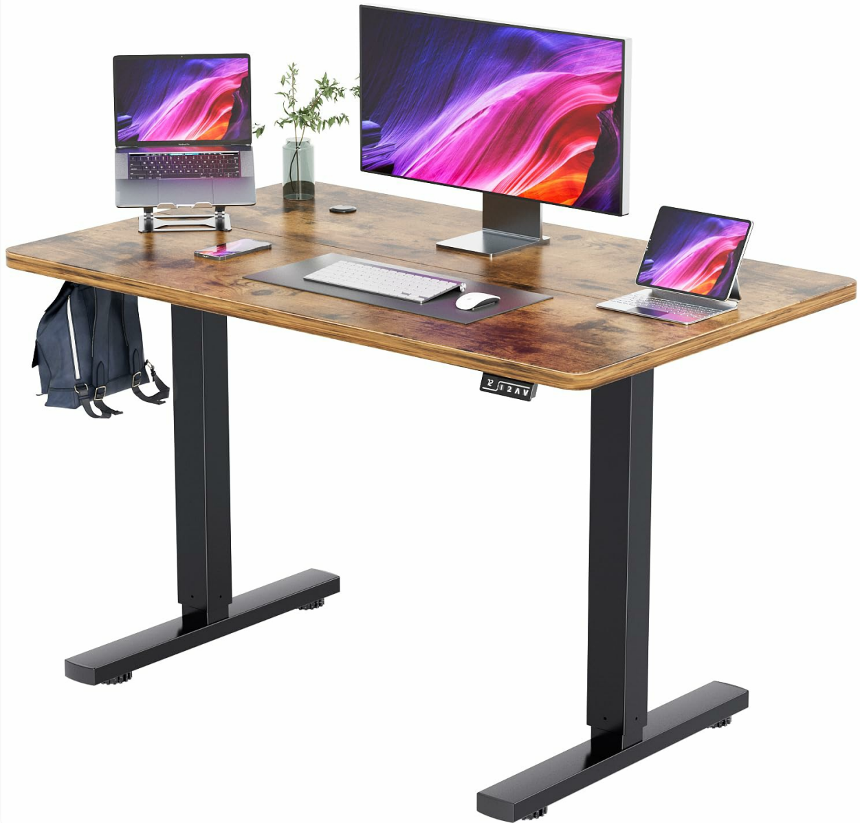
Figure 1: YESHOMY 40-inch Electric Height Adjustable Standing Desk.