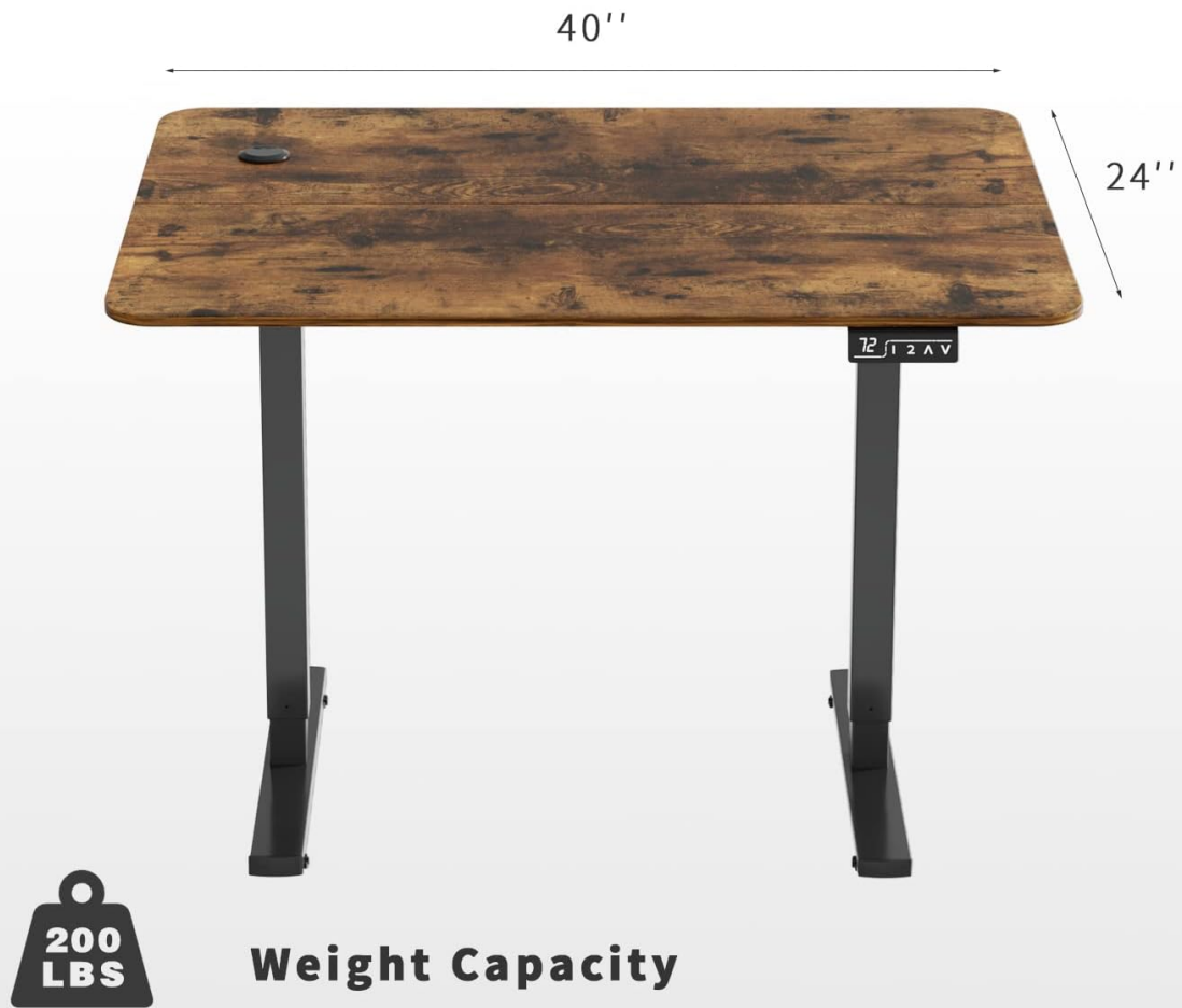
Figure 5: Product Dimensions and Weight Capacity.