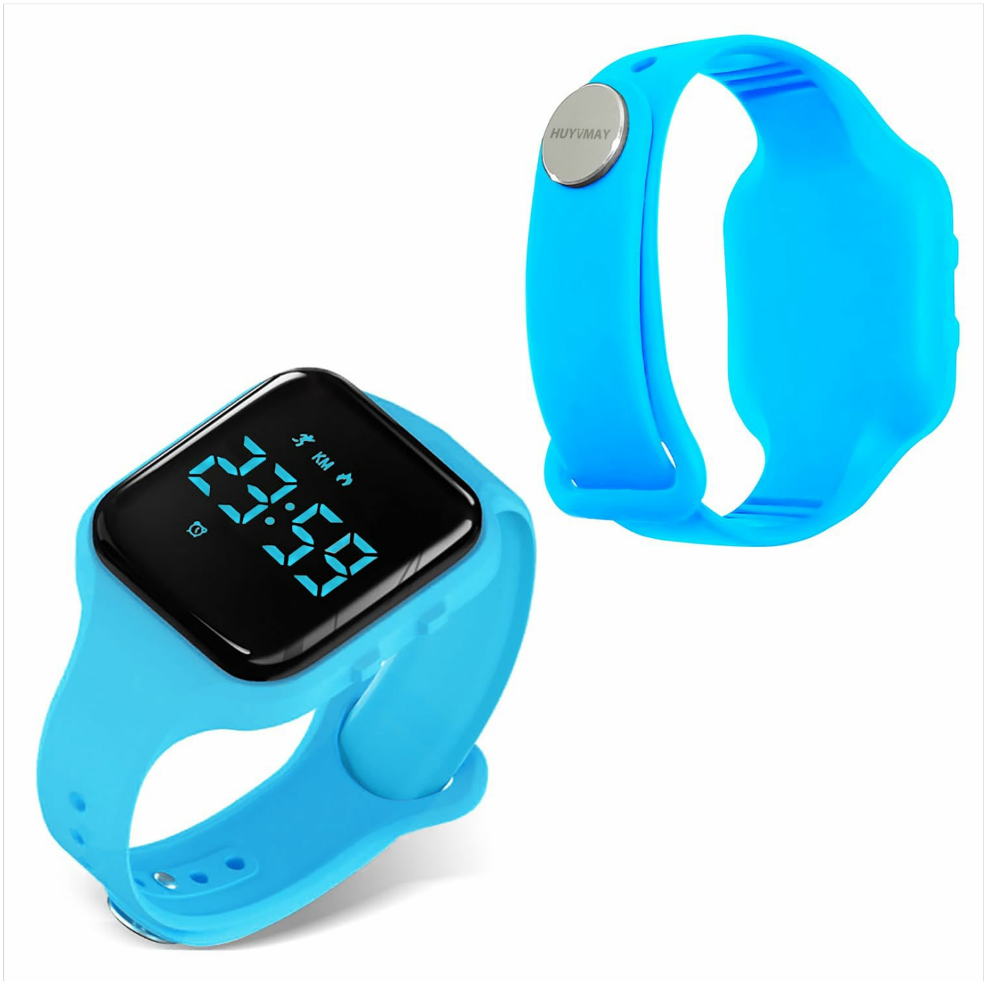
Image: The HUYVMAY T6S Fitness Tracker worn on a wrist, displaying the time and various activity icons.