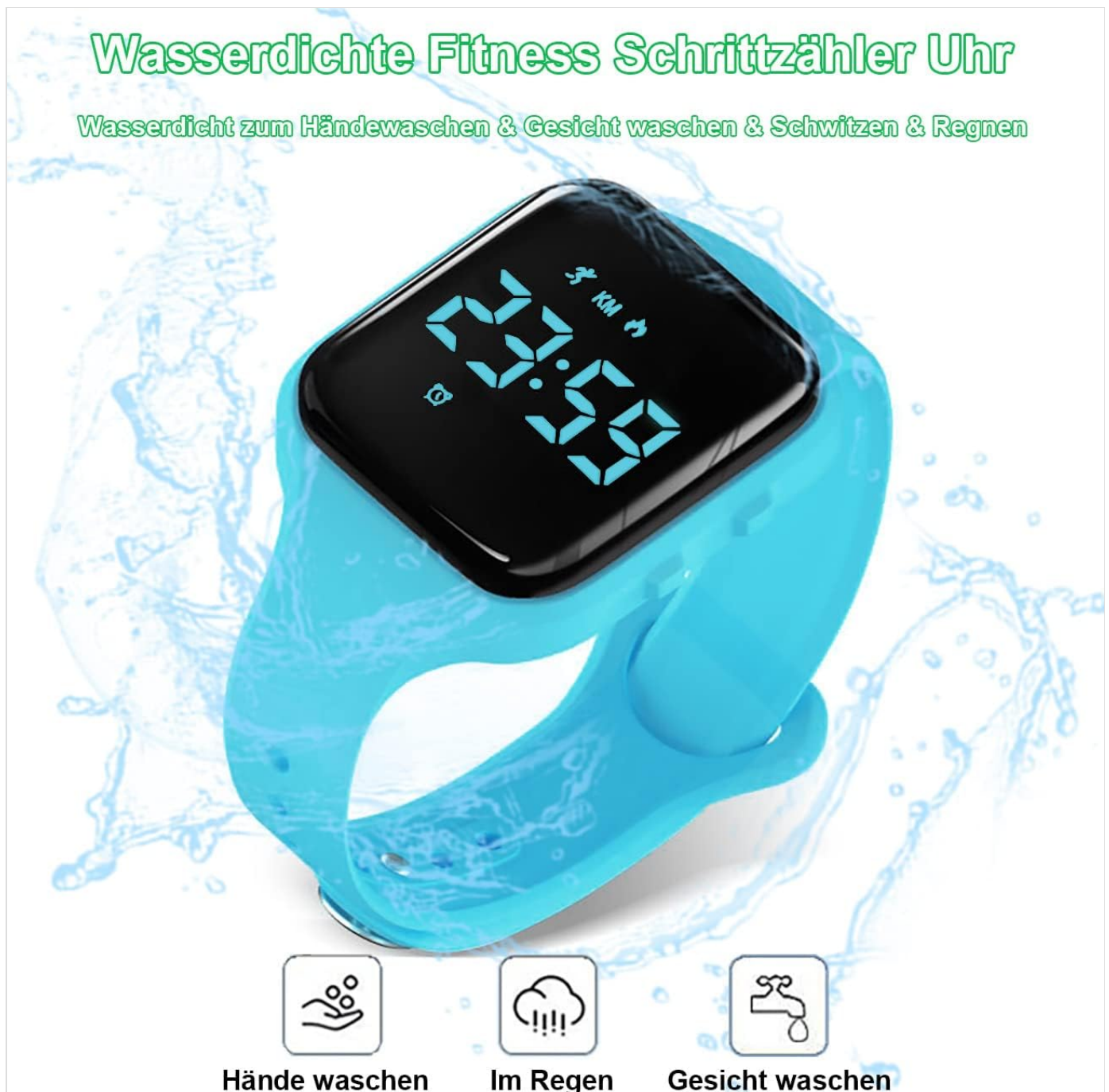
Image: The HUYVMAY T6S Fitness Tracker with icons indicating its water resistance for hand washing, rain, and face washing.

The HUYVMAY T6S Fitness Tracker is IP68 waterproof, meaning it is resistant to splashes, rain, hand washing, and face washing. It is not suitable for showering, swimming, or diving. If water accidentally enters the watch, allow it to dry naturally before continued use.