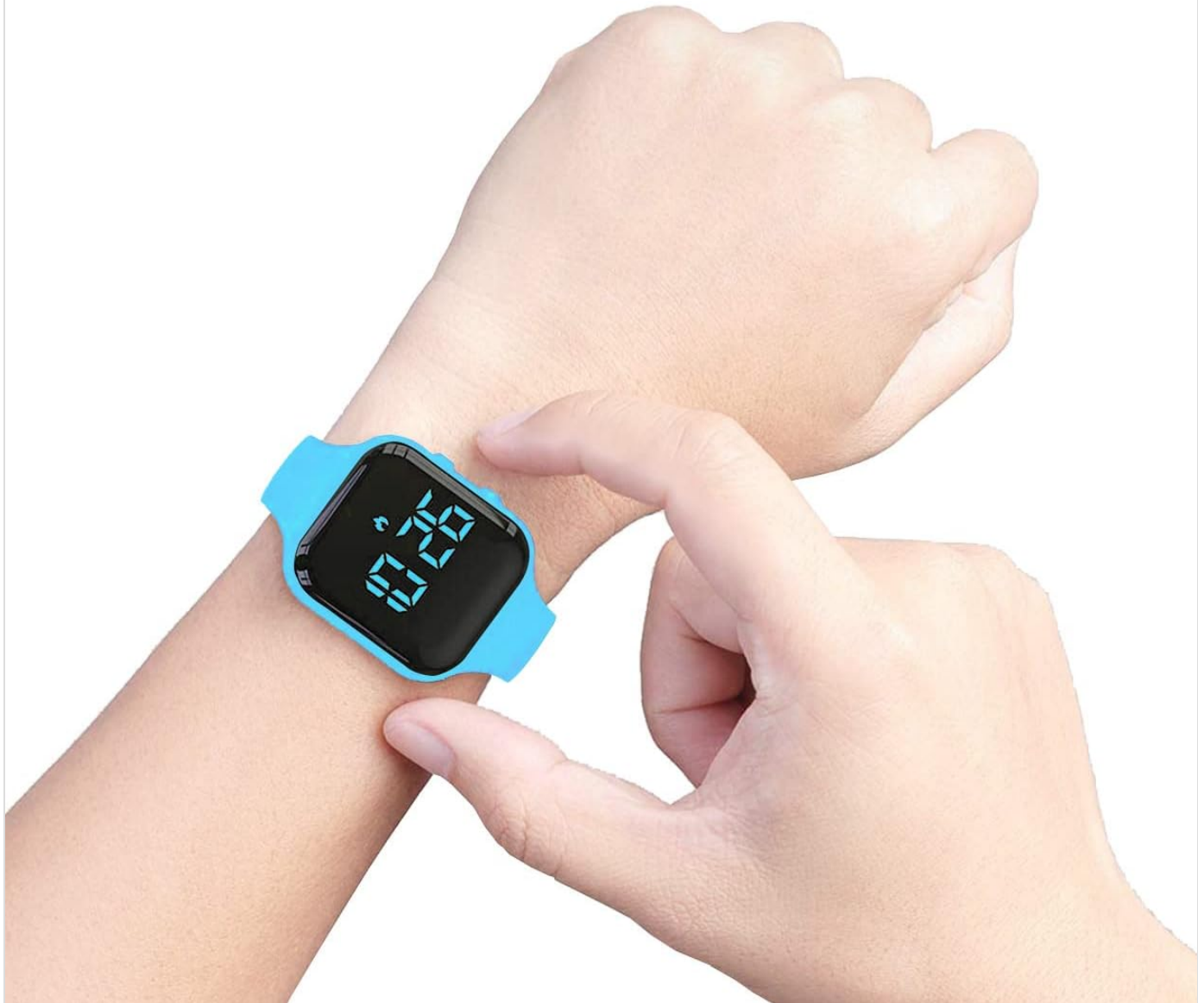
Image: The HUYVMAY T6S Fitness Tracker on a wrist, showing the step counting function with a foot icon and numerical display.