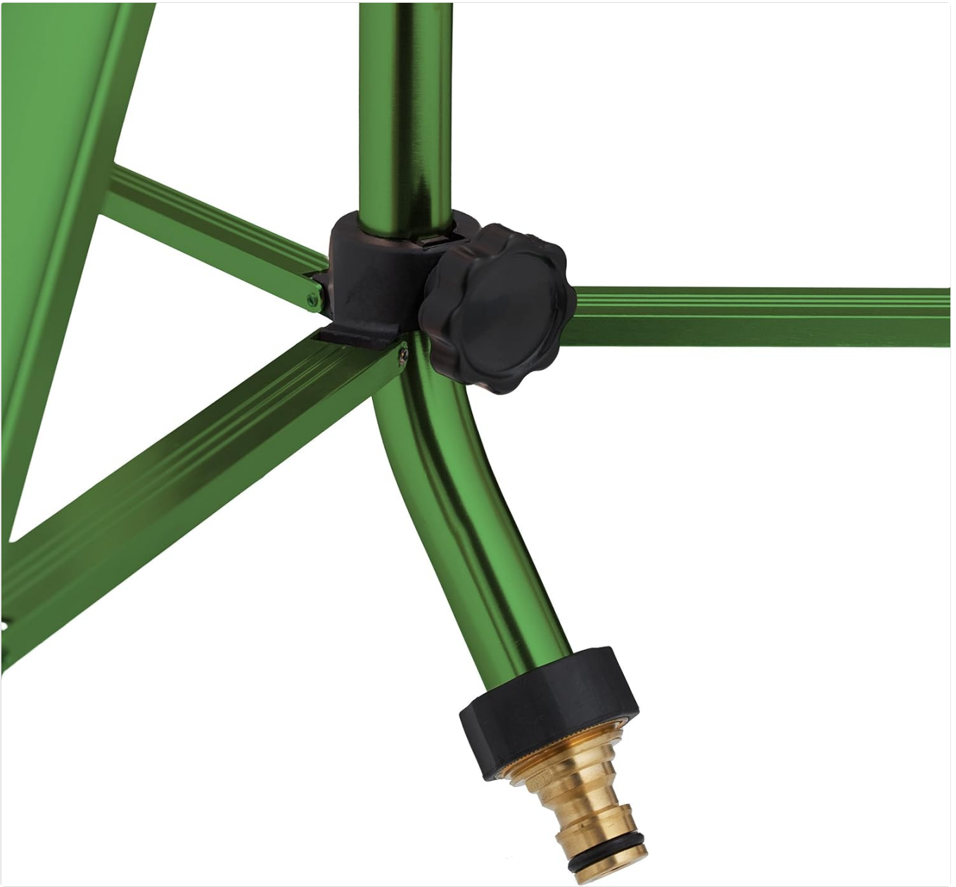
Image: A detailed view of the brass 3/4-inch hose connector at the bottom of the sprinkler's central pole, ready for hose attachment.