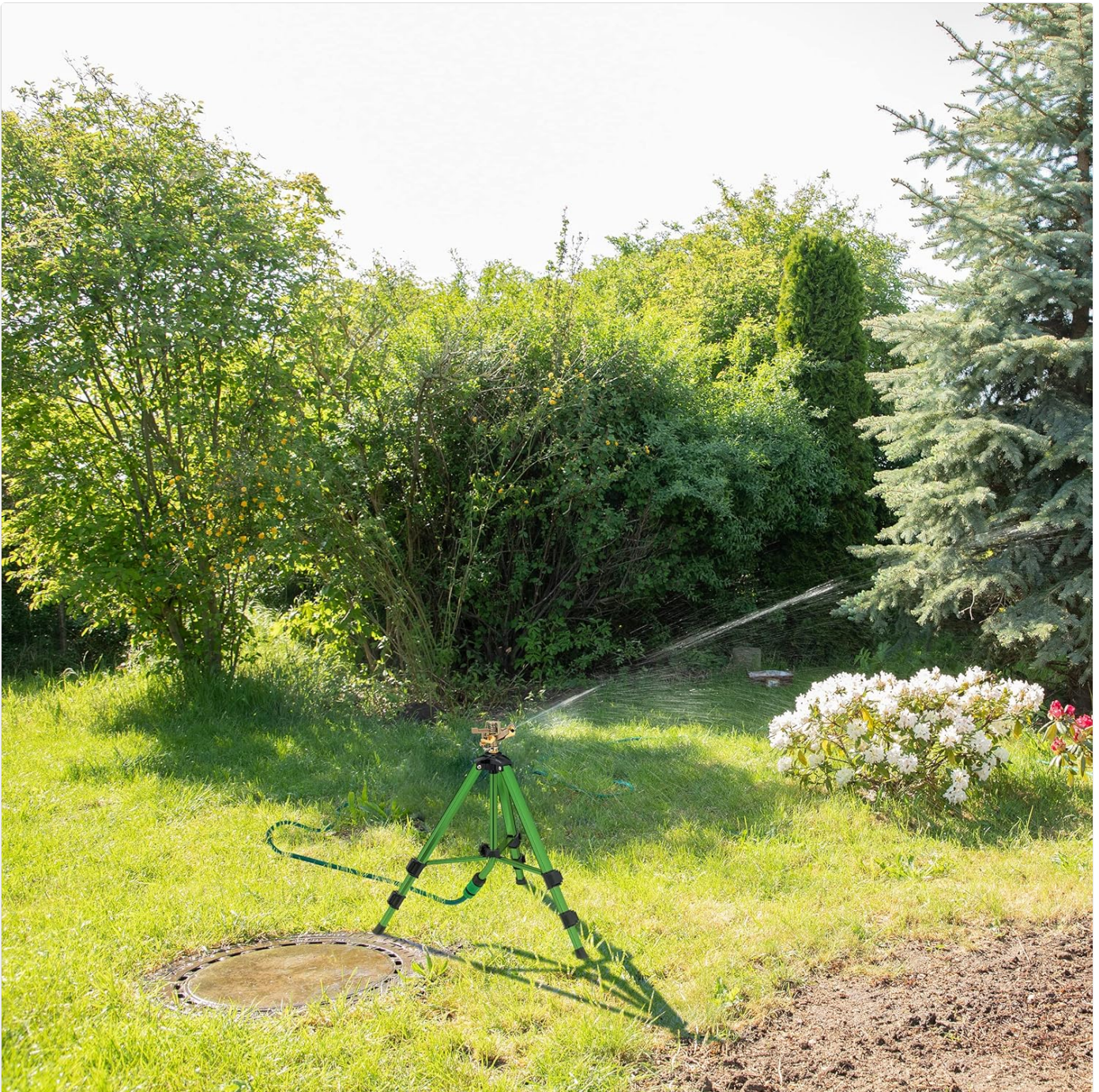
Image: The Relaxdays Sprinkler on its telescopic tripod stand, actively watering a green lawn in a garden setting.