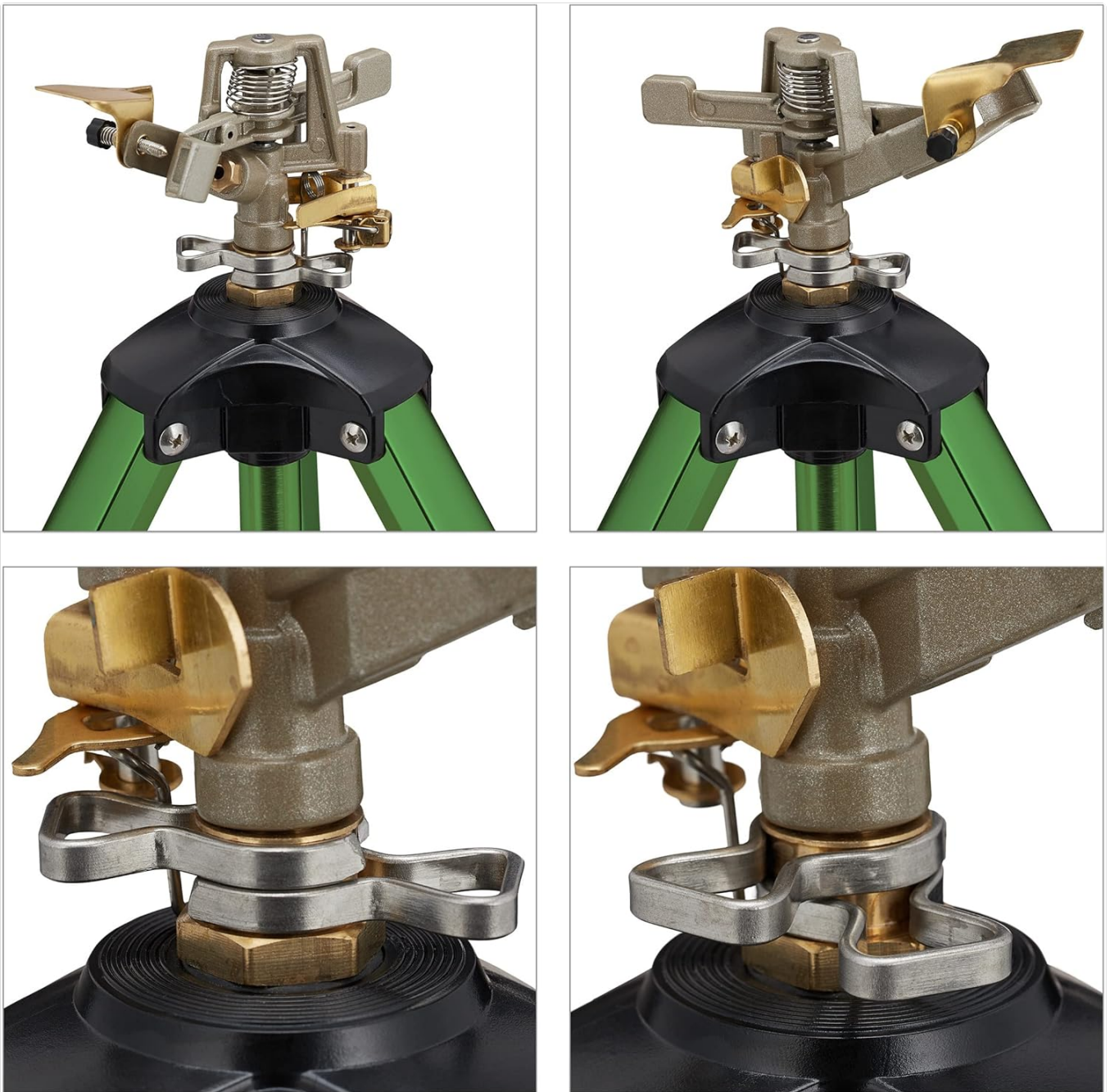
Image: A detailed view of the impact sprinkler head, highlighting the metal components used for adjusting spray distance and the arc of rotation.