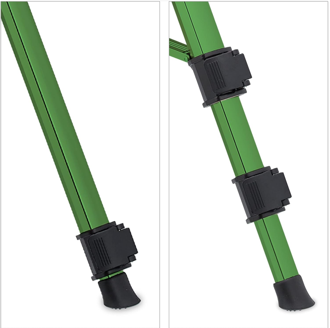
Image: A close-up view of the black locking clips on the green tripod legs, used for adjusting and securing the height.