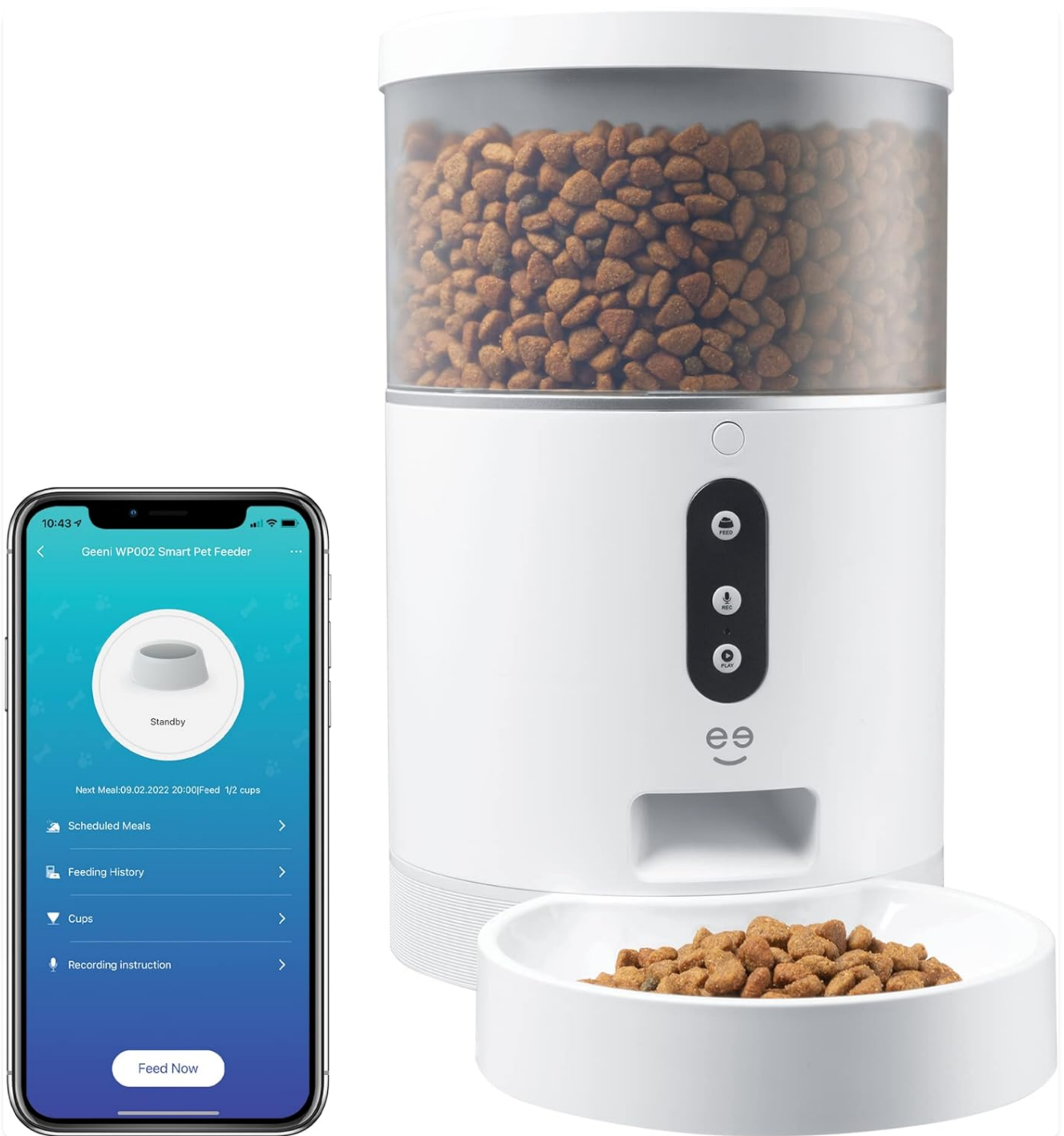
Image: The Geeni Smart Feeder, showing its transparent food reservoir, control panel, and a bowl filled with kibble. A smartphone next to it displays the Geeni app interface for feeder control.