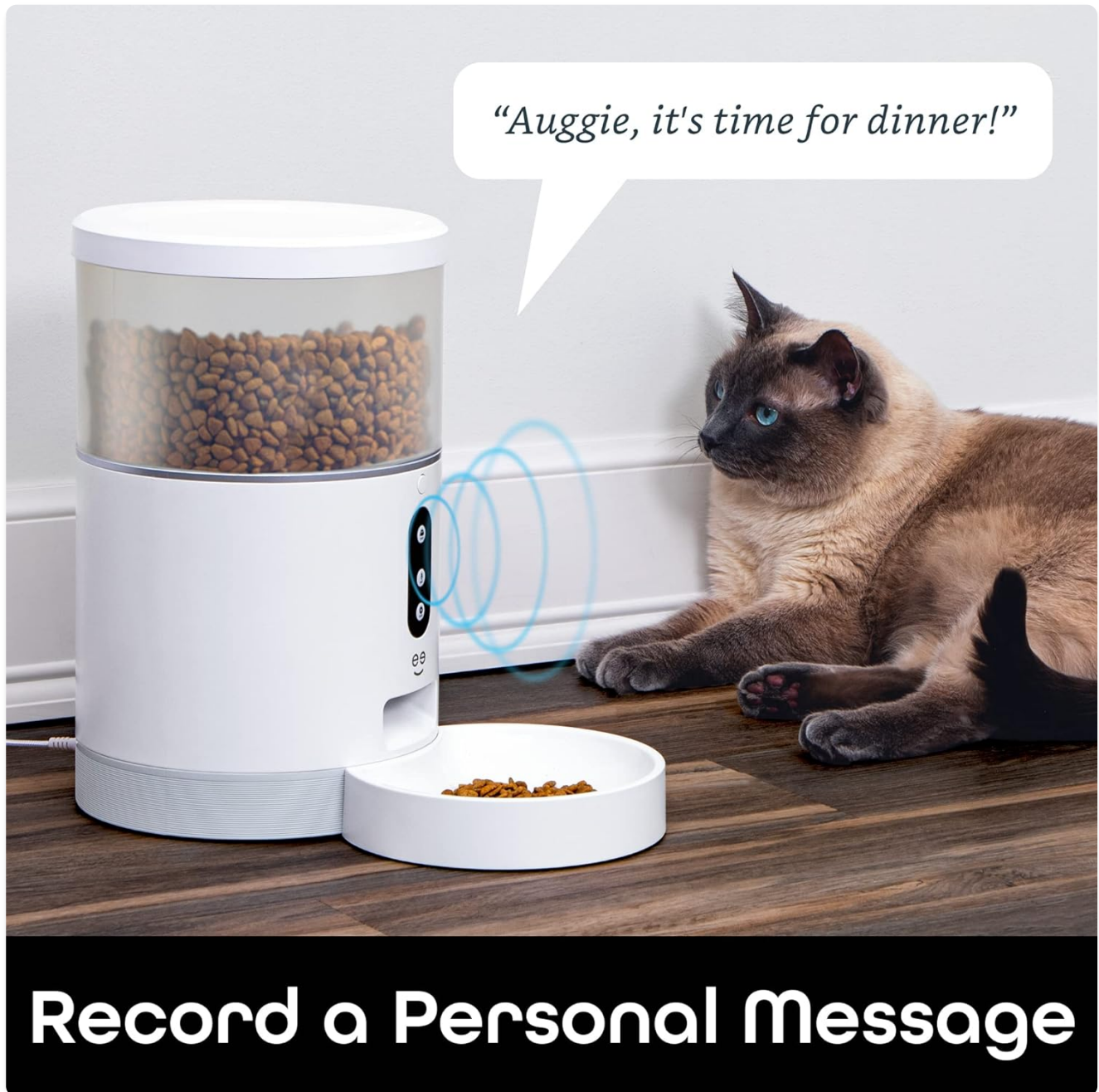
Image: The Geeni Smart Feeder emitting sound waves, with a cat attentively looking towards it, illustrating the voice message feature.

The recorded voice message will play automatically when the feeder dispenses food, alerting your pet that it's mealtime.