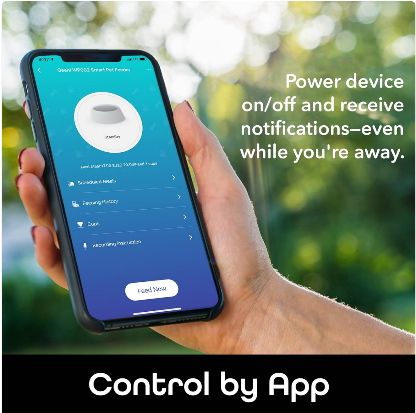
Image: A hand holding a smartphone showing the Geeni app interface, highlighting remote control and notification features.