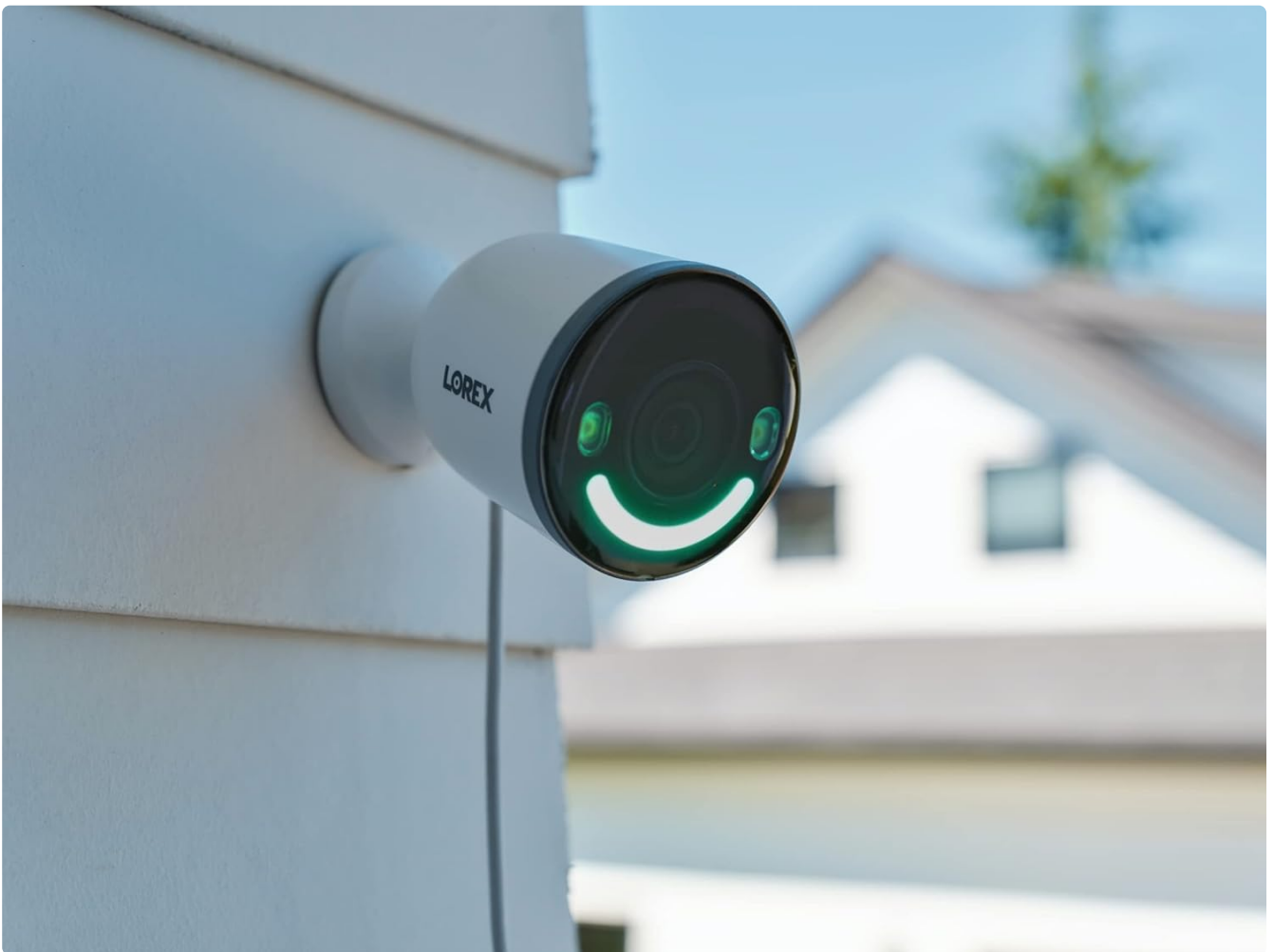
Image: A Lorex camera securely mounted on an exterior wall, demonstrating a typical installation scenario.