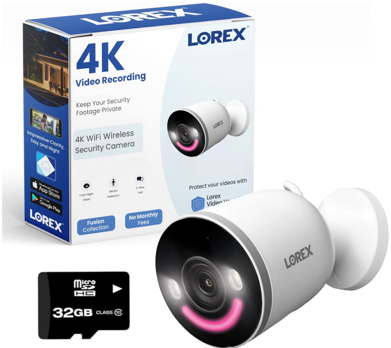
Image: The Lorex 4K Spotlight Wi-Fi 6 Security Camera, its packaging, and the included 32GB MicroSD card.