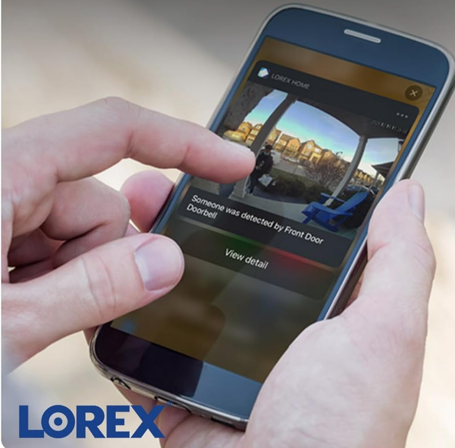
Image: A smartphone displaying a push notification from the Lorex Home app, indicating a person was detected by the camera, highlighting its Smart Motion Detection Plus feature.