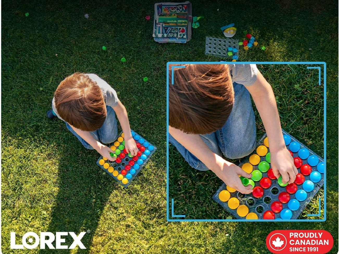
Image: A child playing on a lawn, with a magnified inset demonstrating the camera's 4K Ultra HD resolution and digital zoom capabilities.