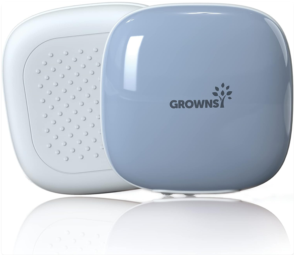
Image 1: The GROWNSY Lactation Massager BLM-3, showing its compact and ergonomic design.