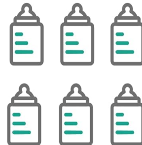
Image 5: Diagram illustrating how vibration and heating modes help improve milk flow and relieve clogs, showing milk output before and after use.