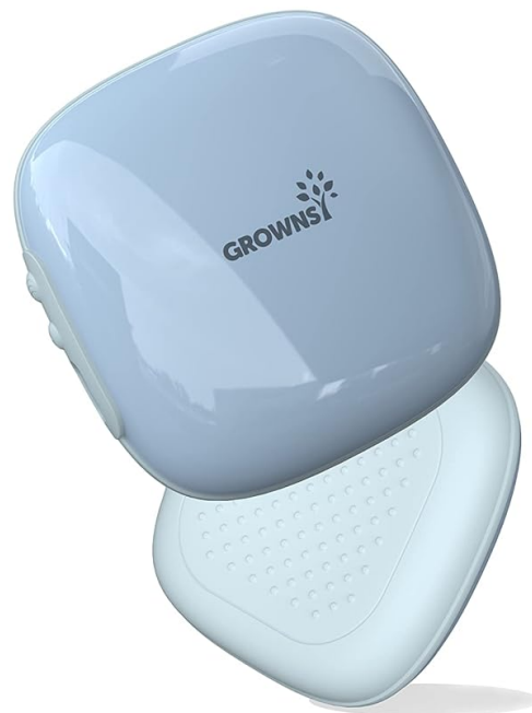
Image 2: Diagram illustrating how the GROWNSY Lactation Massager can help with engorgement, blockage, pain, and low milk supply.