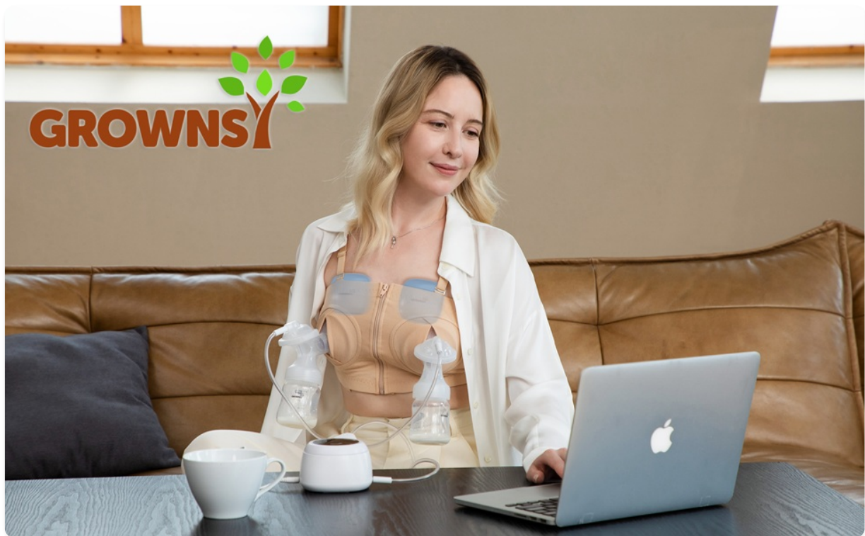
Image 6: A mother using the GROWNSY Lactation Massager while pumping, demonstrating its practical application.