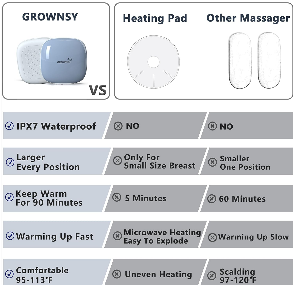
Image 3: Comparison chart highlighting the advantages of the GROWNSY massager, including IPX7 waterproof rating, larger coverage, longer warmth retention, faster warming, and comfortable temperature range.