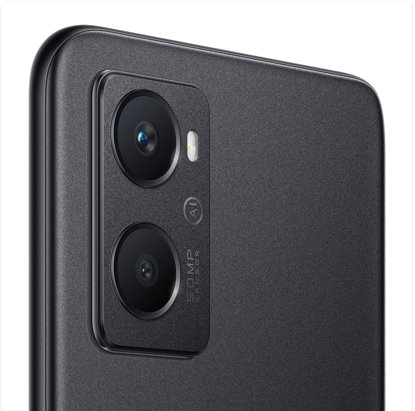
Figure 5: Close-up view of the dual rear camera module on the OPPO A96.