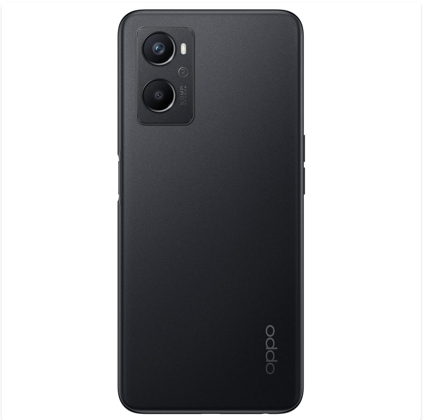
Figure 2: Back view of the OPPO A96, showing the camera module and design.