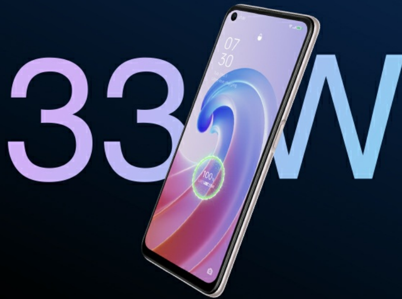
Figure 6: Visual representation of the 33W SUPERVOOC charging and 5000mAh battery capacity.