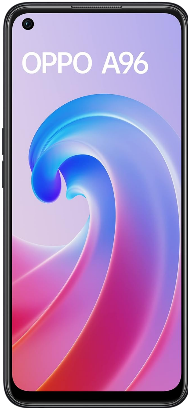
Figure 1: Front view of the OPPO A96 smartphone.