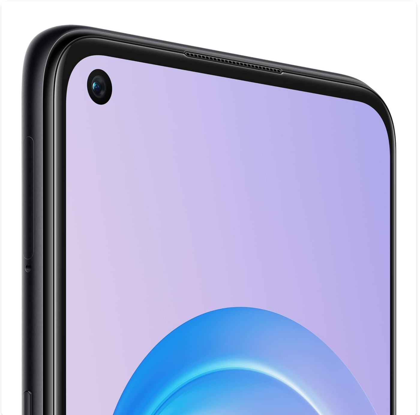
Figure 4: Detail of the punch-hole front camera on the OPPO A96.