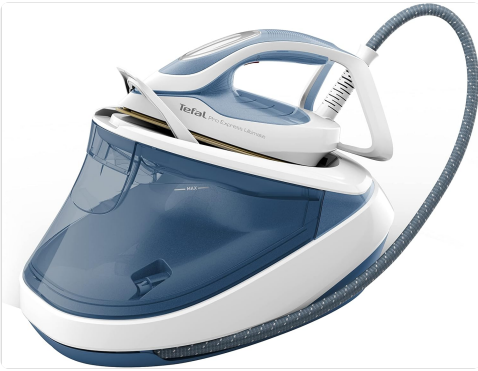
Front view of the Tefal Pro Express Ultimate GV9710 steam generator iron, showcasing its compact design and large water tank.