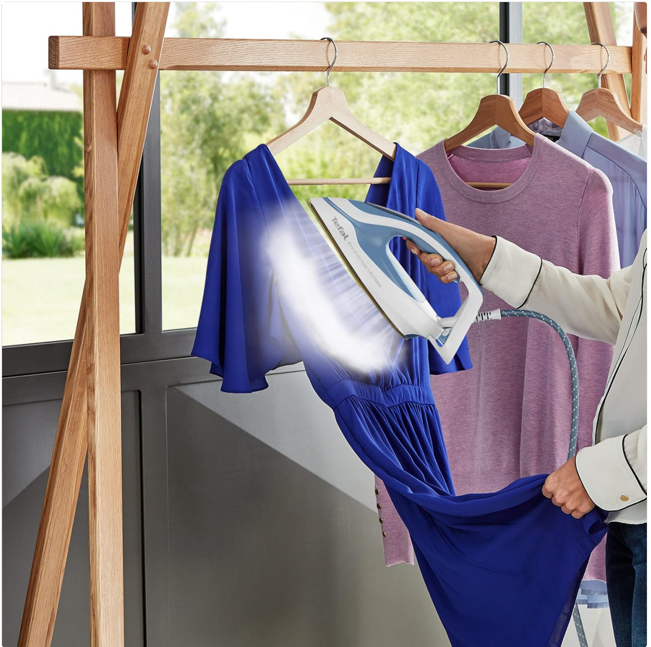
A person ironing a shirt, demonstrating the effective steam output of the iron.