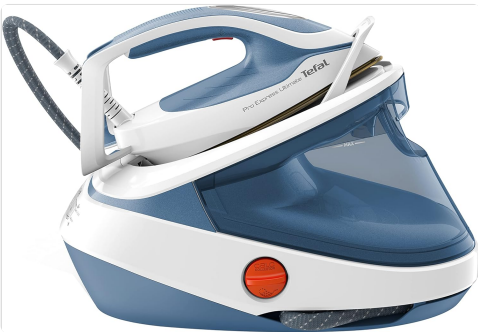
Side view of the steam generator iron, highlighting the Calc Collector for easy descaling.