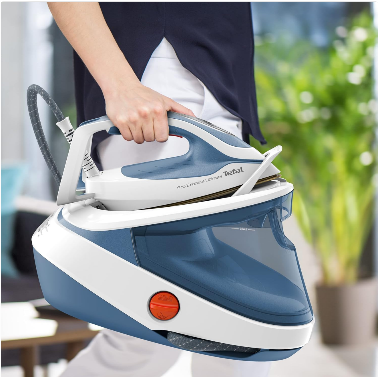
A person carrying the steam generator iron, demonstrating its portability when locked to the base.