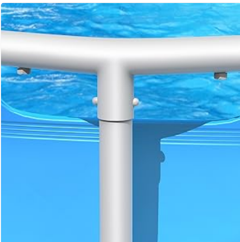
Image: Secure Frame Connection. This image shows a close-up of the secure connection points for the metal frame, highlighting the robust design that ensures stability.

Image: Easy 3-step pool setup. This image illustrates the three main steps for setting up the pool: laying the liner on flat ground, assembling the metal frame, and filling the pool with water.