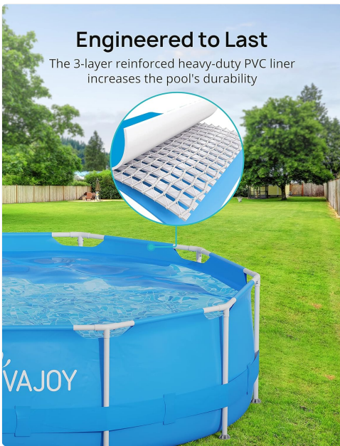
Image: Engineered to Last. This image provides a detailed view of the 3-layer reinforced heavy-duty PVC liner, highlighting its construction for increased durability and resistance to rips and punctures.