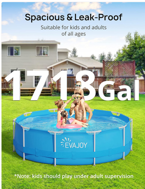
Image: Pool Capacity. This image highlights the pool's capacity of 1718 gallons, with children and adults enjoying the water, emphasizing the spacious and leak-proof design.

30in round pool in a backyard setting, demonstrating its family-size capacity.