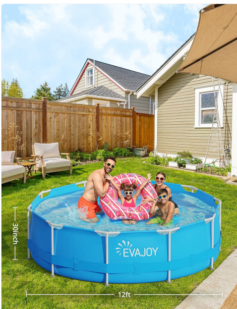
Image: Family Enjoying the Pool. This image shows a family with children enjoying the 12ft x 30inch EVAJOY pool.