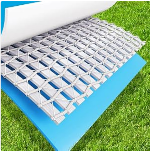
Image: Enhanced Wall Support. This image details the 3-layer PVC support bands that wrap around the pool, providing additional stability and reinforcing the pool walls.