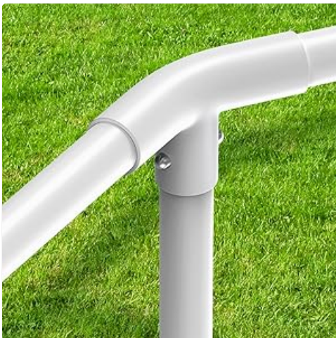
Image: Reinforced Frame. This image focuses on the sturdy galvanized steel frame, emphasizing its resistance to rust and corrosion for a long lifespan.