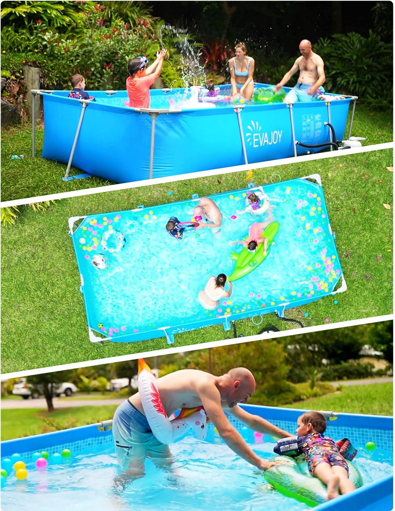
Image: Two children in the EVAJOY pool, demonstrating its robust design suitable for active play and long-term enjoyment.