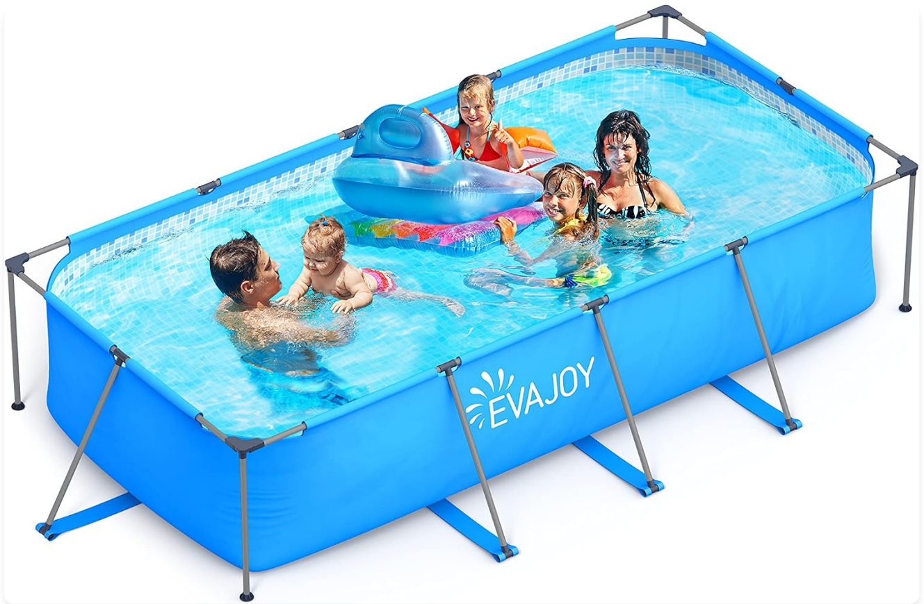
Image: The EVAJOY 14ft x 7ft x 33in Metal Frame Swimming Pool, shown with a family enjoying the water, highlighting its rectangular shape and sturdy frame.