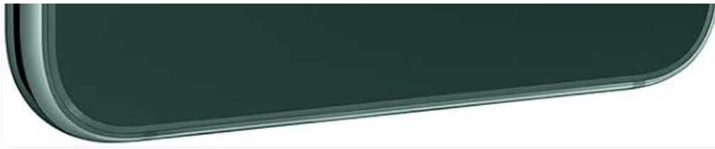
Figure 5: Physical aspects of the Samsung Galaxy S22 SM-S901U, including side profile and rear camera array.