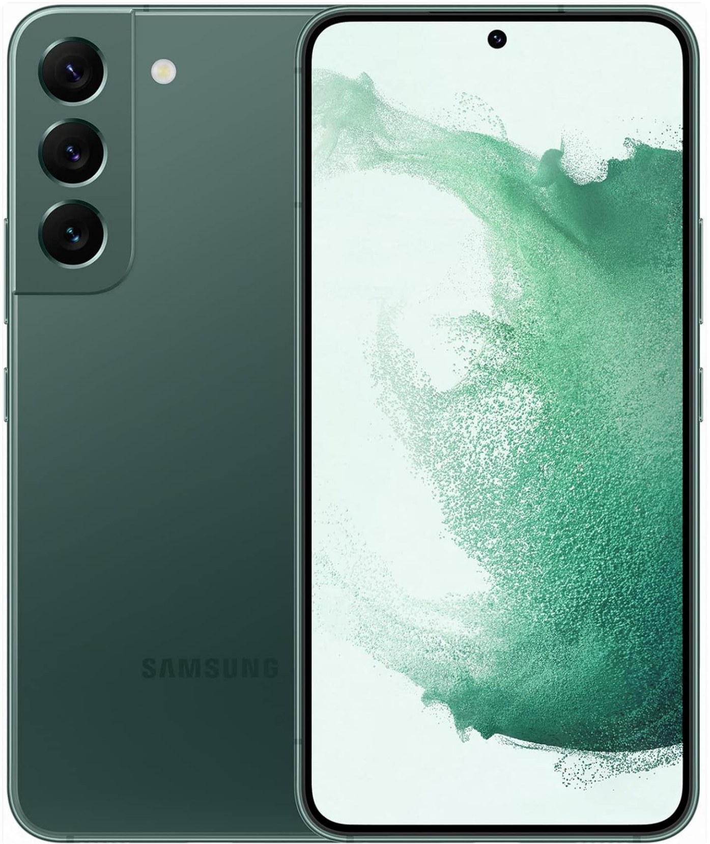
Figure 1: Front and back view of the Samsung Galaxy S22 SM-S901U.