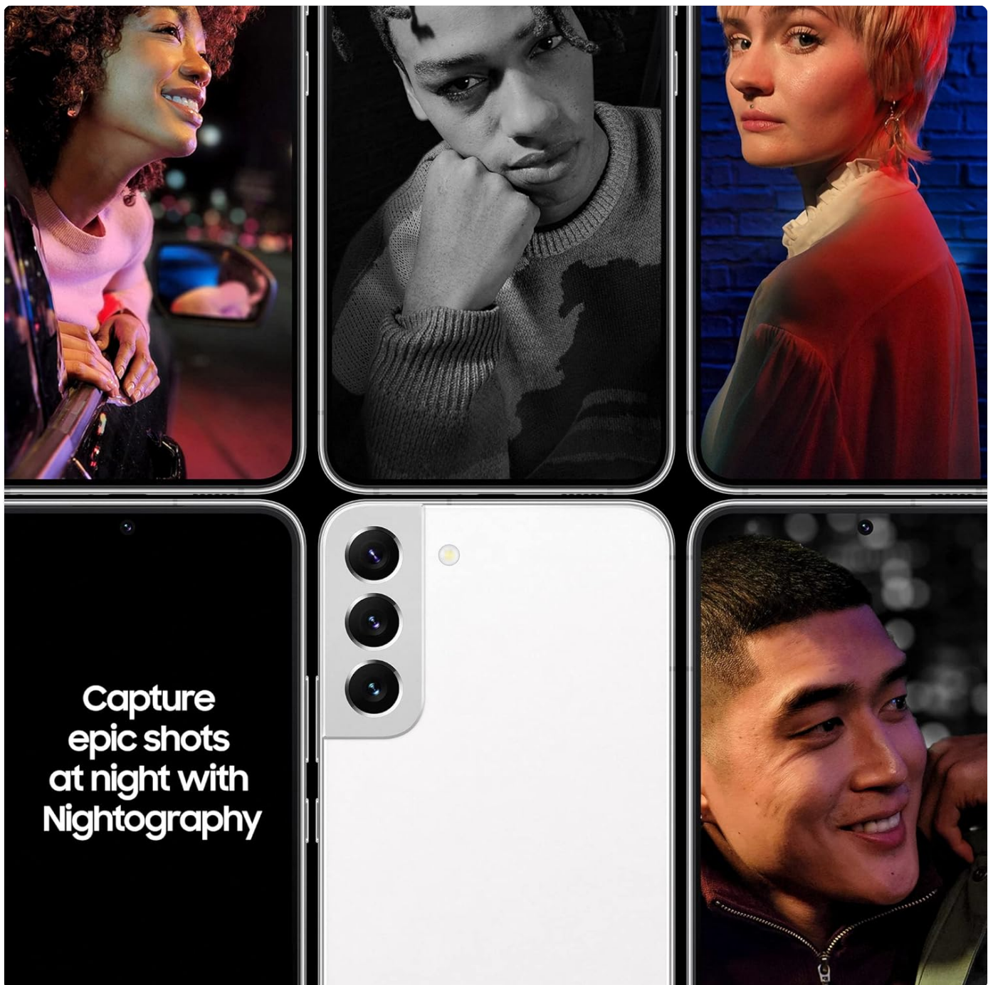
Figure 2: The Nightography feature allows for capturing clear and vibrant photos in low-light conditions.