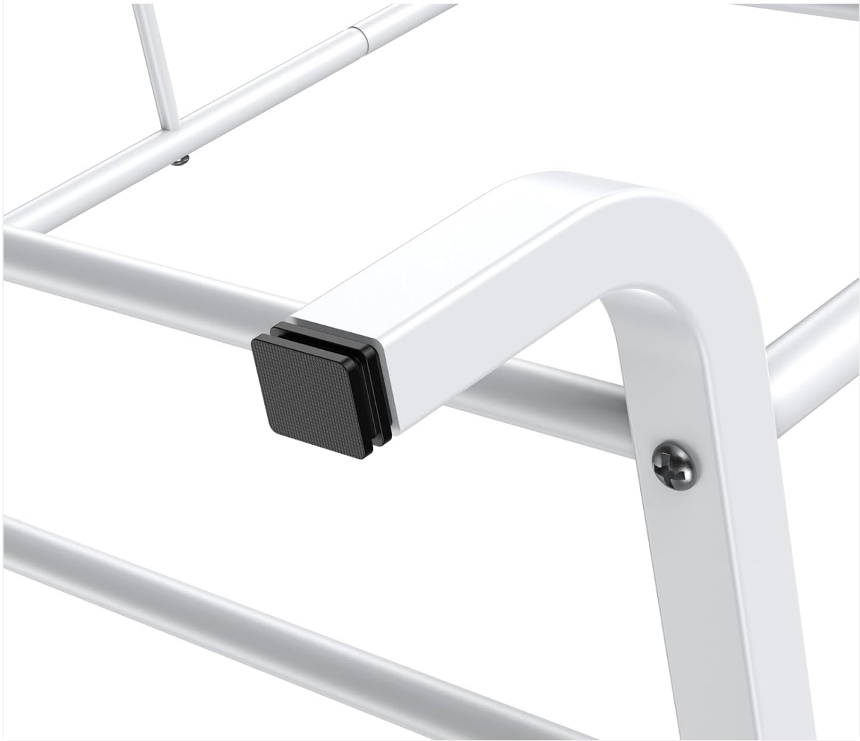
Figure 3.3: A detailed view of the anti-slip mat located on the foot of the garment rack, which helps protect floor surfaces and provides additional grip.