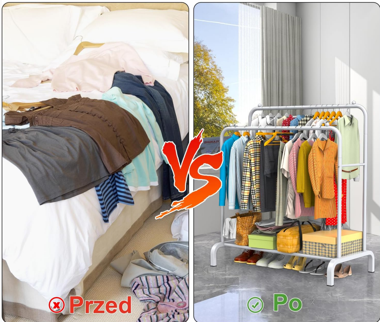
Figure 4.2: A visual comparison demonstrating the organizational benefits of the garment rack, transforming a cluttered space into a neat and orderly arrangement of clothes and accessories.