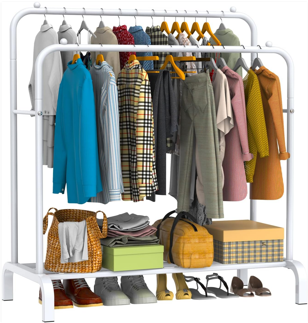
Figure 1.1: The LOEFME Double-Rail Garment Rack, showcasing its dual hanging rails and lower storage shelves, fully loaded with various garments, shoes, and storage boxes. This image illustrates the rack's capacity and organizational potential.