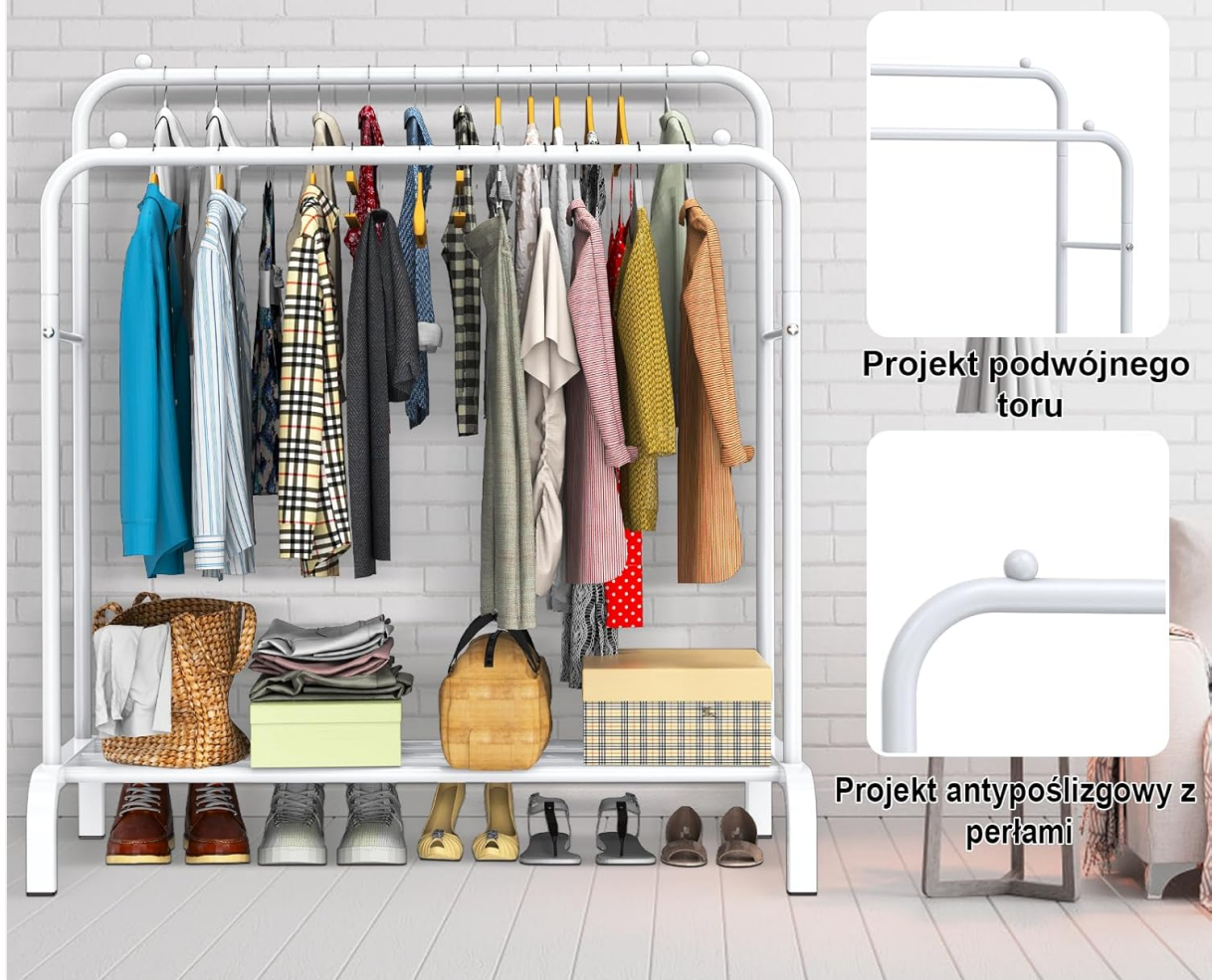
Figure 3.1: Detail showing the double track design of the hanging rails and the anti-slip pearl stoppers at the ends, which prevent hangers from sliding off.