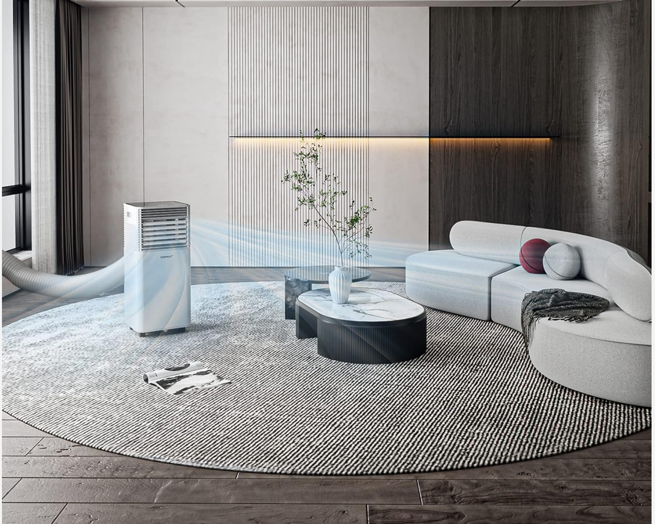
Image: The portable air conditioner positioned in a room, demonstrating its cooling capability for areas up to 230 sq. ft. with the exhaust hose properly installed in a window.