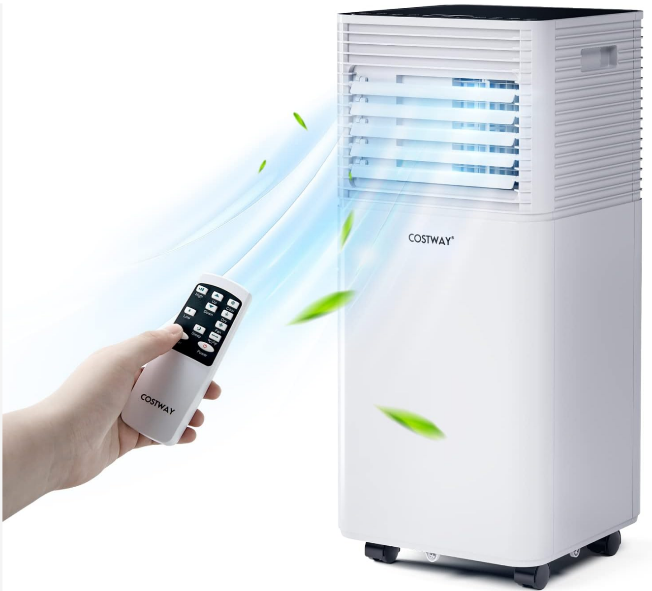
Image: The COSTWAY Portable Air Conditioner unit with its remote control, showing air flowing from the unit.