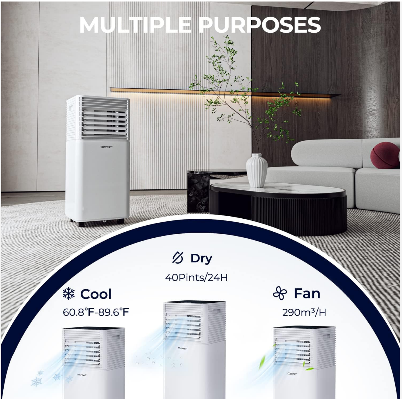
Image: Visual representation of the unit's multiple purposes: cooling, dehumidifying, and fan operation.