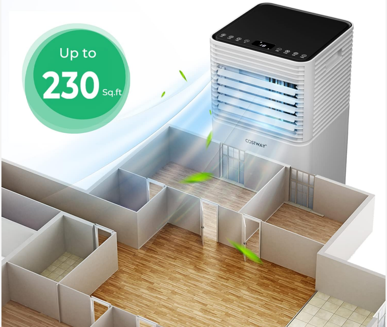
Image: An aerial view of a room layout illustrating the wide cooling area of up to 230 sq. ft. that the portable air conditioner can effectively cover.