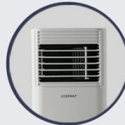
Image: Detailed view of the unit's features, including rolling casters for mobility and a built-in handle for easy transportation.