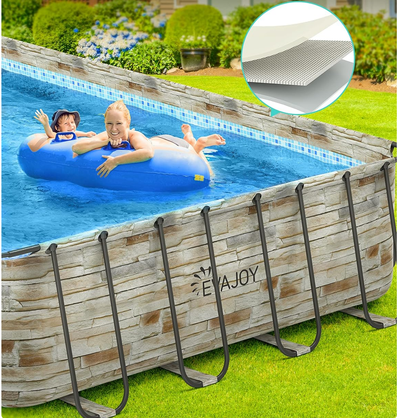
Figure 5.1: The durable 3-layer reinforced PVC liner designed for longevity.

3-layer reinforced heavy gauge PVC liner