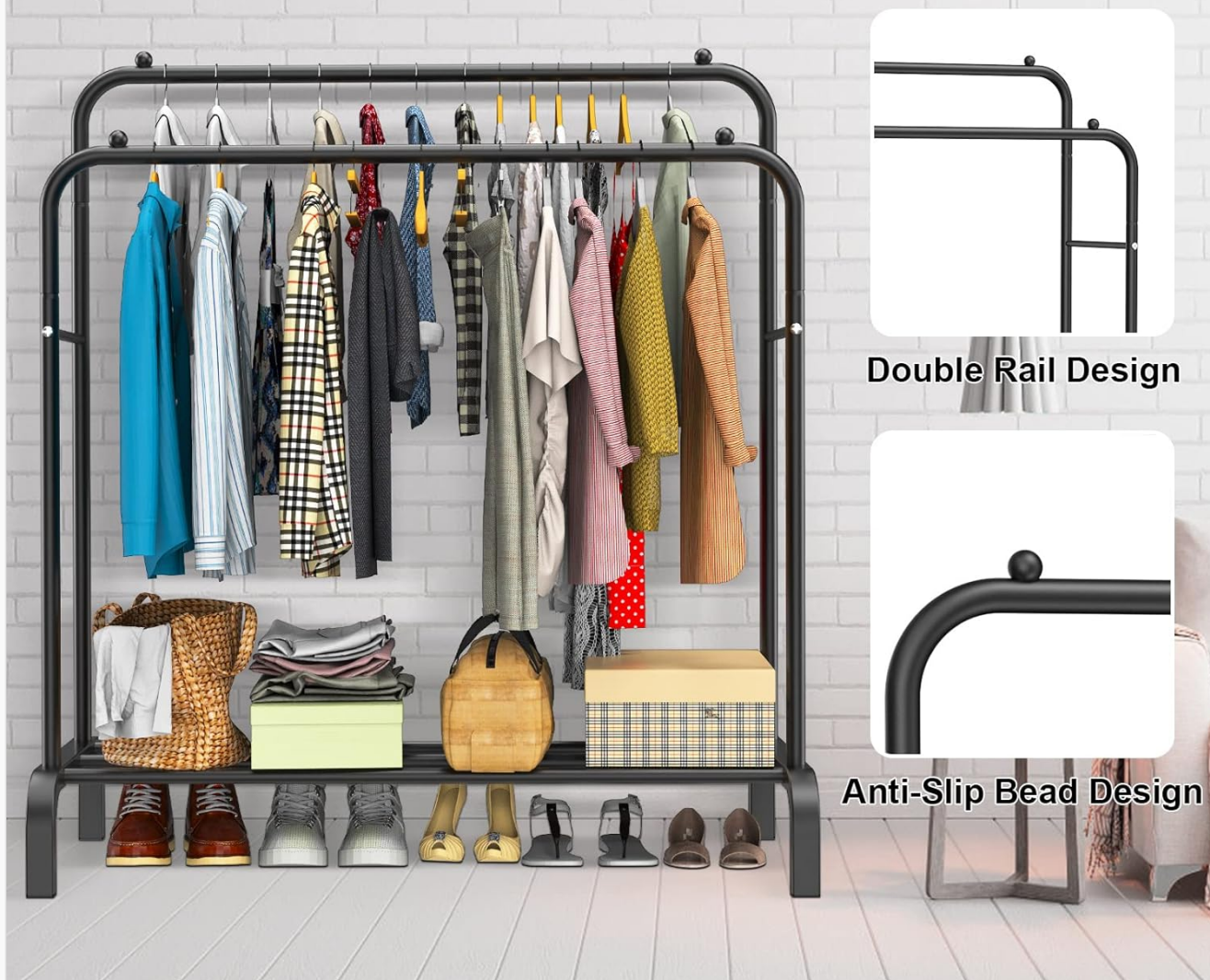
Figure 2.3: This image focuses on specific design elements, including the double rail for increased hanging space and the anti-slip beads on the rails to prevent hangers from sliding off.