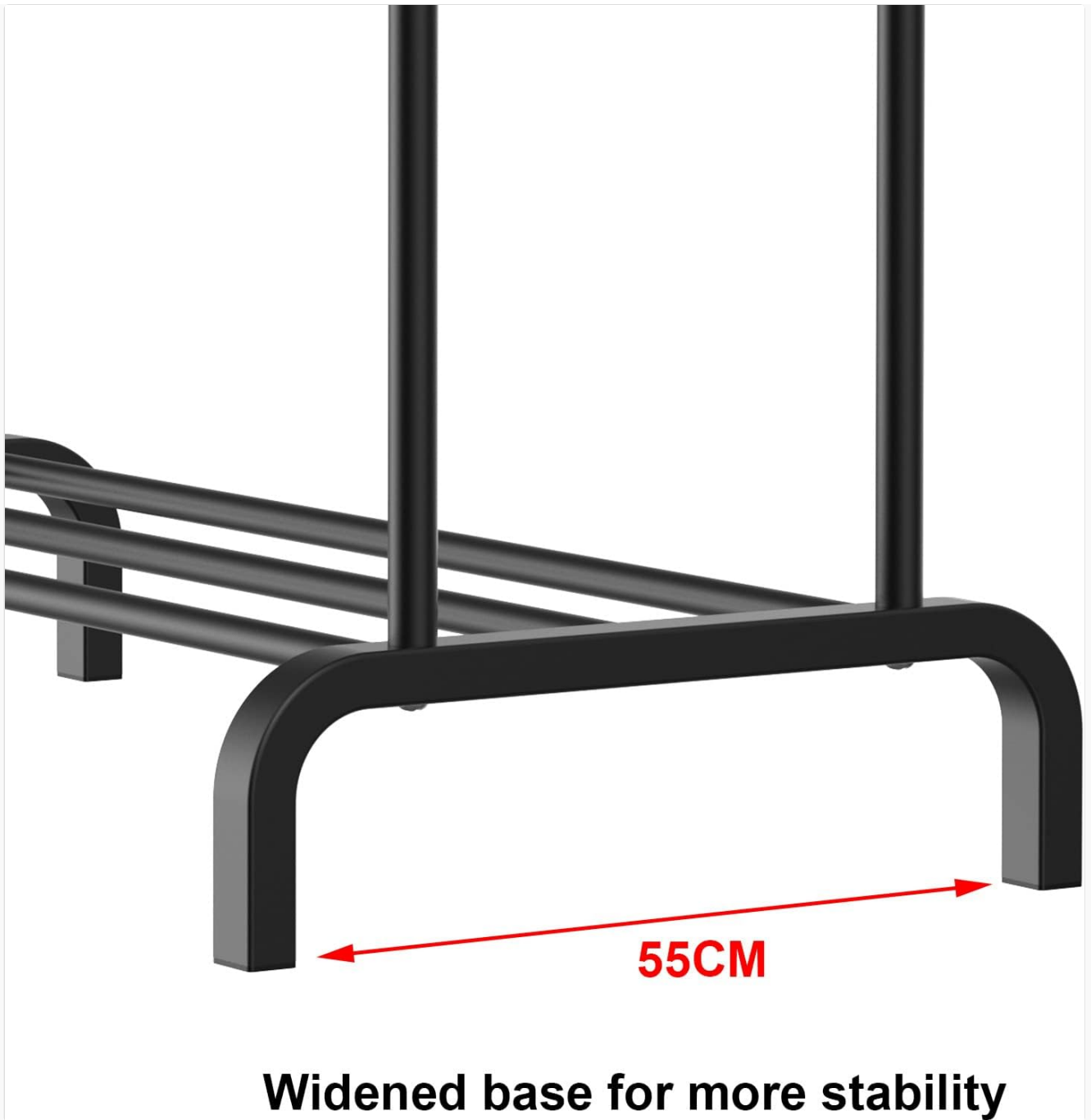
Figure 7.3: This image illustrates the 55cm wide base of the clothes rack, a design feature intended to provide greater stability and prevent tipping.