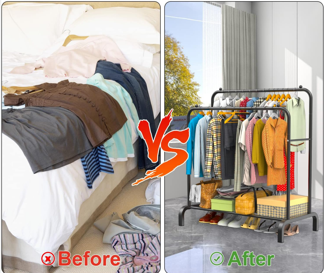
Figure 4.1: This visual comparison demonstrates how the clothes rack can transform a cluttered space into an organized one, highlighting its 25kg capacity for clothes.