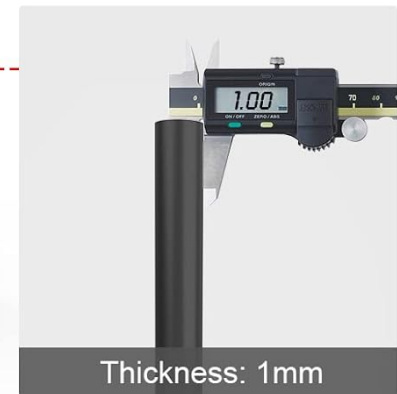
Figure 7.1: This image provides technical details of the rack's construction, showing the steel pipe diameter of 20mm and a thickness of 1mm, indicating durability.