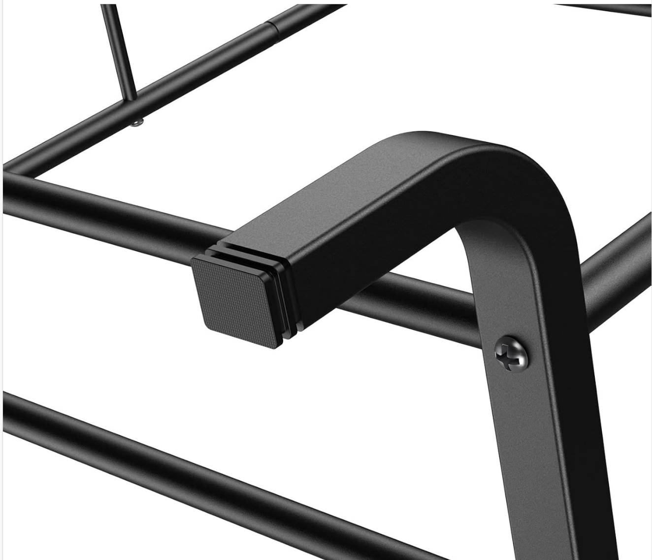
Figure 5.1: This image highlights the non-slip floor mats integrated into the rack's feet, designed to protect floor surfaces and enhance stability.