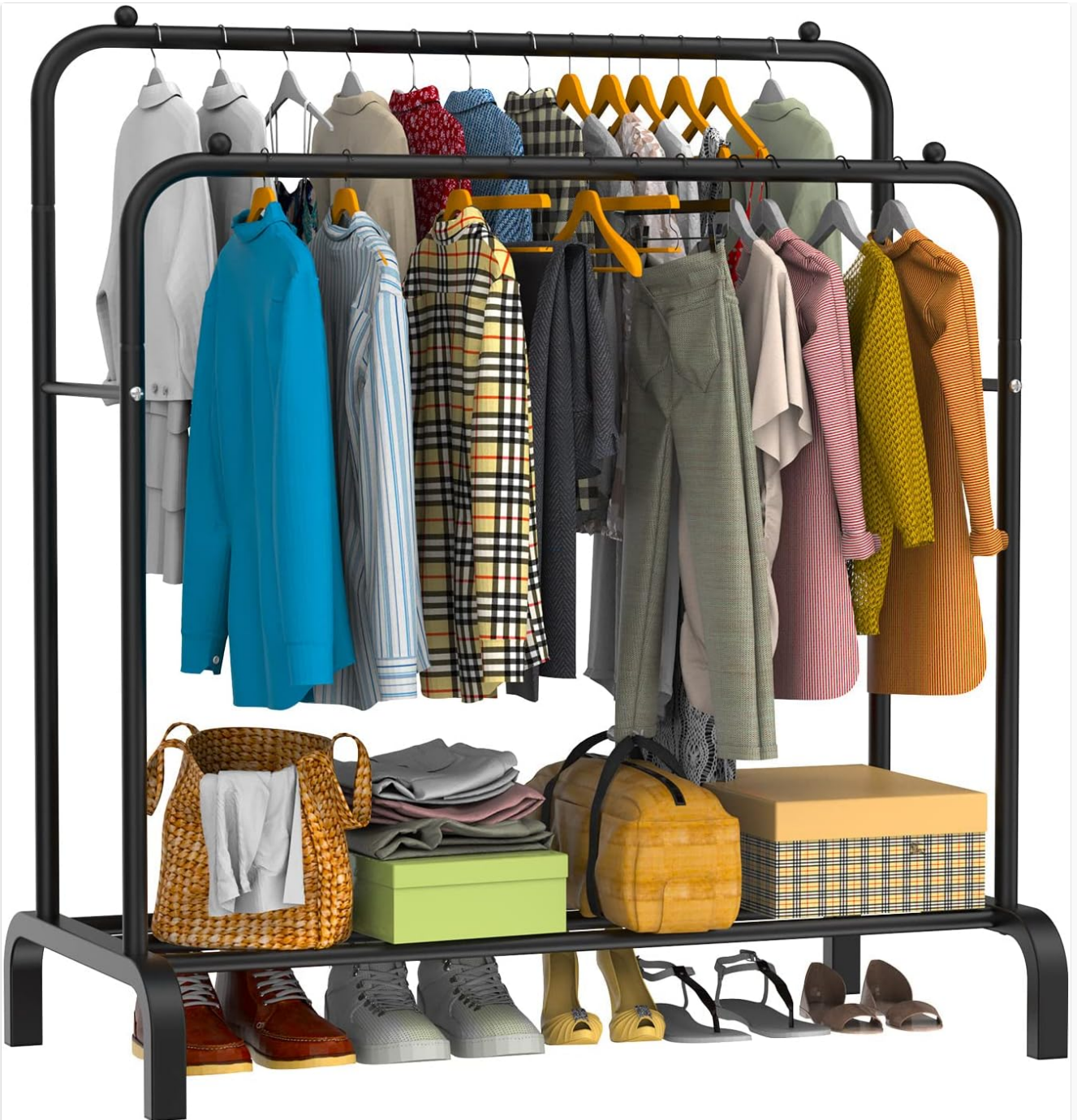
Figure 2.1: The LOEFME multifunctional clothes rack in a home setting, showcasing its dual functionality for hanging clothes and storing shoes. The rack is black metal with a minimalist design, holding various clothing items on its double rails and shoes on the bottom shelf.