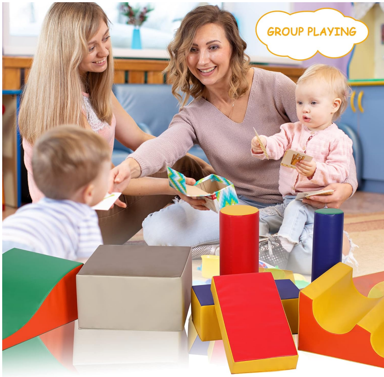
Image 4.2: The climbing set facilitating group play and interaction.