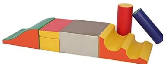
Image 5.1: Demonstrating the easy-to-clean surface of the foam blocks.