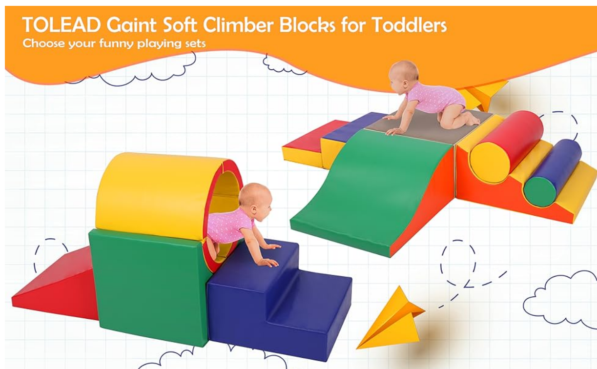
Image 2.1: Safety features of the foam climbing blocks, emphasizing material quality.