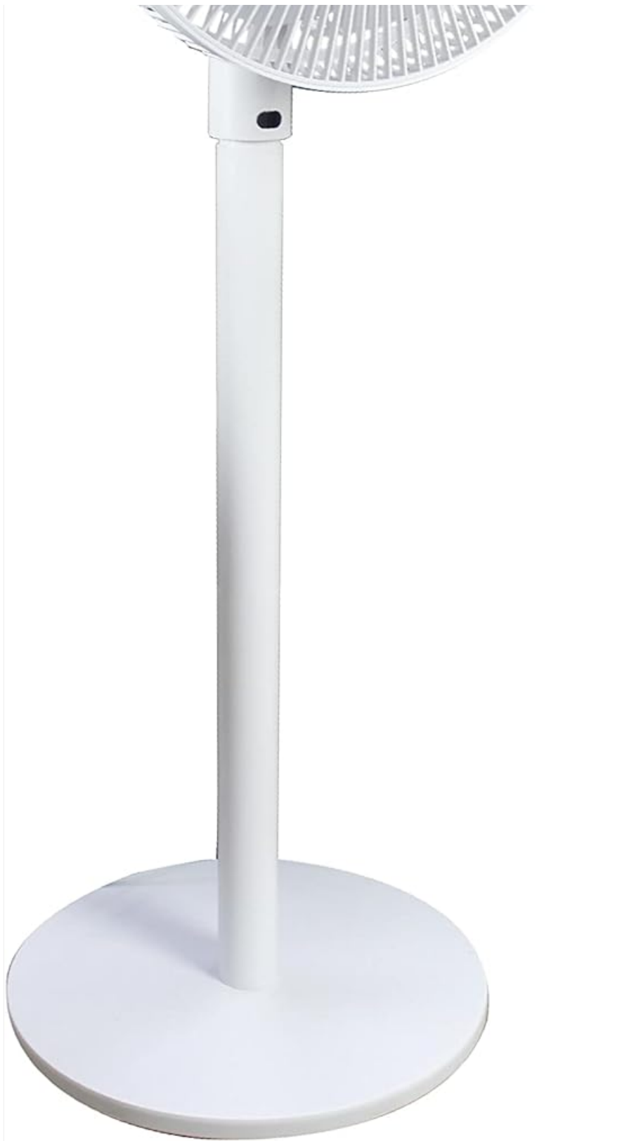
Figure 2: Side view of the Mistral MHV712R High Velocity Fan, illustrating its profile and the adjustable angle of the fan head.