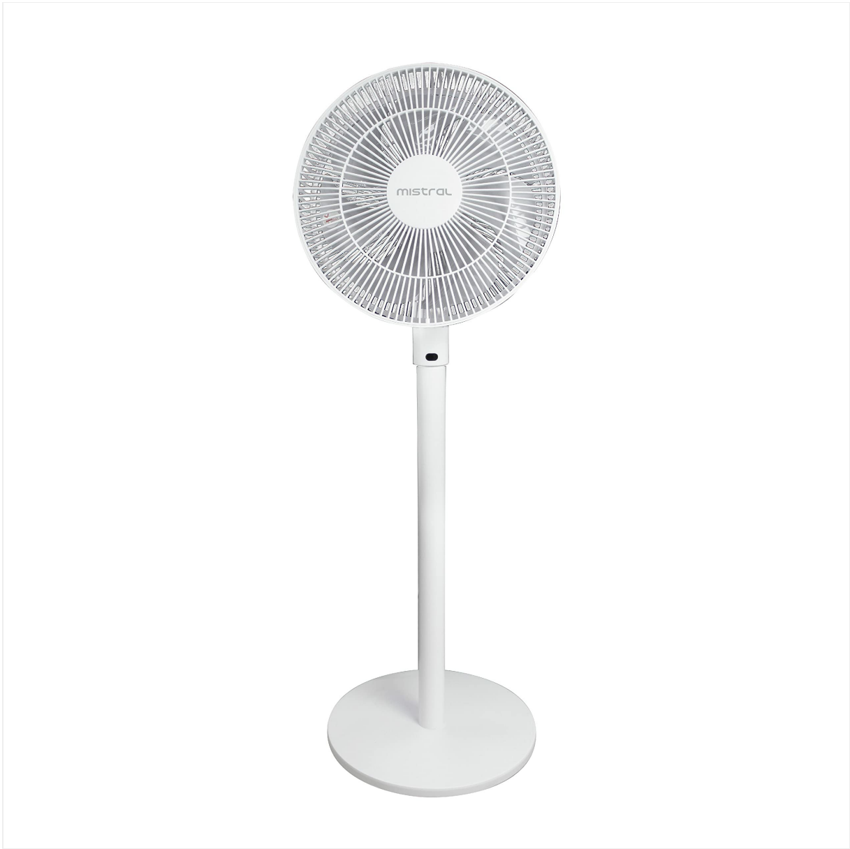
Figure 1: Front view of the Mistral MHV712R High Velocity Fan, showing the fan head, stand, and round base.