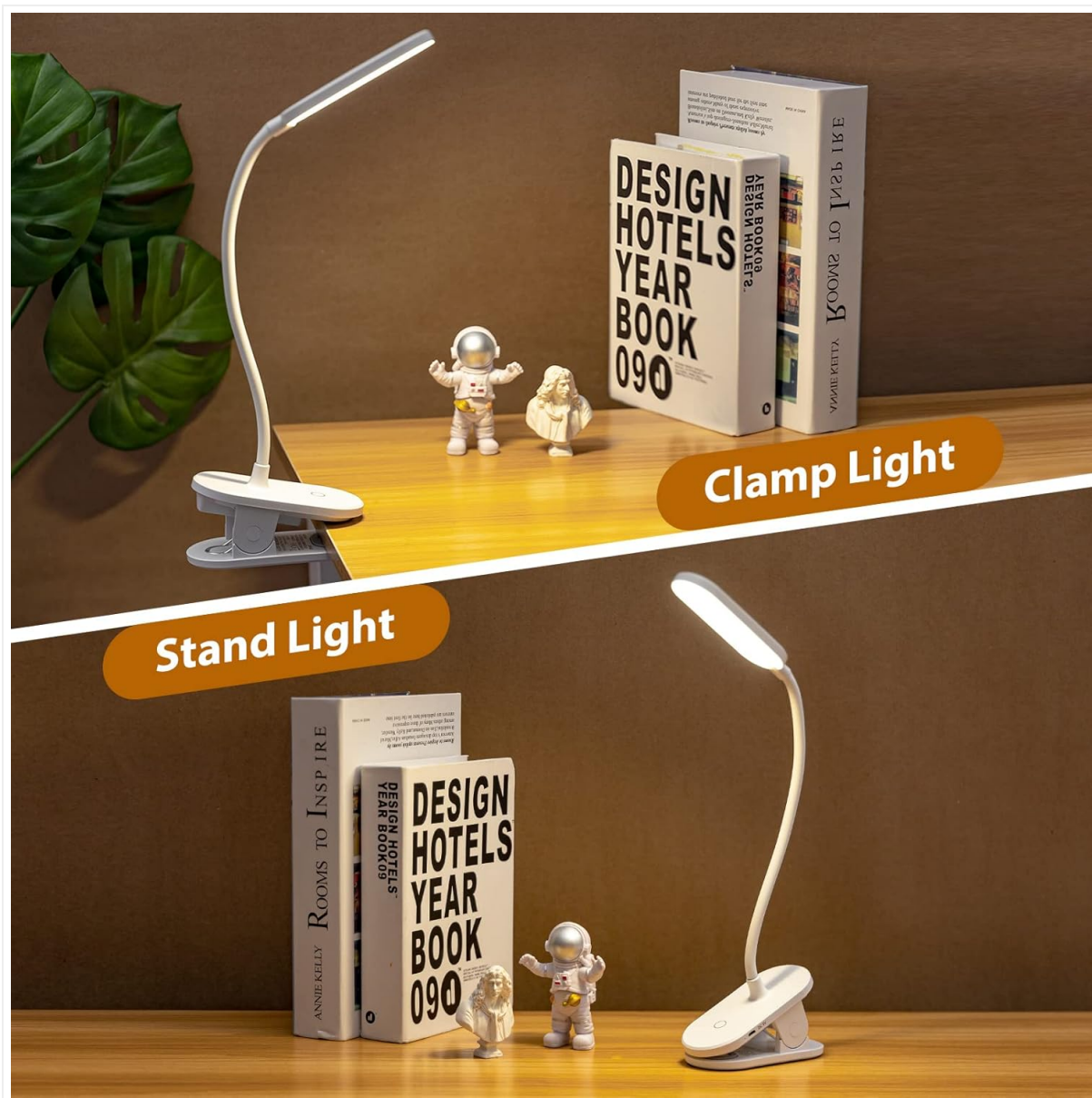
Image 3.1: Demonstrates the light's versatility as both a clamp-on and a freestanding unit.

Adjust the flexible gooseneck to direct the light precisely where needed.