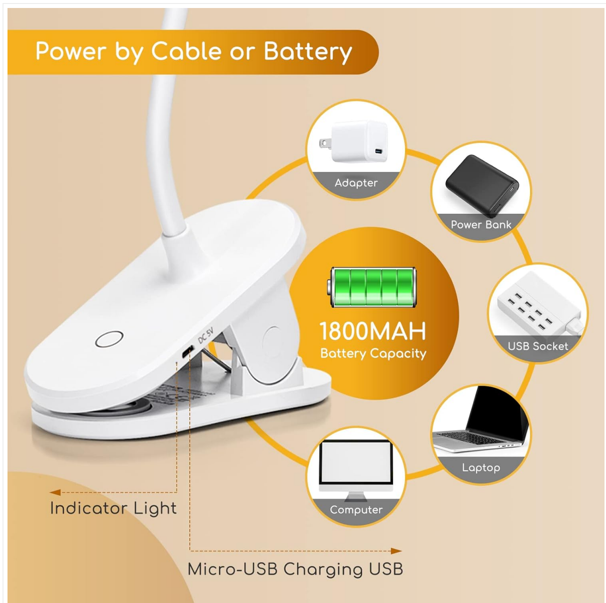
Image 4.3: The light can be charged via various USB power sources, including laptops, power banks, and USB wall sockets.

4. An indicator light will illuminate during charging.