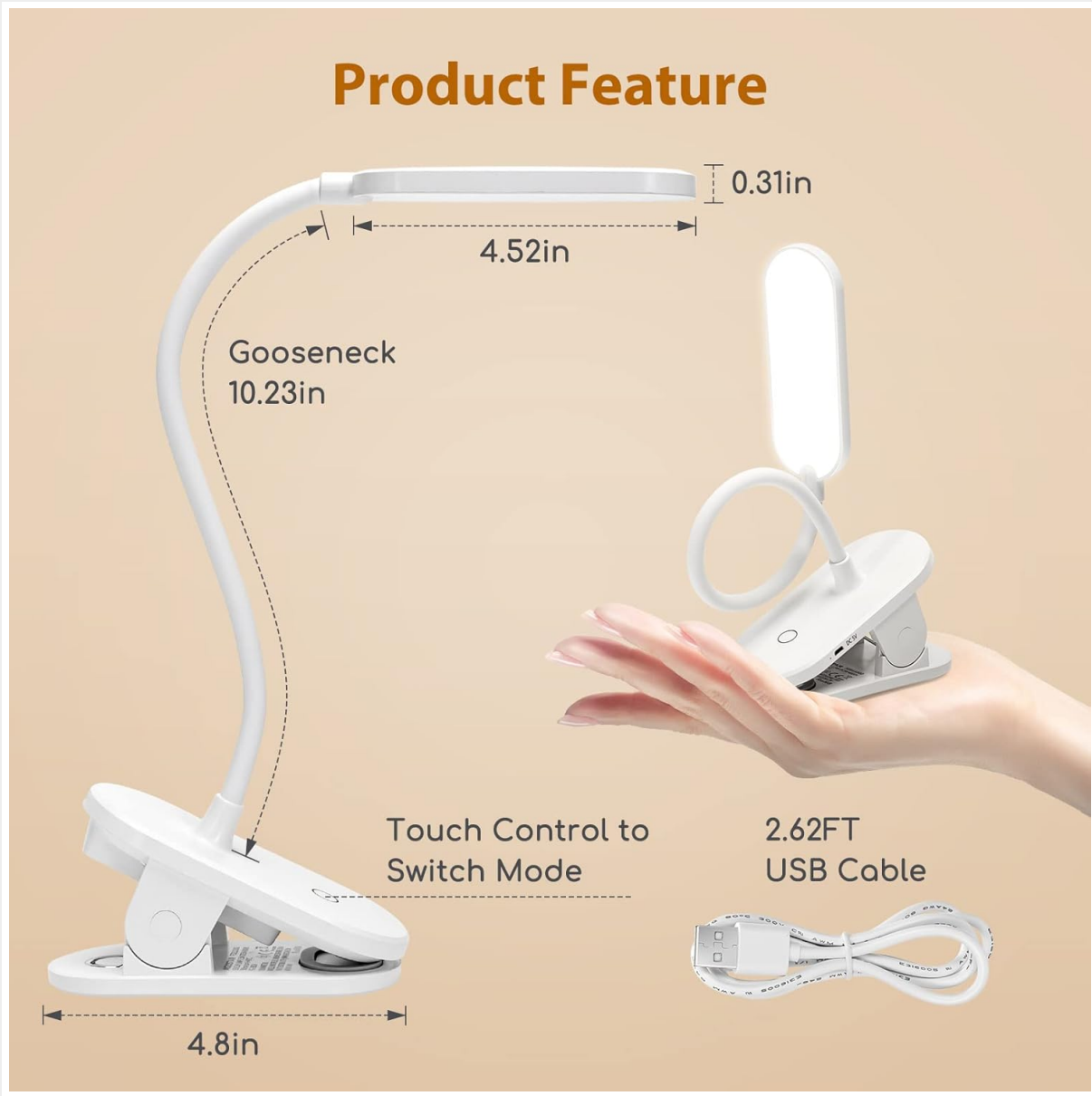
Image 7.1: Detailed dimensions of the Aigostar Book Reading Light.