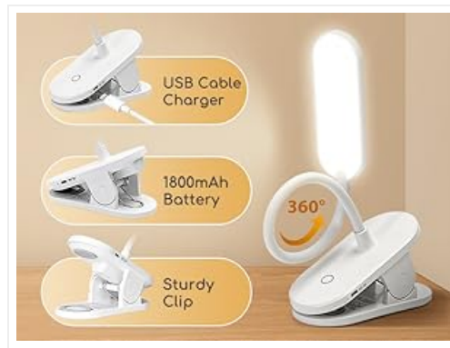
Image 2.2: Detailed view of the light's features including the USB charging port, 1800mAh battery, sturdy clip, and flexible gooseneck.