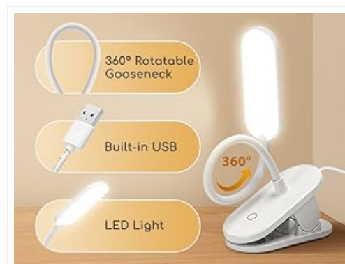
Image 4.4: The light is easily charged using a standard USB connection.