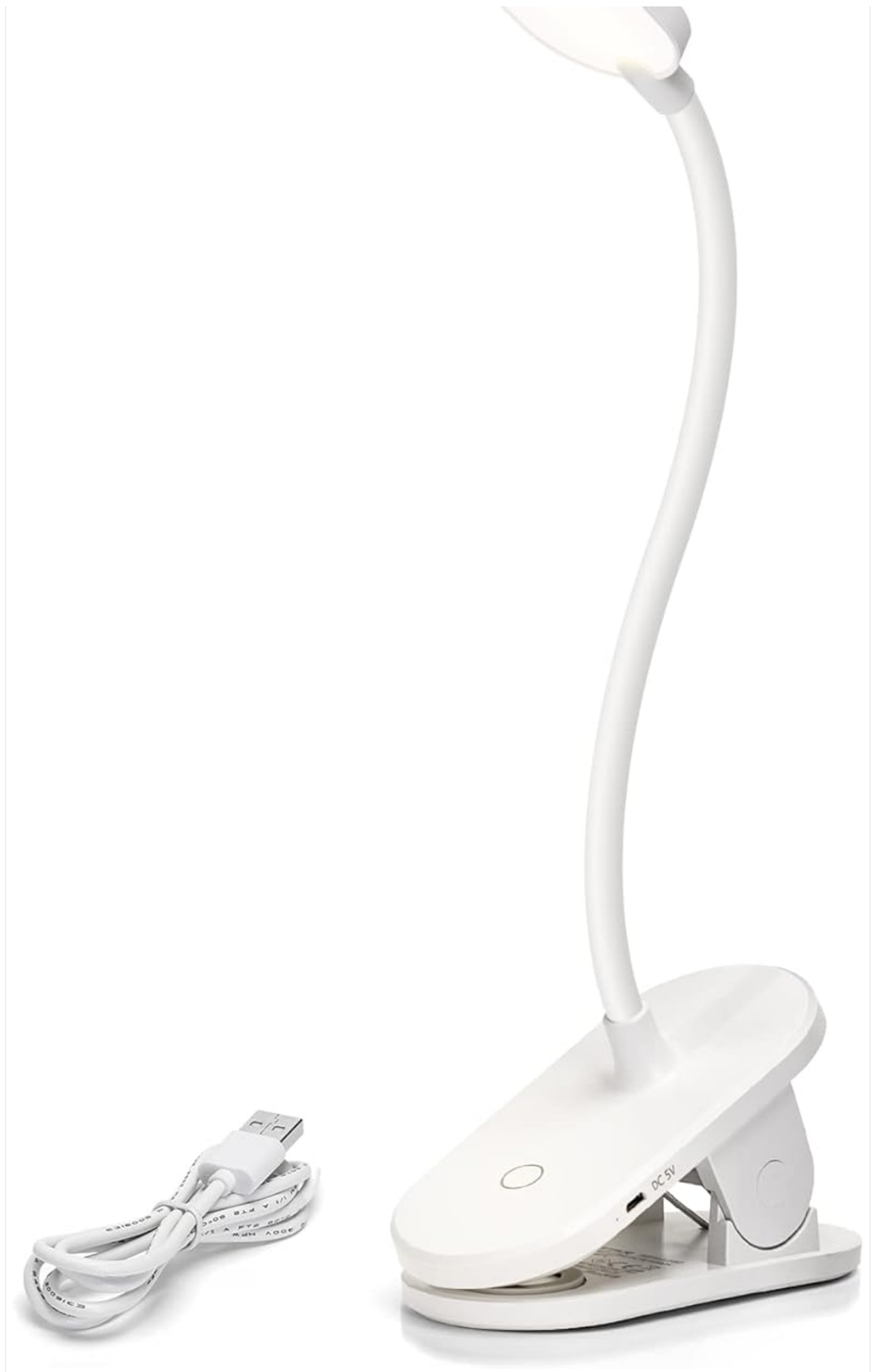
Image 2.1: The Aigostar USB Rechargeable Book Reading Light with its included USB charging cable.