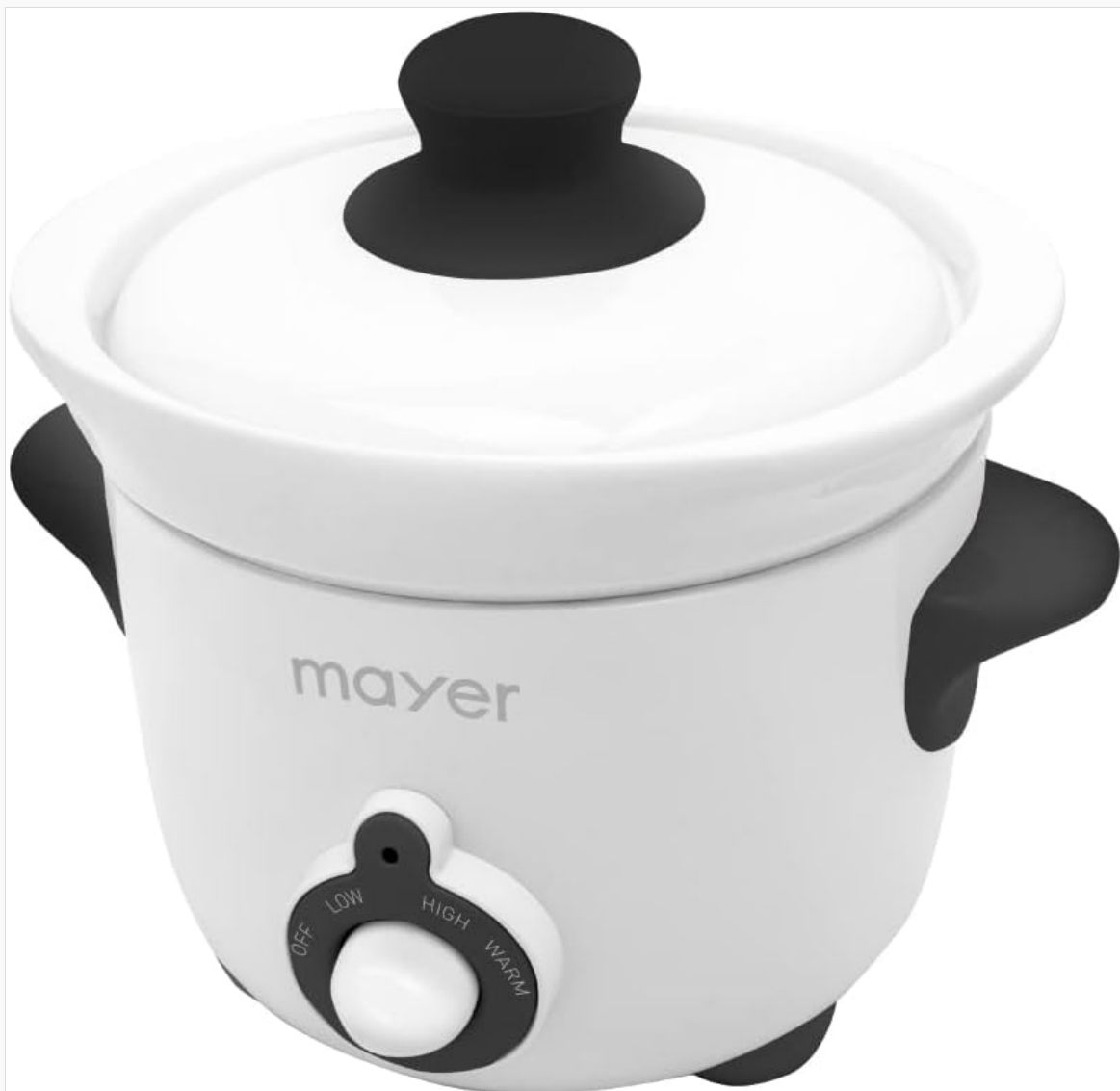
Image: Front view of the Mayer MMSC15-BK Slow Cooker, showing the main unit, ceramic pot, lid, and the control knob with OFF, LOW, HIGH, and WARM settings.