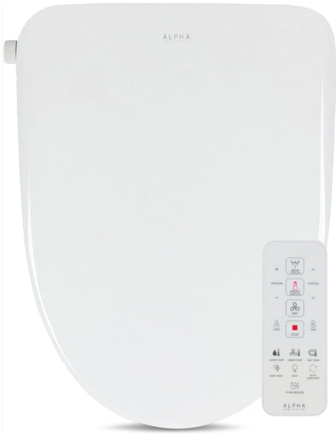
Figure 1: The UX Pearl Bidet Toilet Seat and Remote Control. This image showcases the compact and modern design of the bidet seat, highlighting its low profile and the accompanying remote for easy control.