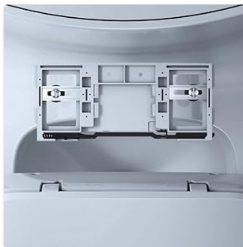
Figure 2: Mounting Plate Installation. This image shows the mounting plate secured to the toilet bowl, ready to receive the bidet seat.