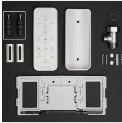
Figure 3: Complete Installation Kit. This image displays all the parts required for installation, including the remote, mounting hardware, and T-valve.