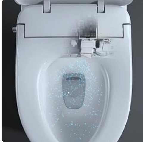
Figure 7: Pure Breeze Deodorizer. This image visually represents the air plasma generation process that controls odors and bacteria within the toilet bowl.

The Pure Breeze function utilizes ion particles to sanitize and freshen the bowl. This feature does not require replacement cartridges, simplifying maintenance.