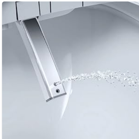
Figure 6: Self-Cleaning Nozzle. This image illustrates the nozzle's self-cleaning mechanism, ensuring hygiene with every use.

The stainless steel nozzle is self-cleaning, automatically rinsing before and after each use. For additional cleaning, you can manually extend the nozzle (refer to your user manual for specific instructions) and gently wipe it with a soft cloth and mild, non-abrasive cleaner.