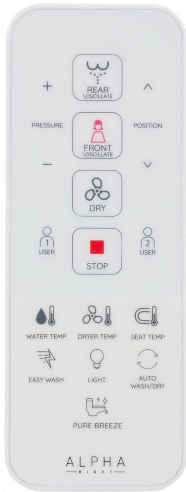
Figure 4: Remote Control Layout. This image details the various buttons and their corresponding functions on the remote control.