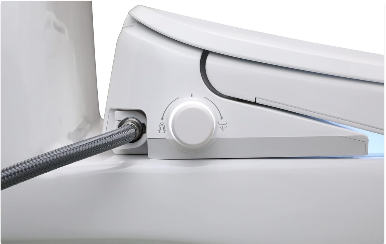
Figure 5: Side Control Knob. This image highlights the illuminated side control knob, offering manual operation of essential bidet functions.