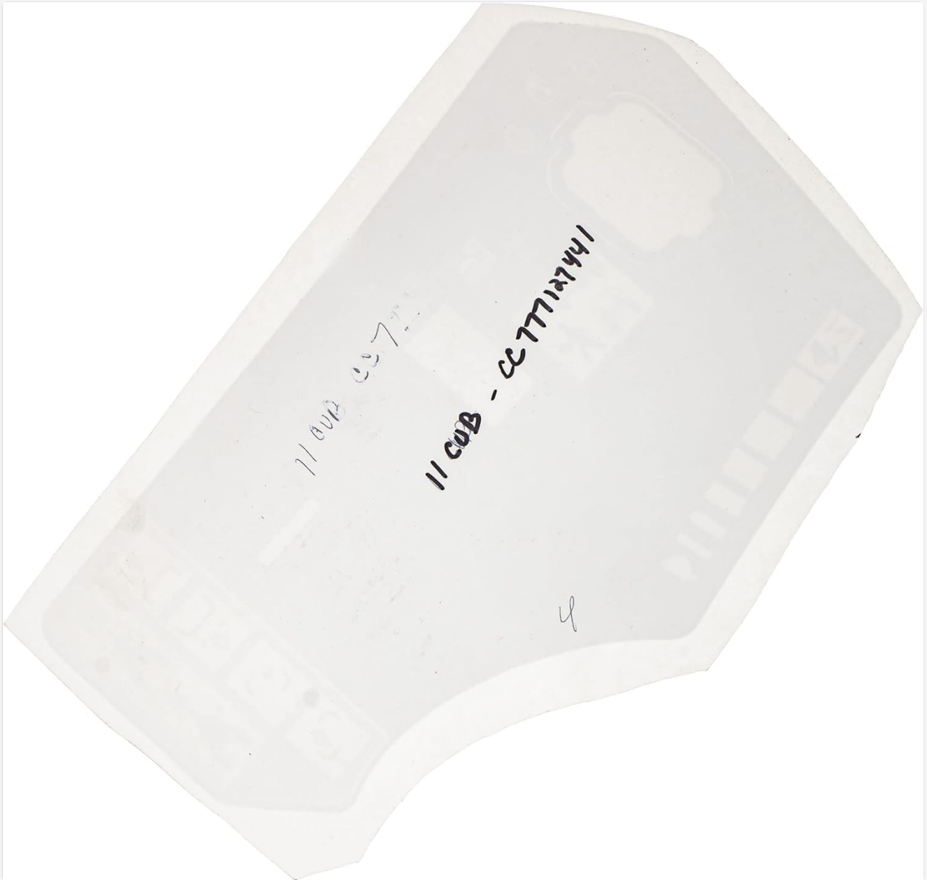
Figure 2: Back view of the CUB CADET 777127441 Control Panel Label, illustrating the adhesive backing that needs to be removed during installation.