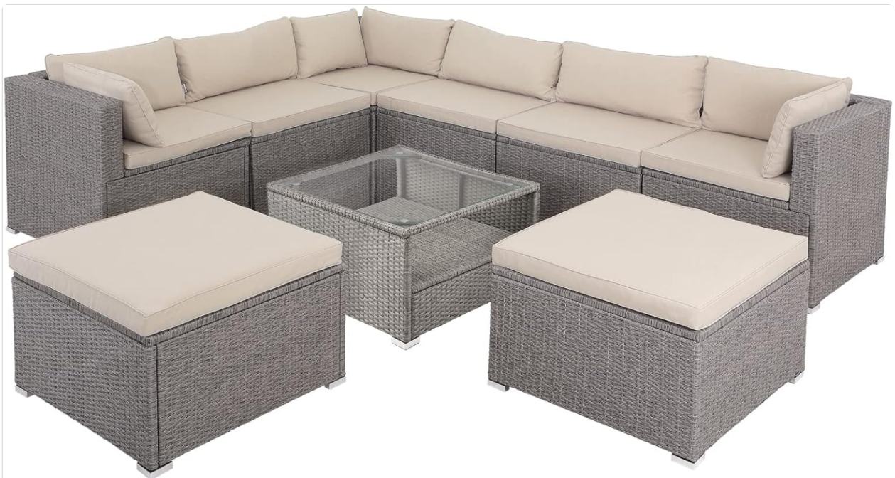
Image 1.1: Overview of the Casaria XXL Synthetic Rattan Garden Lounge Set.

This manual provides essential information for the safe and efficient assembly, operation, and maintenance of your Casaria XXL Synthetic Rattan Garden Lounge Set. Please read these instructions carefully before use and retain them for future reference.