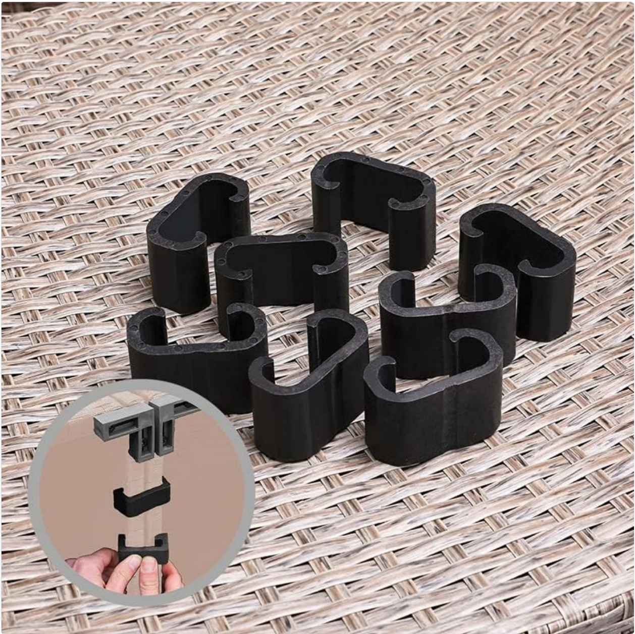
Image 2.1: Individual components and quantities included in the set.