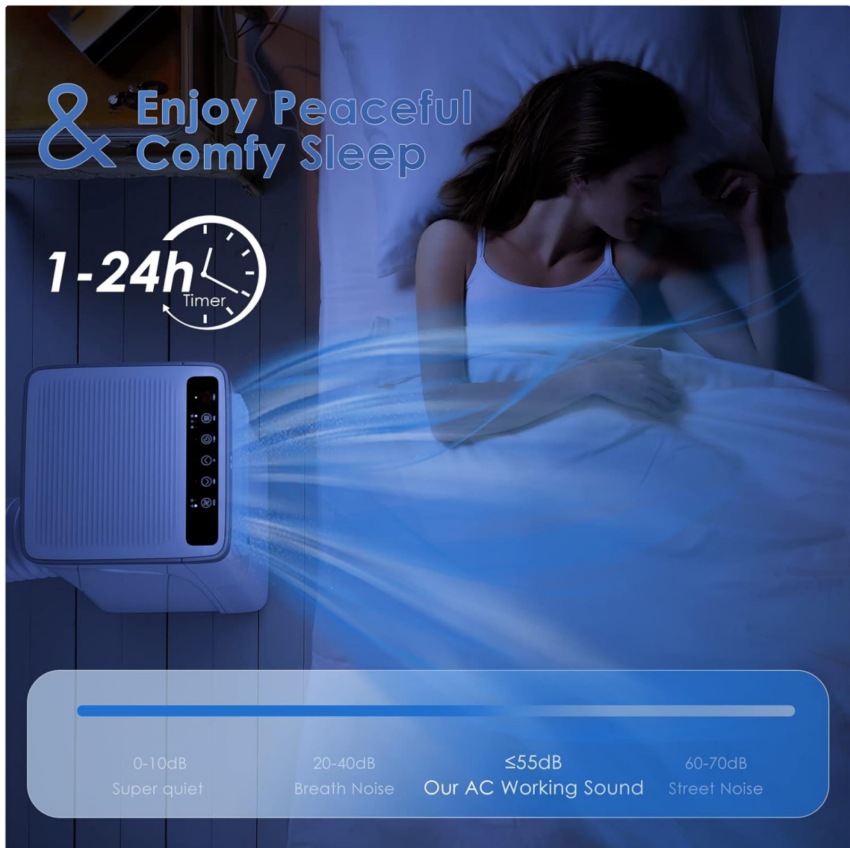
Figure 5: The air conditioner in a bedroom setting, demonstrating its quiet operation ( \leq 55\text{dB} ) and 1-24 hour timer for peaceful sleep.