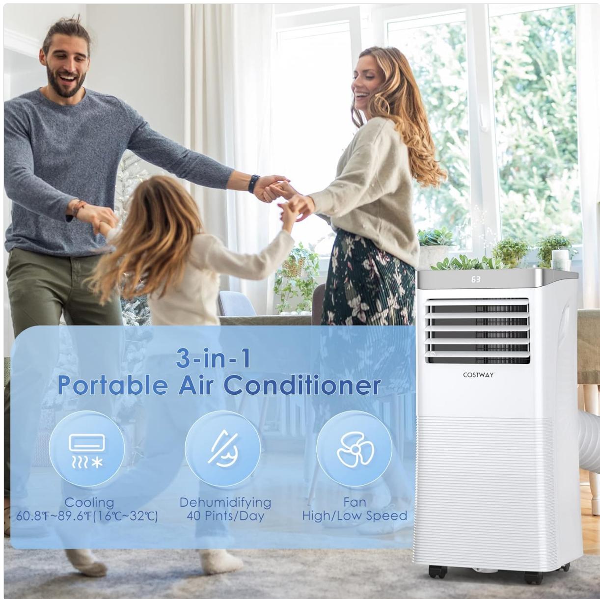
Figure 1: The portable air conditioner highlighting its three operational modes: cooling, dehumidifying, and fan.