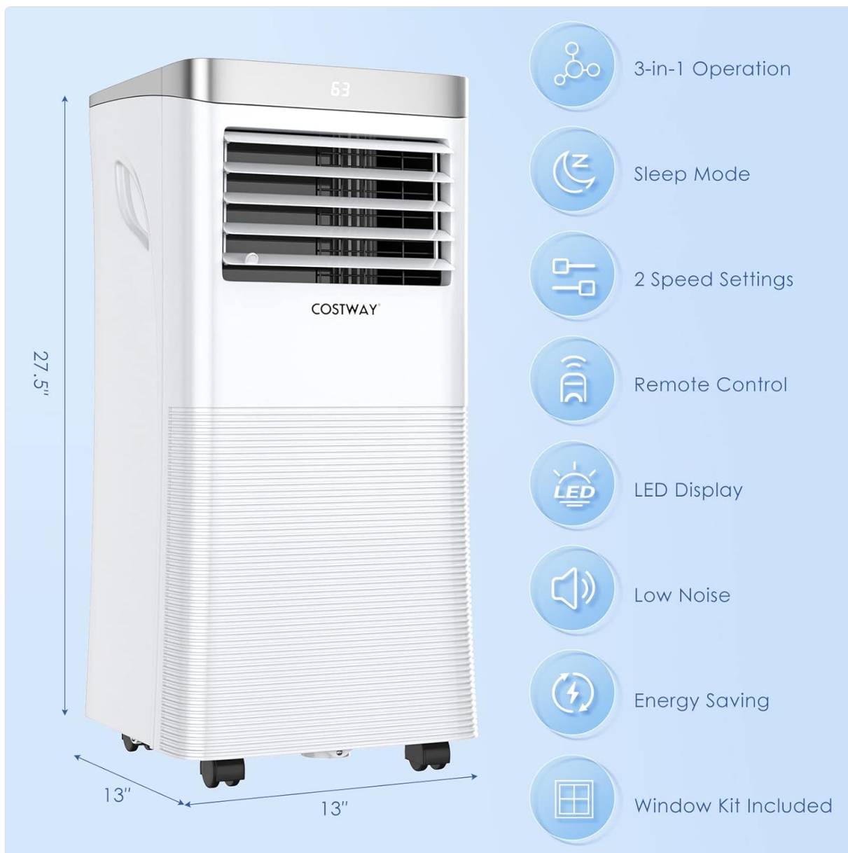
Figure 2: Side view of the unit displaying its dimensions (13"D x 13"W x 27.5"H) and key features such as 3-in-1 operation, sleep mode, 2 speed settings, remote control, LED display, low noise, energy saving, and included window kit.