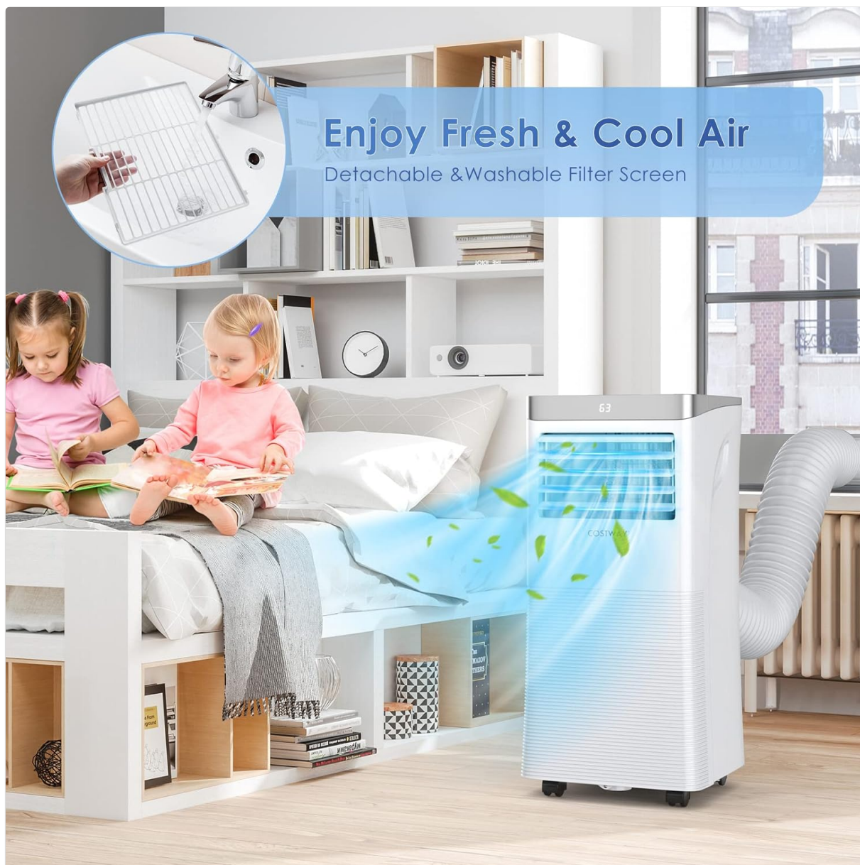
Figure 6: Demonstrating the removal of the detachable and washable filter screen for cleaning.

6. Clean the filter every two weeks or more frequently depending on usage and air quality.