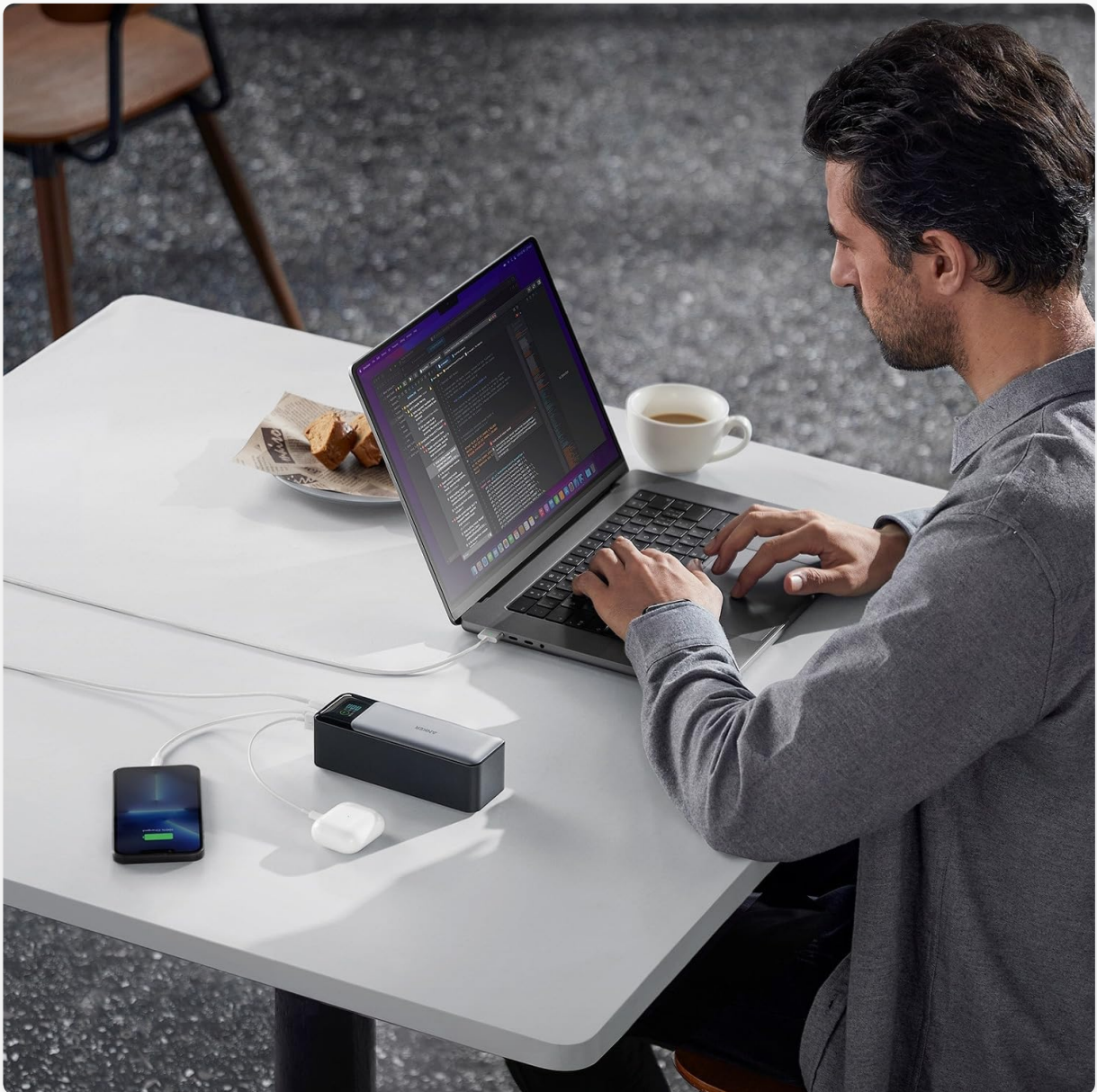
Figure 3: Charging Multiple Devices

The Anker 737 Power Bank supports charging up to three devices simultaneously. The total output power is dynamically distributed among the connected devices.