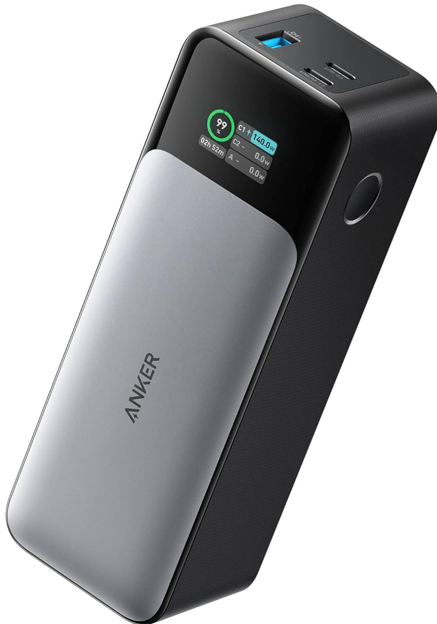
Figure 1: Anker 737 Power Bank (PowerCore 24K)