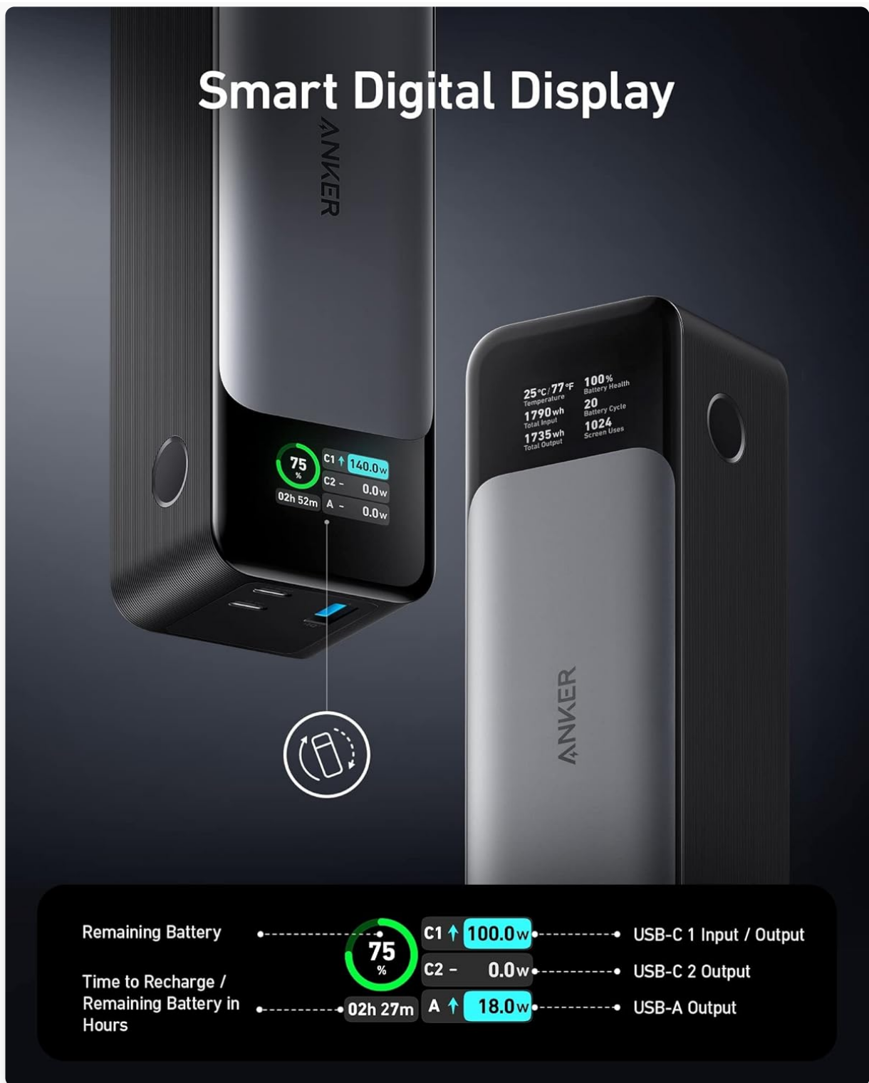
Figure 2: Smart Digital Display Interface