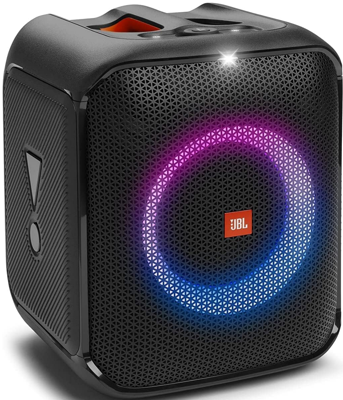
Image: The JBL Partybox Encore Essential speaker shown with its power cord, quick start guide, and safety sheet.