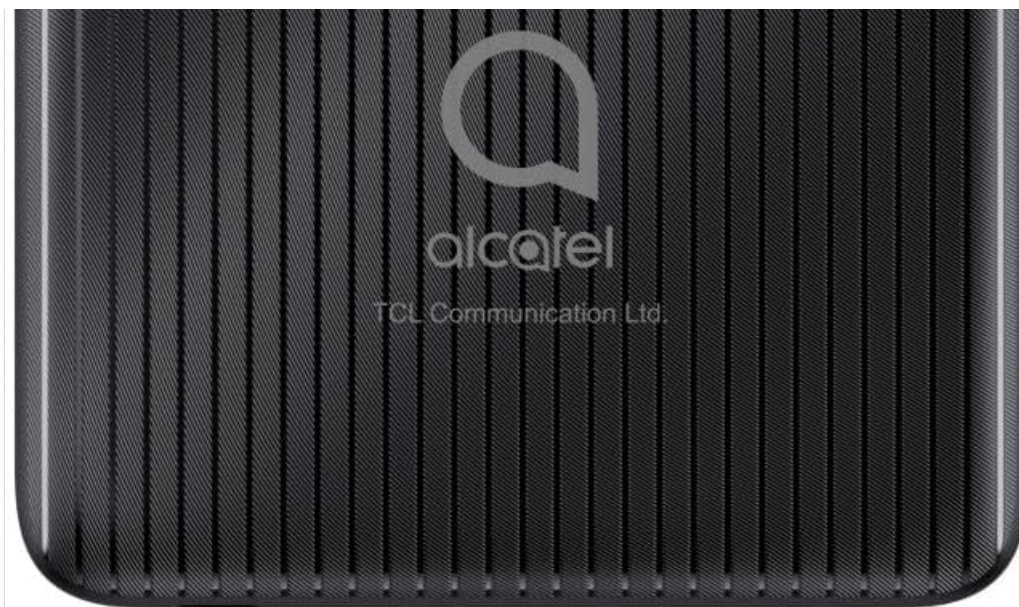
Image 2.1: Back view of the Alcatel 1B 2022 smartphone, showing the camera module and the Alcatel logo. The back cover needs to be removed to access SIM and MicroSD slots.