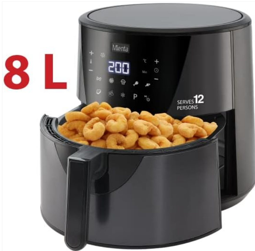
Figure 5: Example of food cooked in the air fryer basket, demonstrating its capacity.