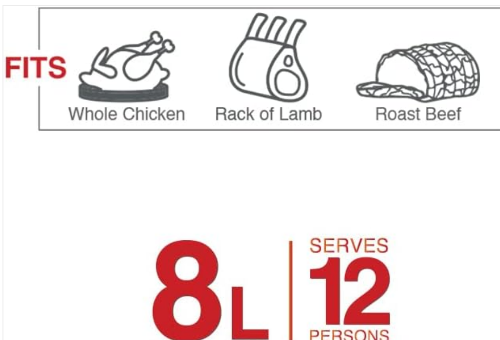
Figure 6: The 8-liter capacity can accommodate a whole chicken, rack of lamb, or roast beef, serving up to 12 persons.