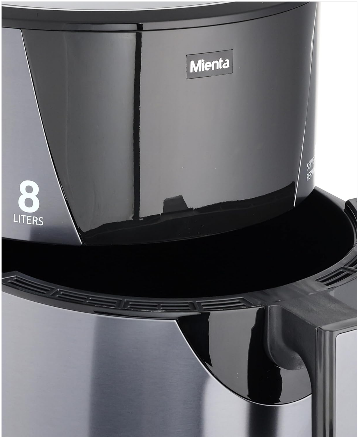
Figure 3: The air fryer with its non-stick basket removed, showing the interior cavity.