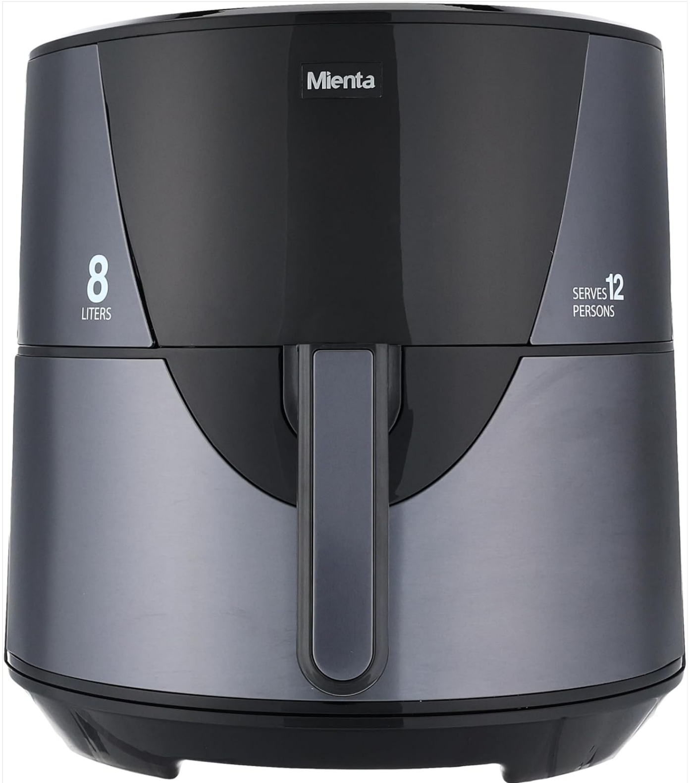
Figure 1: Front view of the Mienta Air Fryer AF47634A, showing the main unit and handle.

Familiarize yourself with the components of your Mienta Air Fryer.