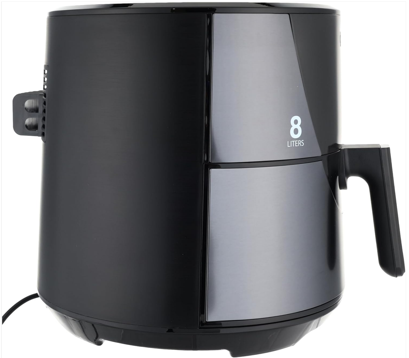
Figure 2: Side view of the Mienta Air Fryer AF47634A, highlighting its compact design.