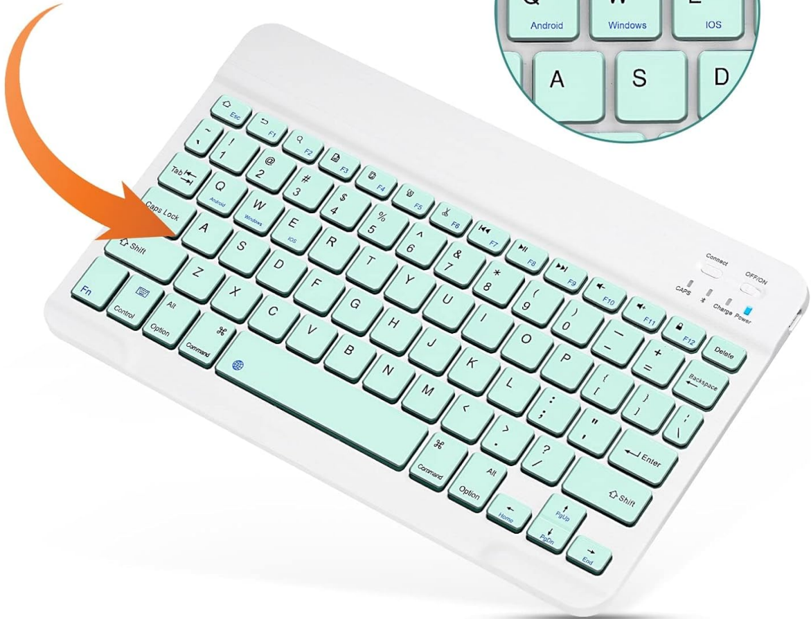
Image: UrbanX Bluetooth Keyboard highlighting its compatibility with iOS, Android, and Windows operating systems, indicated by respective logos.