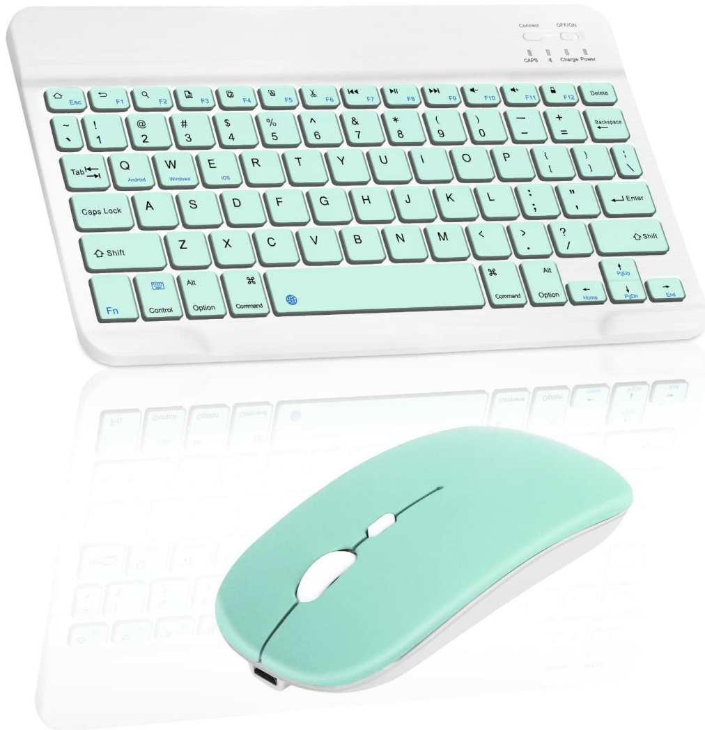
Image: UrbanX Bluetooth Keyboard showing the ON/OFF switch, Connect button, and indicator lights (CAPS, Charge Power). The image also illustrates the keyboard's dimensions.