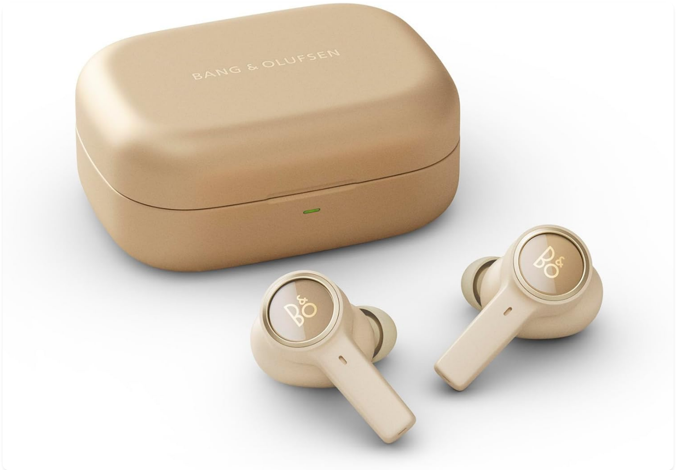
Image: Beoplay EX earphones and their charging case. The earphones are shown outside the case, positioned next to it. Both are in a gold tone finish.