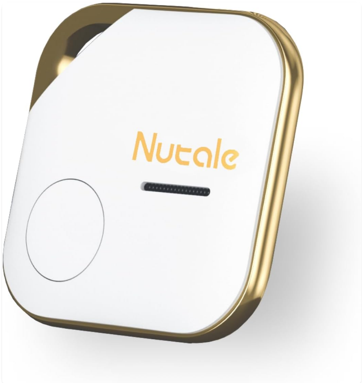
Image: The Nut Pro Key Finder Tag in white, featuring a minimalist design with the 'Nutale' logo and a single button.