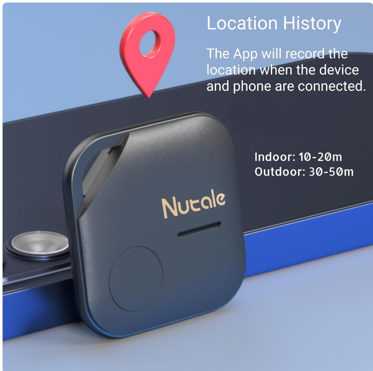
Image: A smartphone screen displaying a map with a pin indicating the last recorded location of a Nut Pro device, labeled 'Location History'.