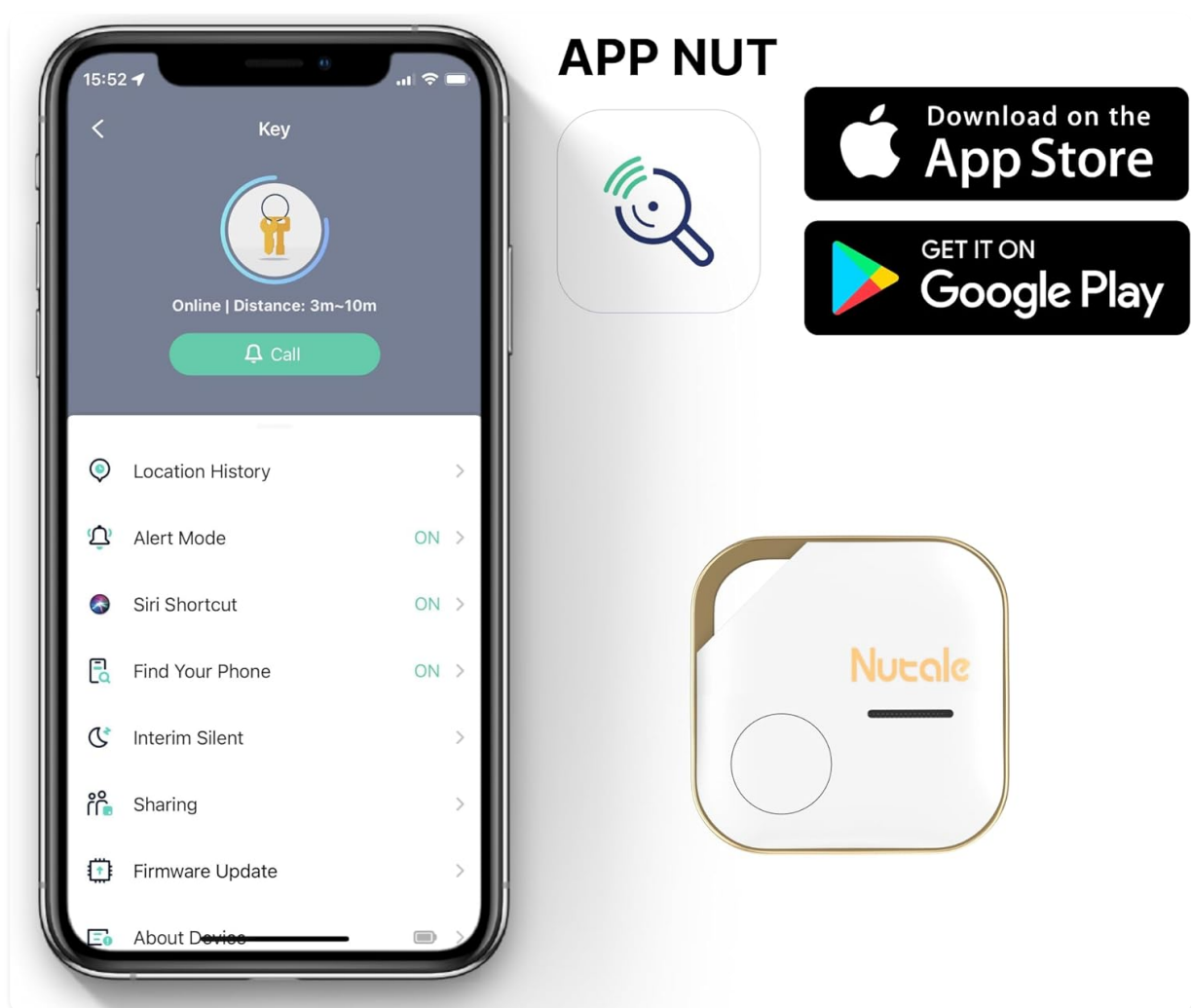
Image: A smartphone displaying the Nut App interface, alongside icons for downloading the app from Apple App Store and Google Play.