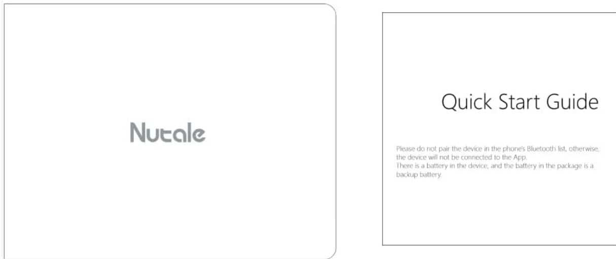
Image: Packaging for the Nut Pro device, indicating that one battery is included and showing a quick start guide.