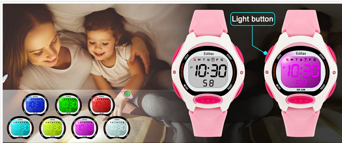
Image: Illustration of the Light button's function and the range of colorful LED backlights.