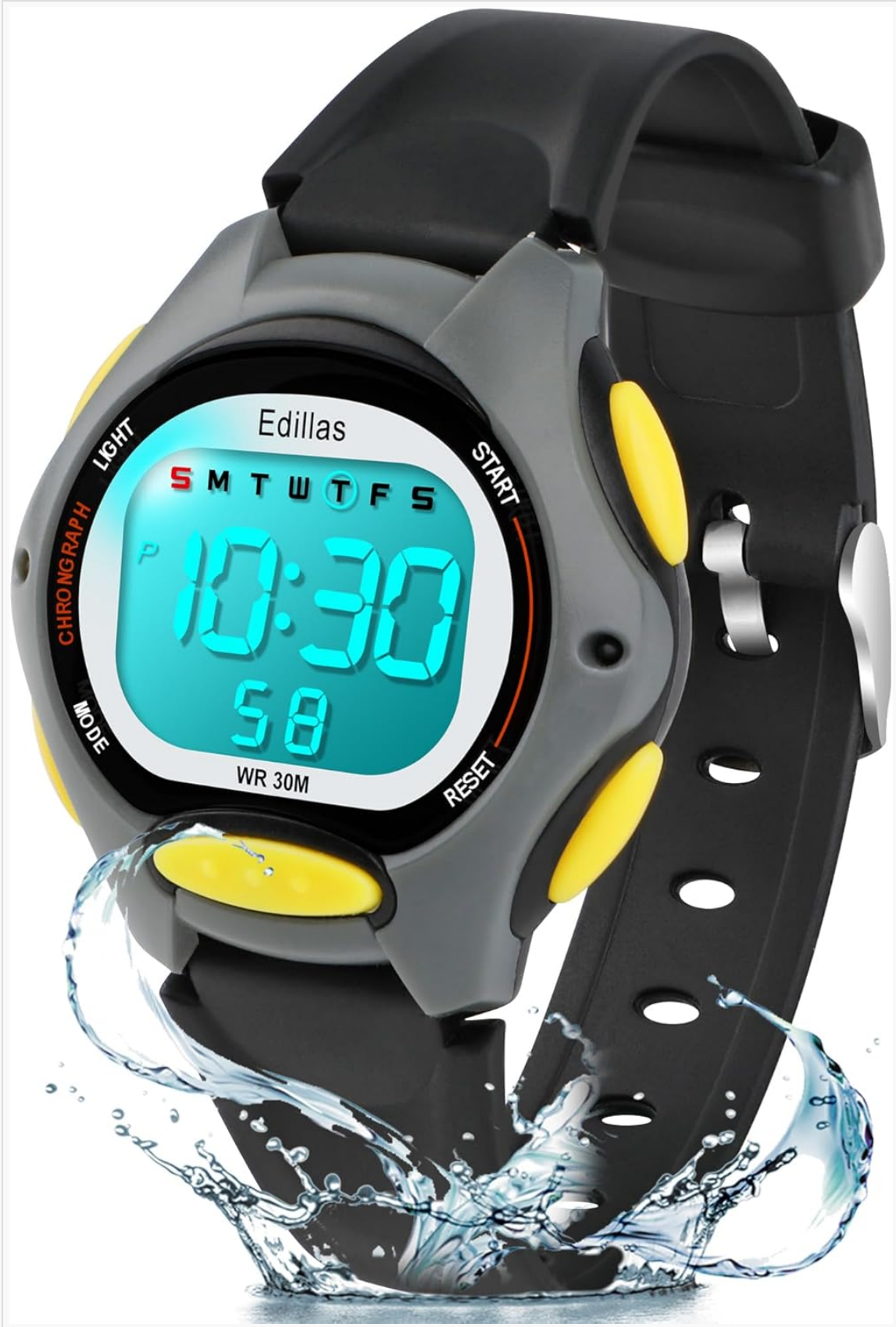
Image: Front view of the Edillas Kids Digital Watch, displaying 10:30 with water splashes, highlighting its water resistance.