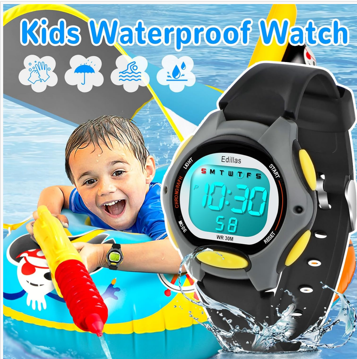
Image: A child wearing the watch, with various watch faces demonstrating the seven available LED backlight colors.

Press the Light (L) button to illuminate the watch face. The watch supports 7 different colors (blue, green, red, light blue, yellow, purple, white) and a colorful flashing mode. Press the Light (L) button repeatedly to cycle through the colors and flashing mode.