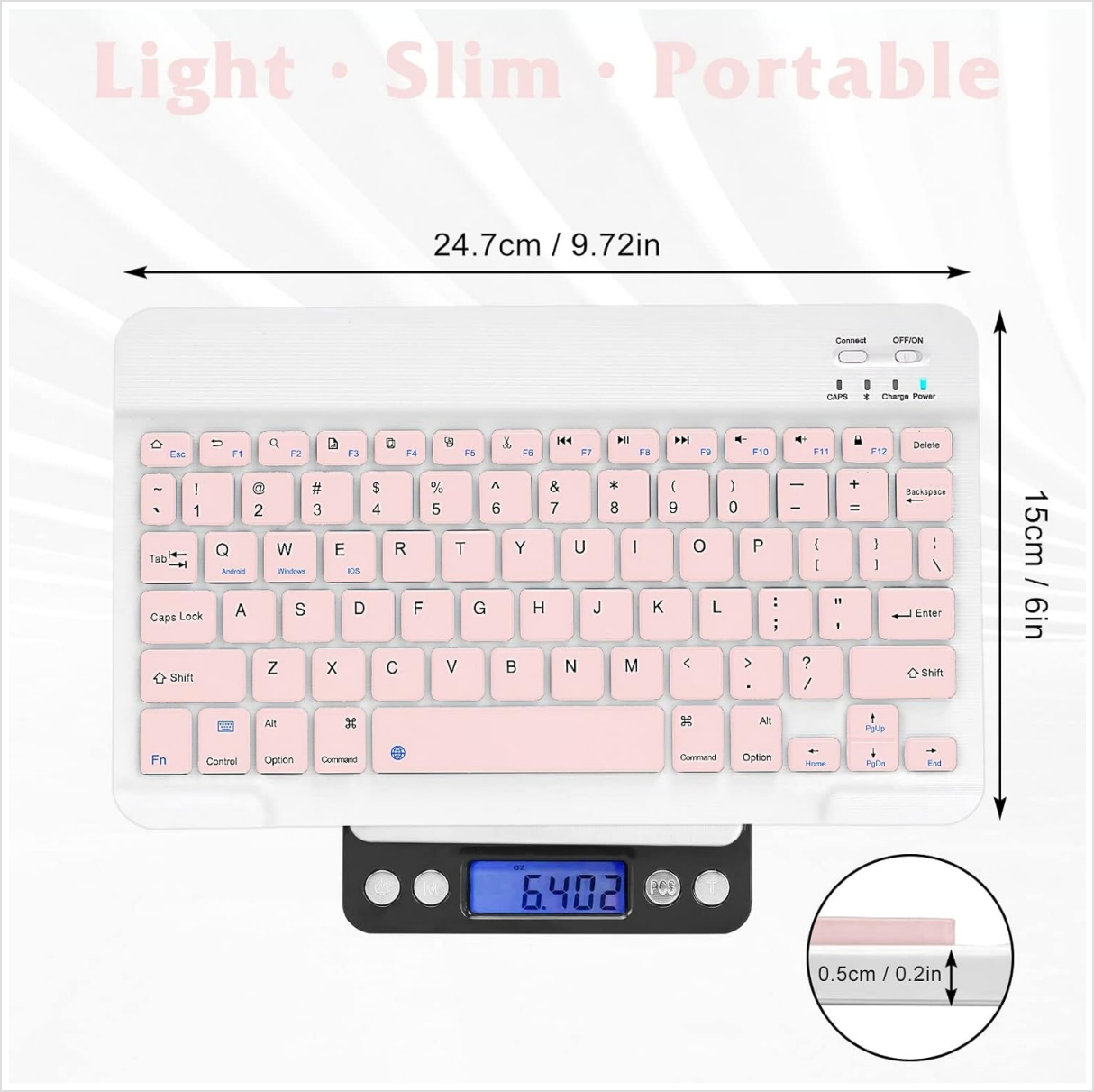
Image: The keyboard shown with its physical dimensions (24.7cm / 9.72in length, 15cm / 6in width, 0.5cm / 0.2in thickness) and weight (6.402 ounces).