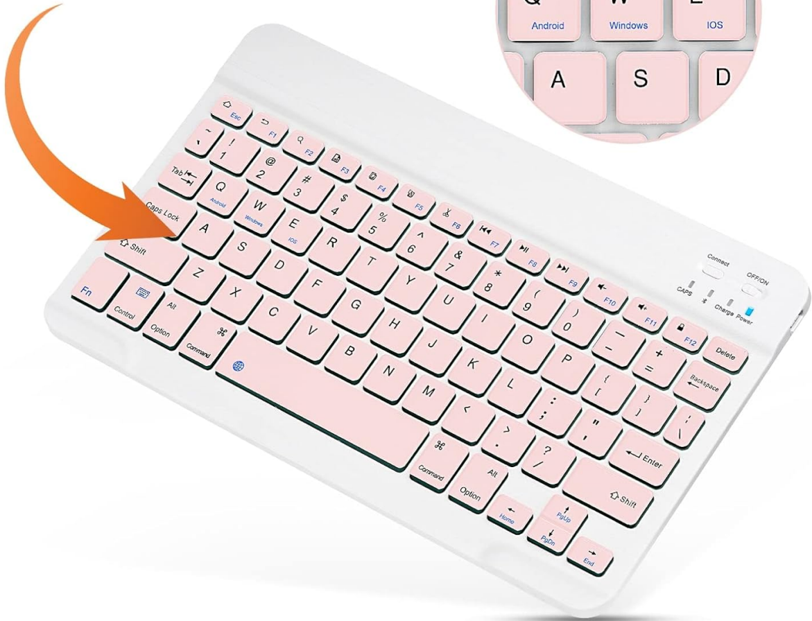
Image: The keyboard displaying icons for iOS, Android, and Windows, indicating multi-OS compatibility.