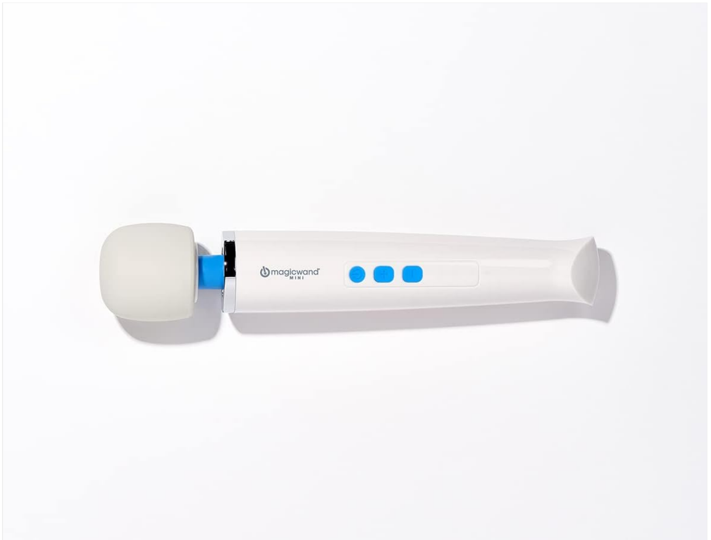
Image: The Magic Wand Mini HV-135 massager, shown in white with blue control buttons and a soft white silicone head. This image illustrates the overall design of the product.