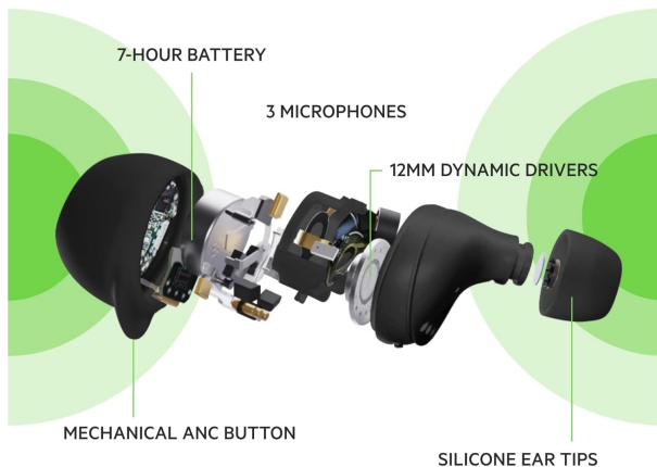
An exploded view illustrating the premium components of the SoundForm Immerse earbud, including 12mm dynamic drivers, 3 microphones, and a mechanical ANC button.