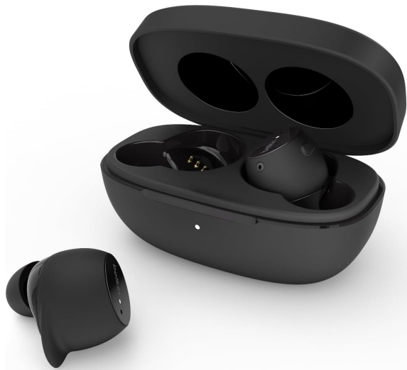
The Belkin SoundForm Immerse Noise Cancelling Earbuds in their charging case.